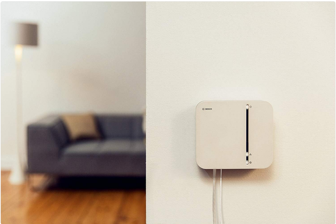
Image: The Bosch Smart Home Controller shown with its power supply, network cable, and wall mount.

Your browser does not support the video tag.