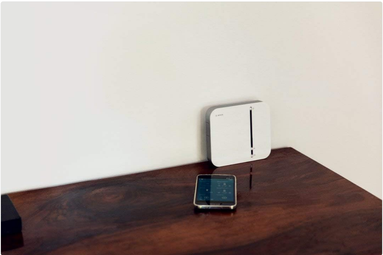
Image: The Bosch Smart Home Controller positioned on a wooden surface, with a smartphone nearby showing the Bosch Smart Home app interface.