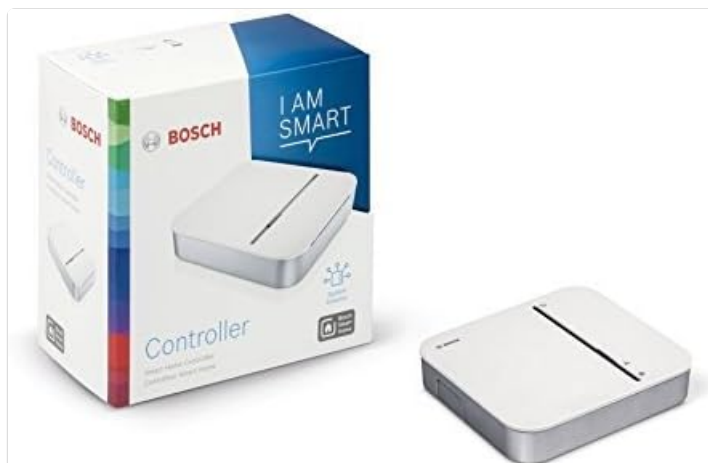
Image: Bosch Smart Home Controller and its retail packaging.