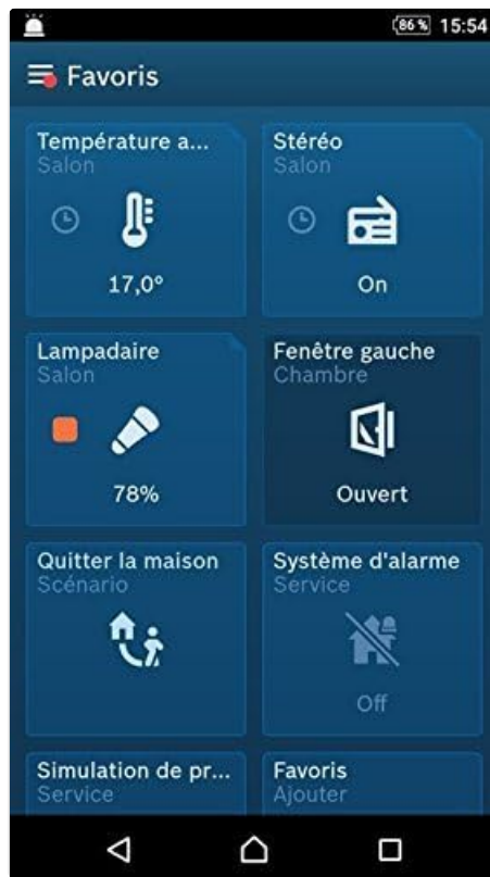
Image: A screenshot of the Bosch Smart Home app displaying various smart home device controls and status indicators.