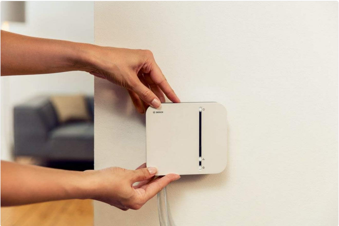
Image: Hands demonstrating the installation of the Bosch Smart Home Controller on a wall, showing its compact form factor.