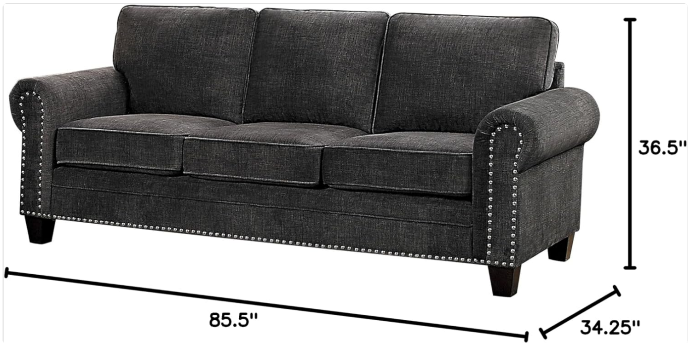
Image 3.1: Dimensional diagram of the sofa, indicating overall length (85.5"), depth (34.25"), and height (36.5").

Your browser does not support the video tag.