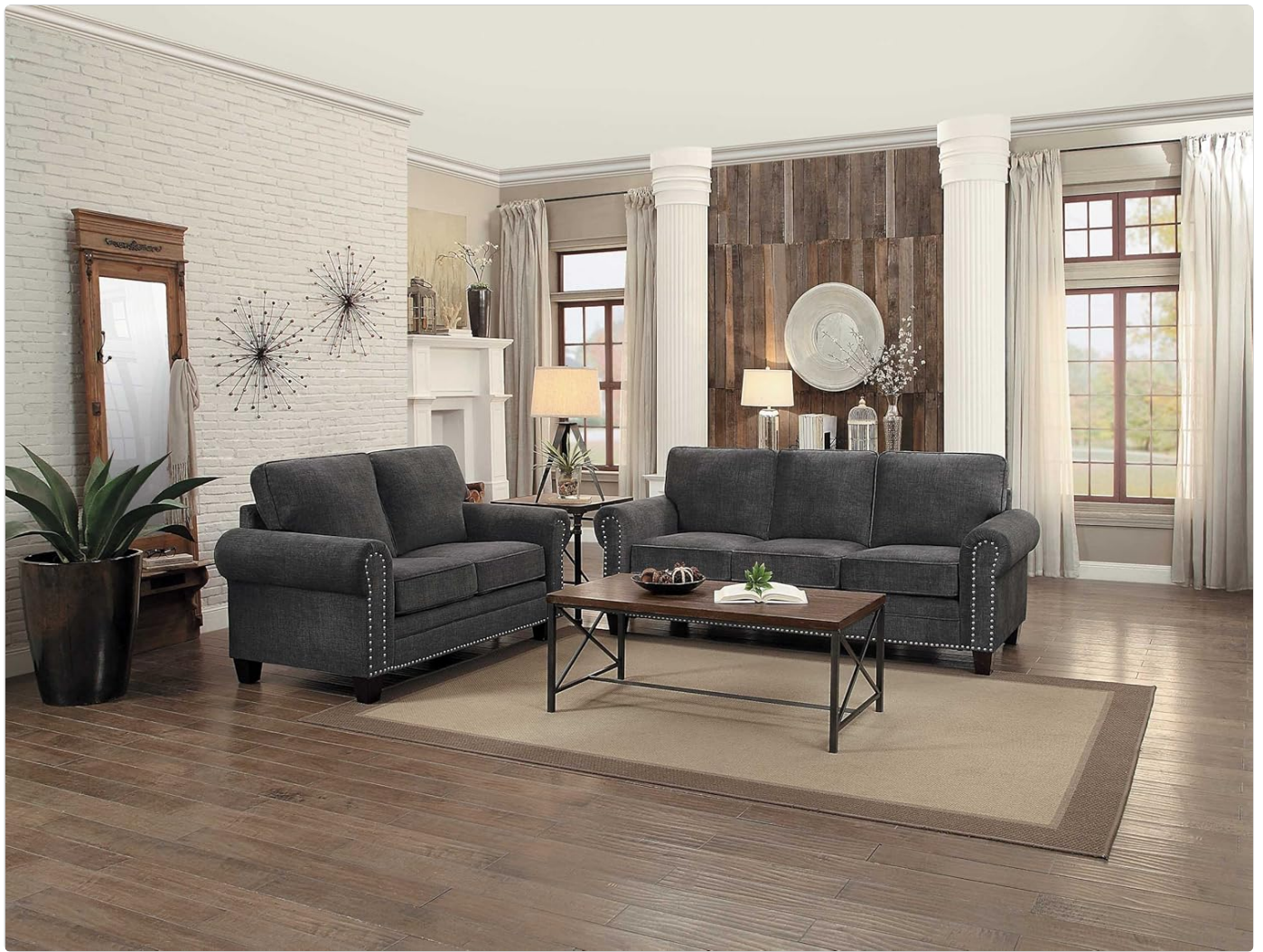
Image 1.1: The Homelegance Cornelia 86" Fabric Sofa in a dark gray finish, shown in a living room environment.