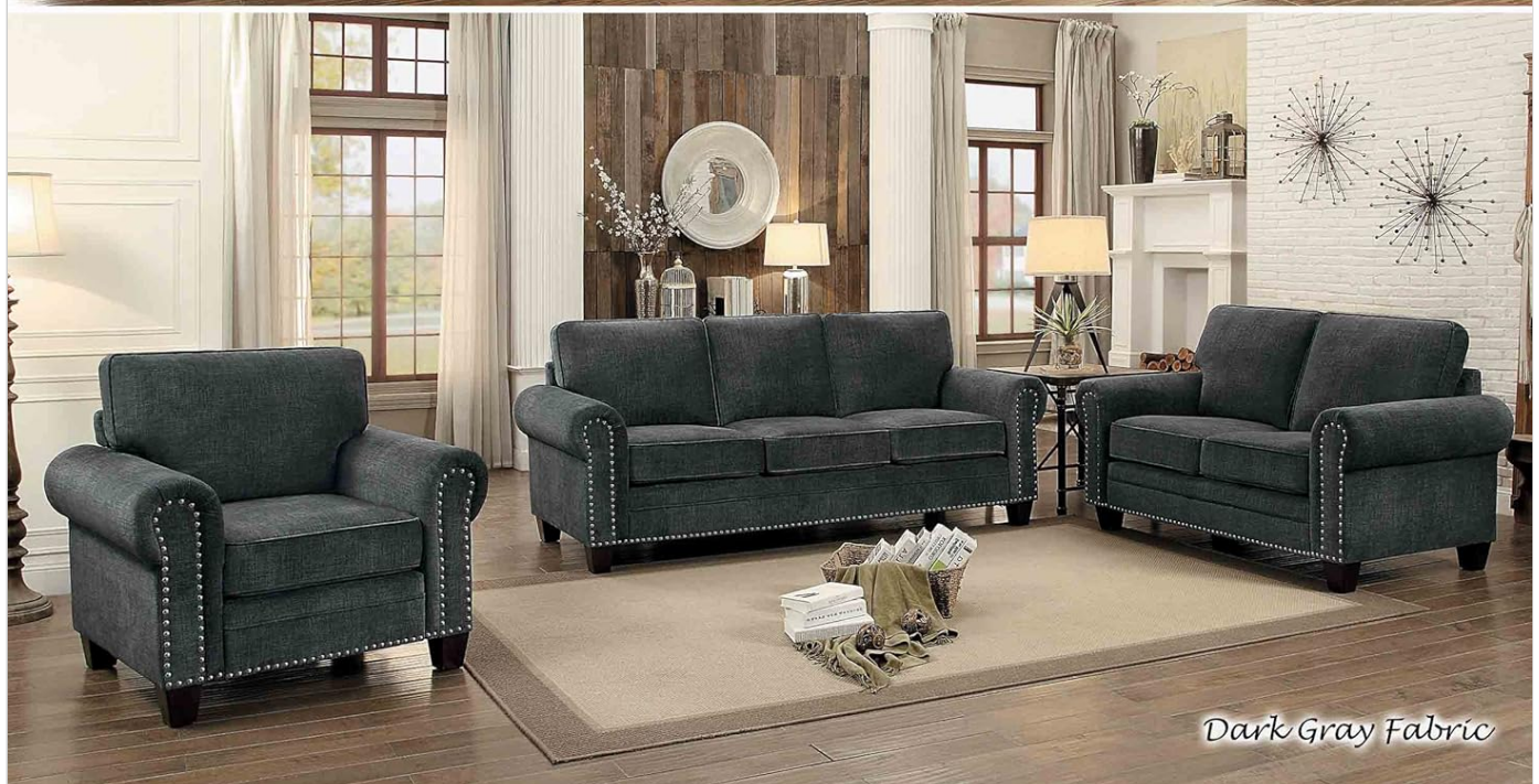
Image 7.1: The Homelegance Cornelia collection, illustrating the sofa and matching pieces in both dark gray and sand fabric finishes.