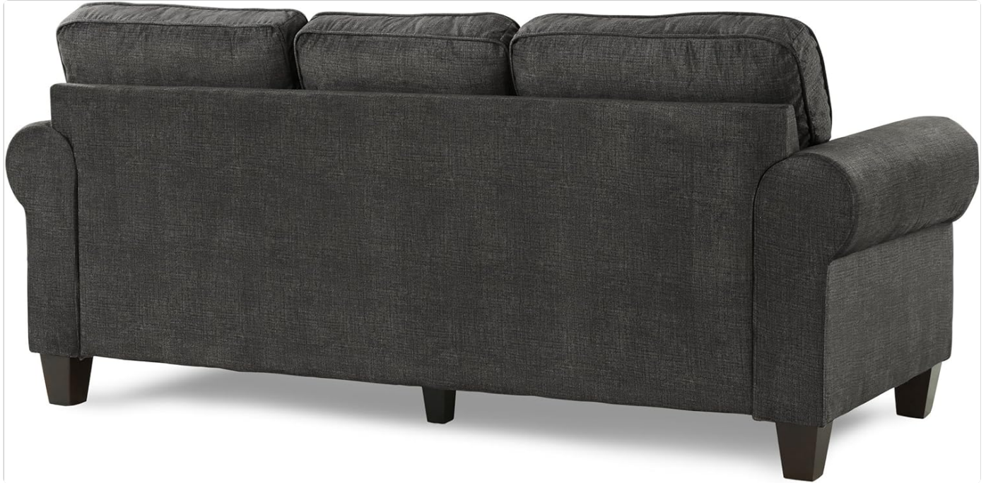
Image 6.1: Rear view of the Homelegance Cornelia Sofa, showing the solid back construction.