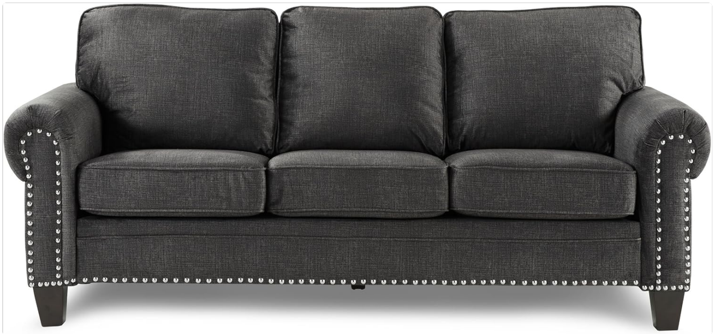
Image 4.1: Front view of the Homelegance Cornelia Sofa, showcasing its three seat cushions and rolled arms with nail head trim.