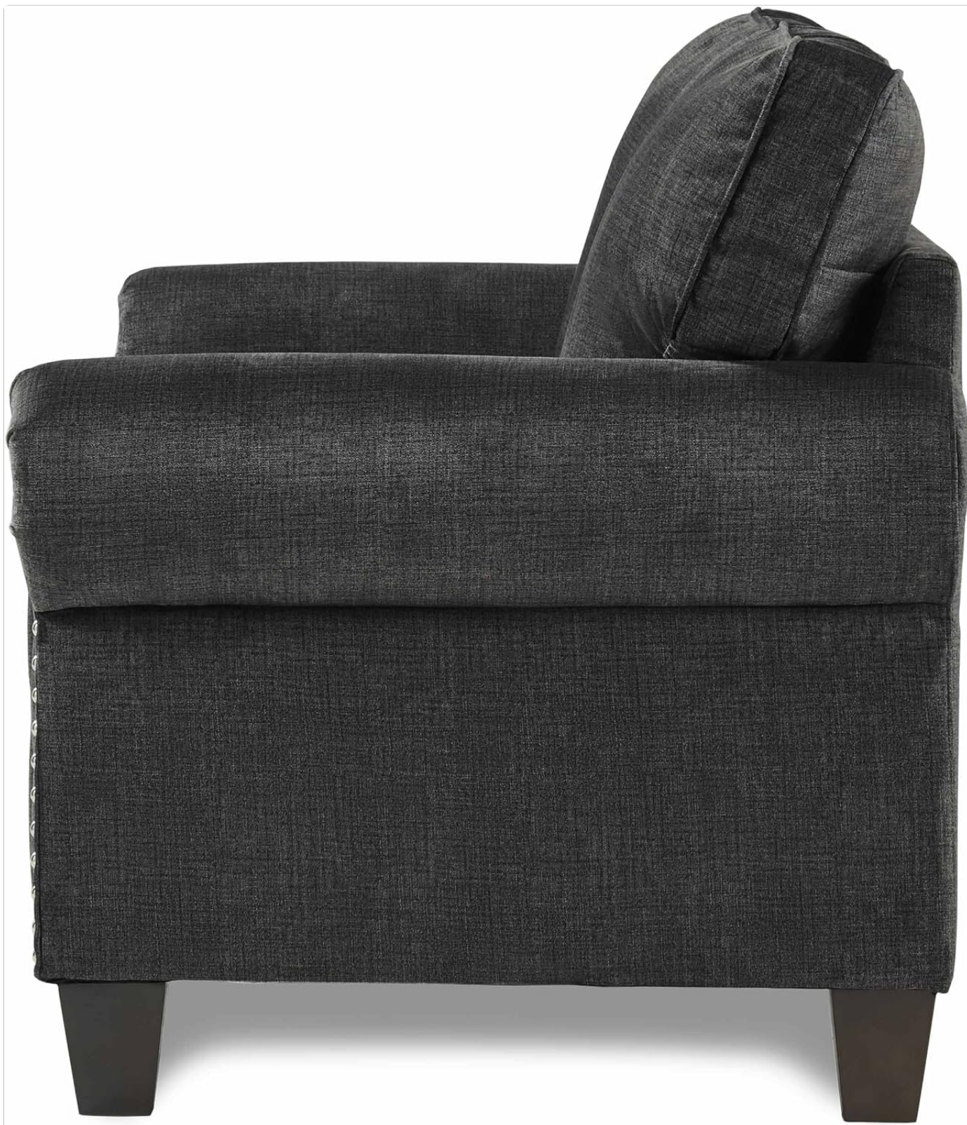
Image 5.1: Side view of the Homelegance Cornelia Sofa, highlighting the rolled arm design and nail head detailing.