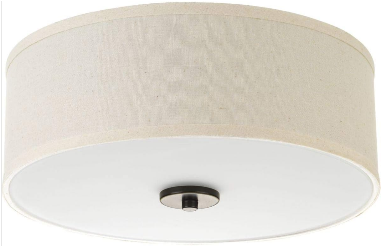
Figure 1: Progress Lighting Inspire LED Flush Mount Fixture (P3696-2030K9) in Antique Bronze. This image shows the complete assembled light fixture.