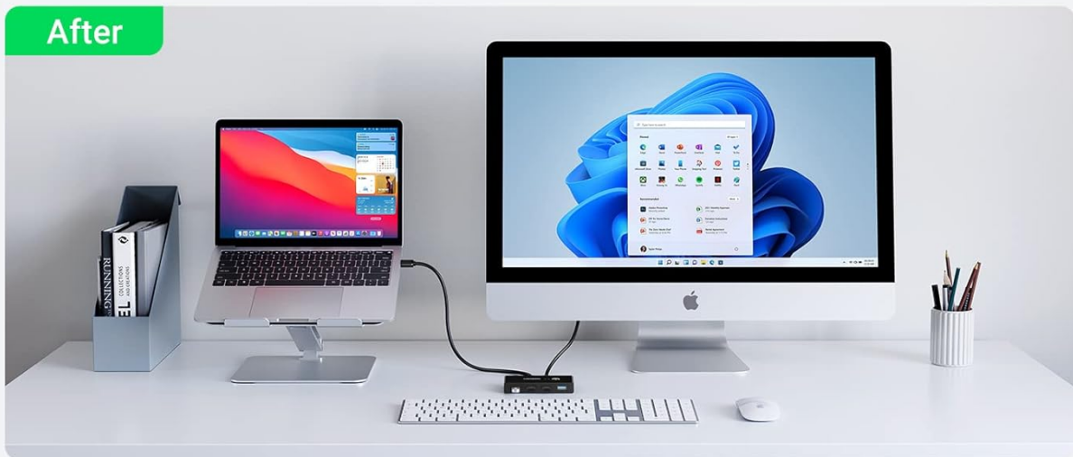
Image: Before and After using the UGREEN USB 3.0 Switch Selector, illustrating how the device helps declutter a workspace by allowing two computers to share peripherals.