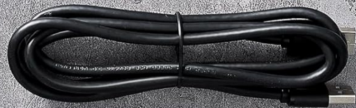
Image: The package contents of the UGREEN USB 3.0 Switch Selector, showing the main unit, two USB 3.0 data cables, and the included user manual.