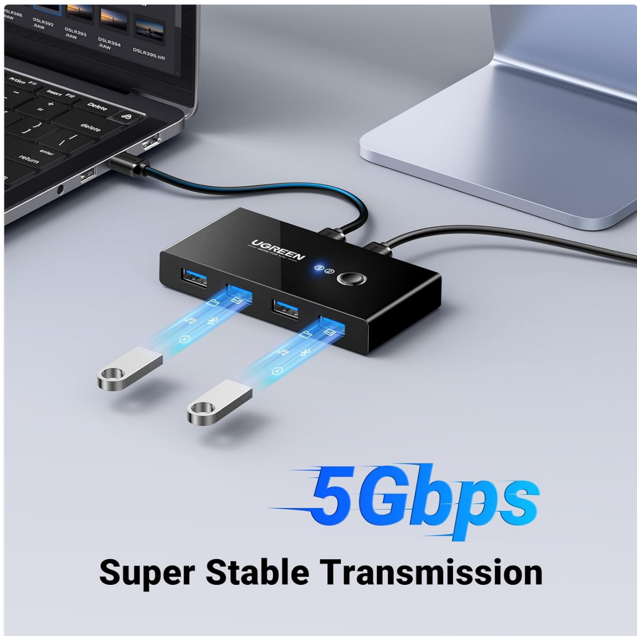
Image: The UGREEN USB 3.0 Switch Selector with USB drives connected, emphasizing its capability for 5Gbps high-speed data transmission.