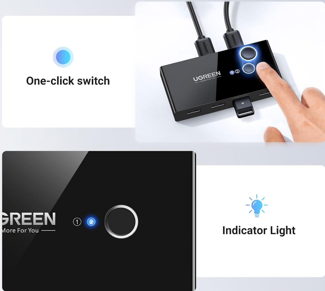
Image: A close-up view of the UGREEN USB 3.0 Switch Selector, highlighting the prominent one-click switch button and the two LED indicator lights.