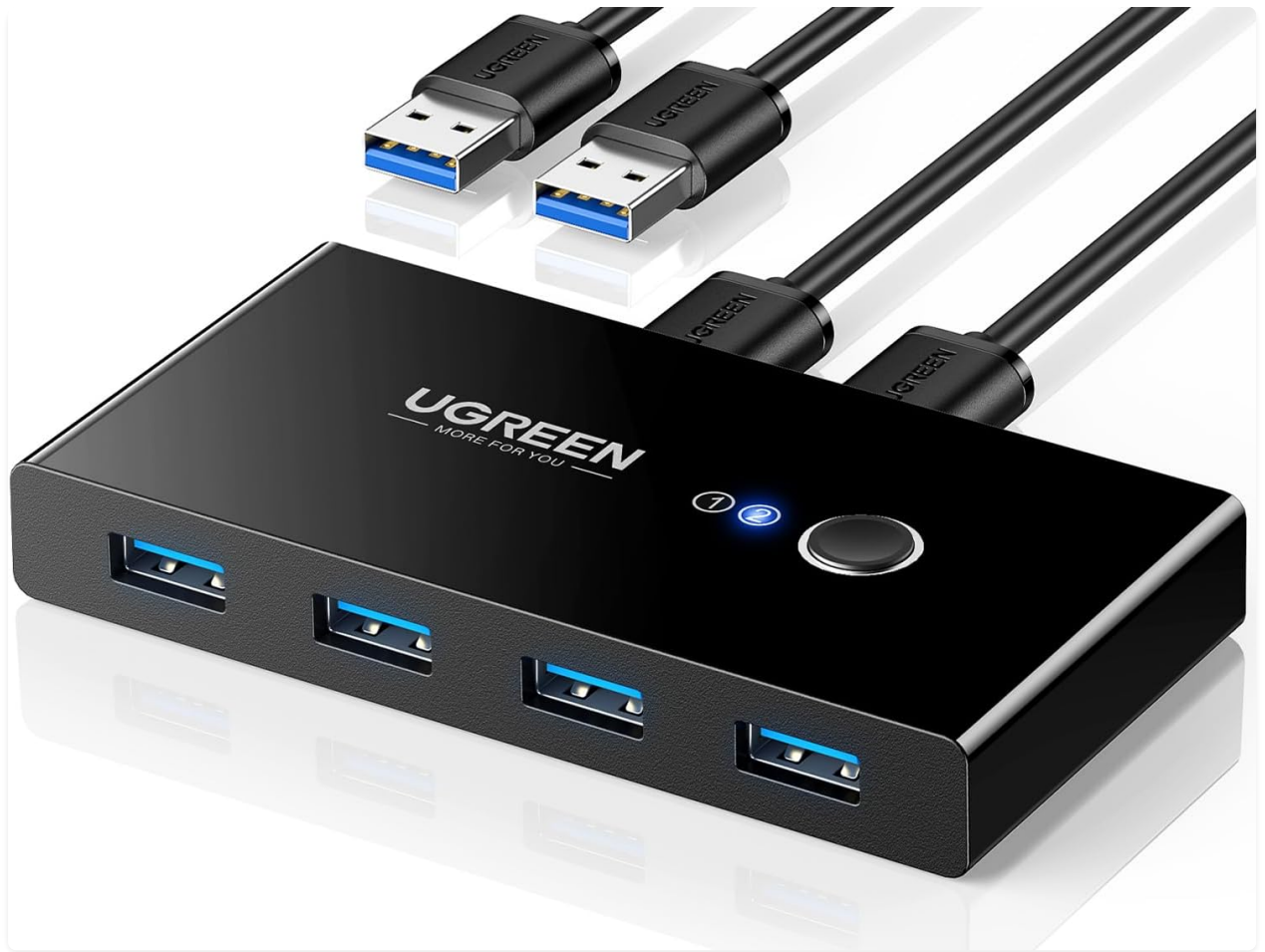
Image: The UGREEN USB 3.0 Switch Selector with its input cables connected and various USB devices, such as USB drives, plugged into its four output ports.