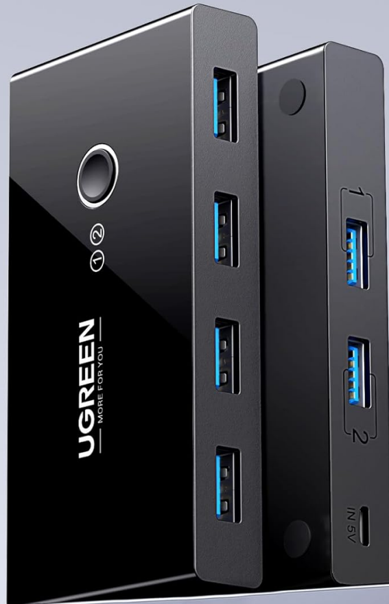
Image: A visual representation of the UGREEN USB 3.0 Switch Selector's broad compatibility across various operating systems like Windows, macOS, Chrome OS, and Linux.