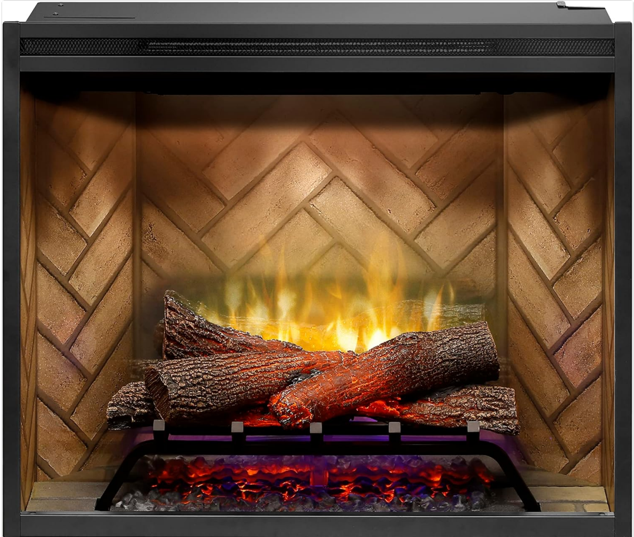
Figure 3: Realistic Flame Effect and Glowing Logs.

Experience a larger, brighter, and more random flame display with the partially frosted Mirage Flame Panel. The full grate of life-size hardwood-cast logs is tiered for greater depth, enhancing the visual realism. Use the controls to toggle between various light and color settings to customize the flame appearance.