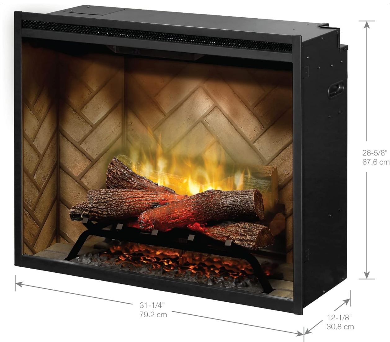
Figure 4: Detailed view of the flame and log set.