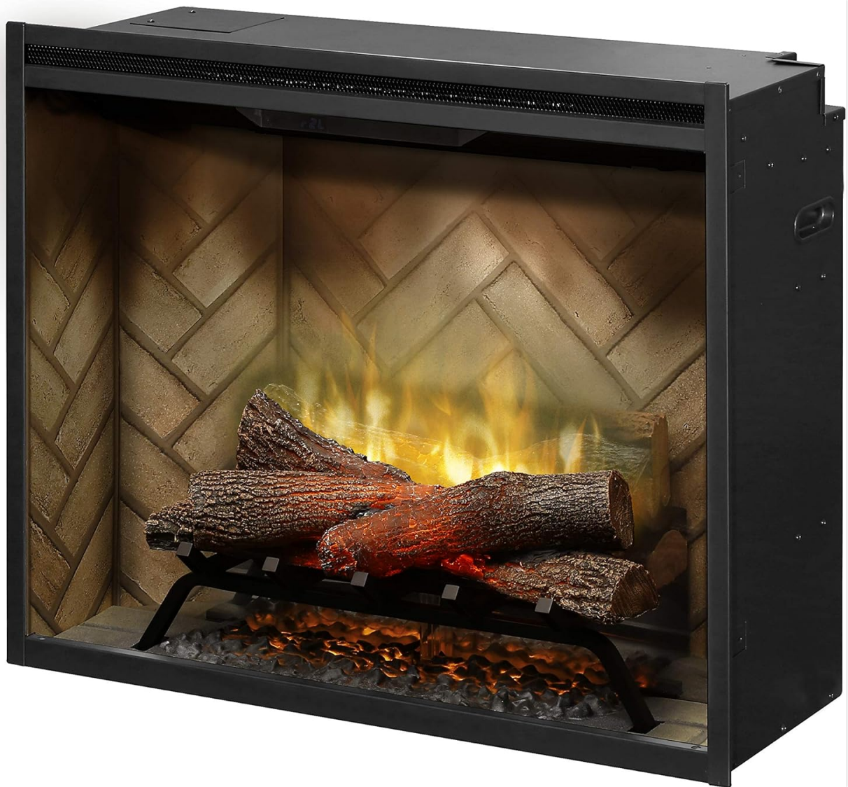
Figure 1: Dimplex Revillusion 30-inch Electric Firebox with Herringbone Interior.