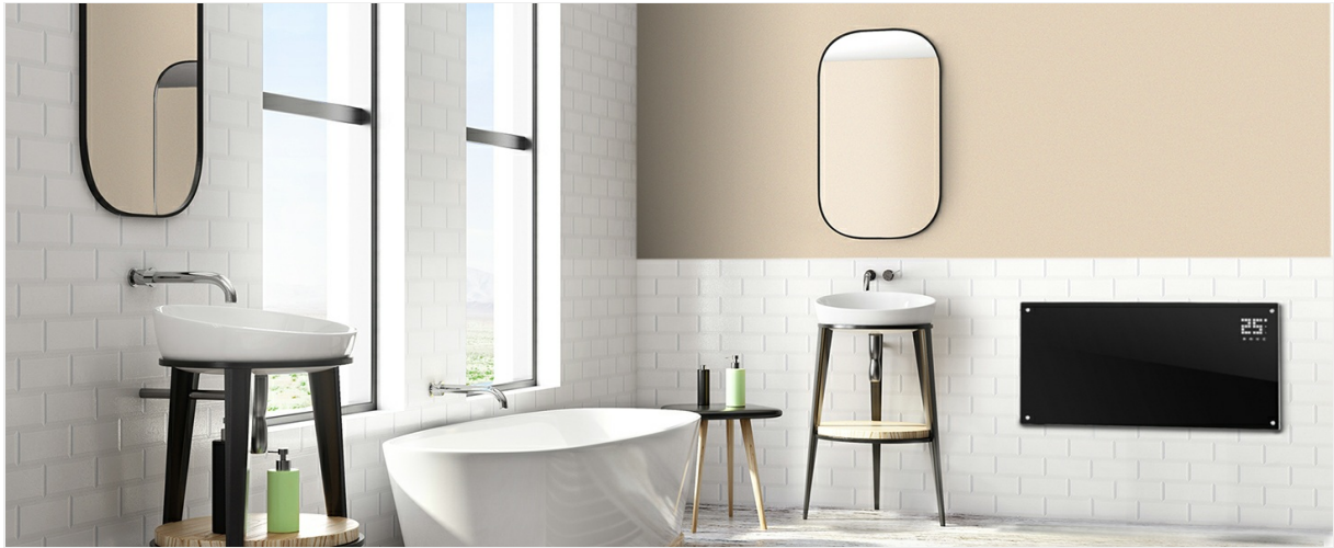
Figure 3.1: The heater can be used freestanding with wheels or mounted on a wall.