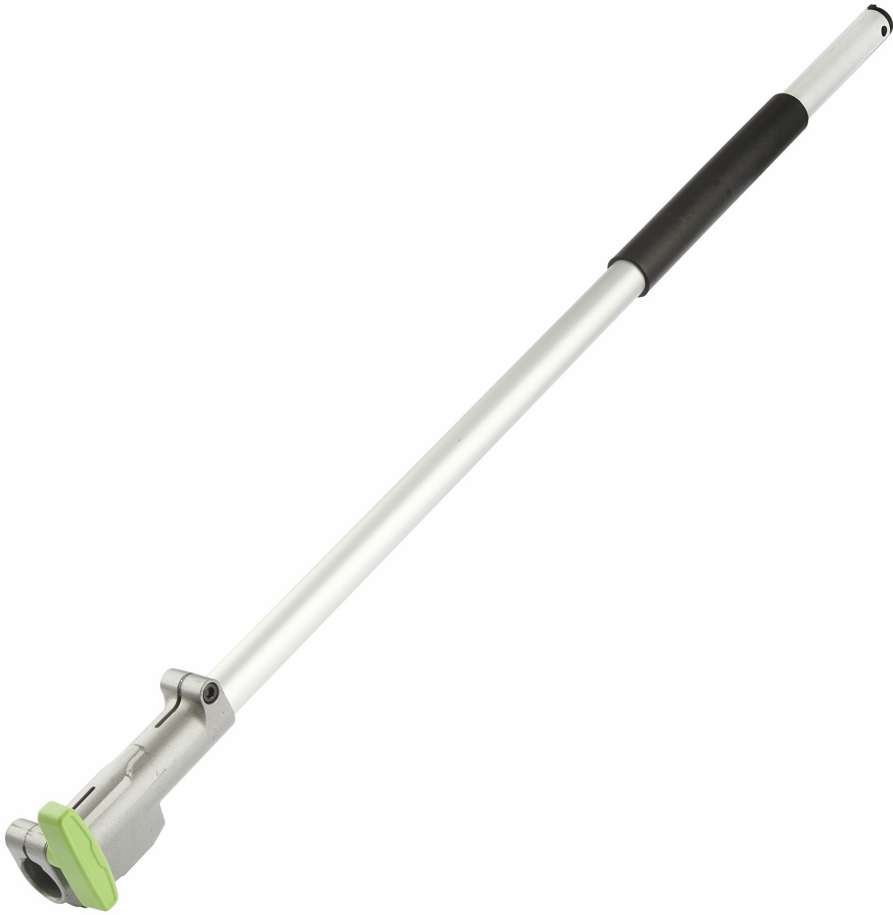
Image 1: The EGO Power+ EP7500 31-inch extension pole attachment, showcasing its design and length.