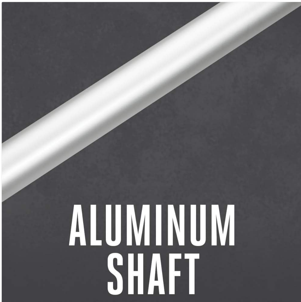
Image 6: A close-up view highlighting the durable aluminum shaft construction of the extension pole.