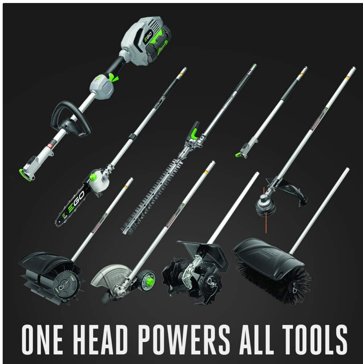
Image 7: An illustration of the EGO Power+ multi-head system, demonstrating how one power head can be used with various attachments, including the extension pole.