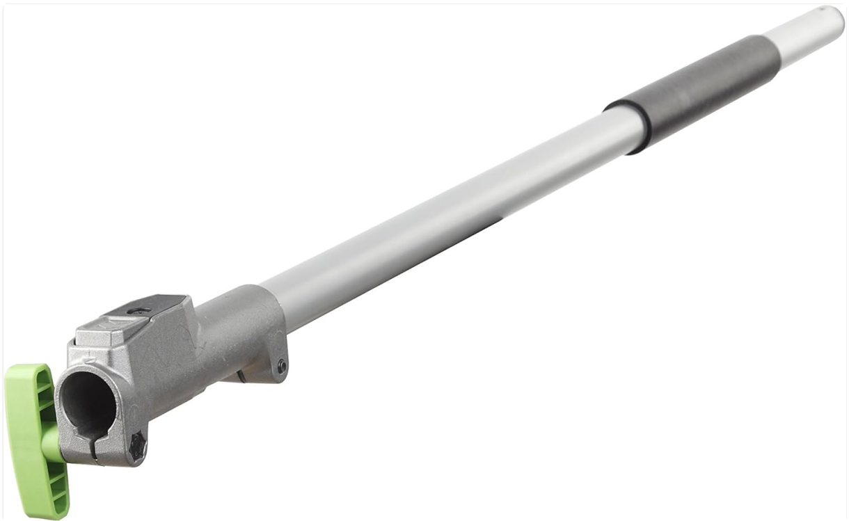
Image 2: The EGO Power+ EP7500 extension pole as it appears upon unboxing, highlighting its construction.