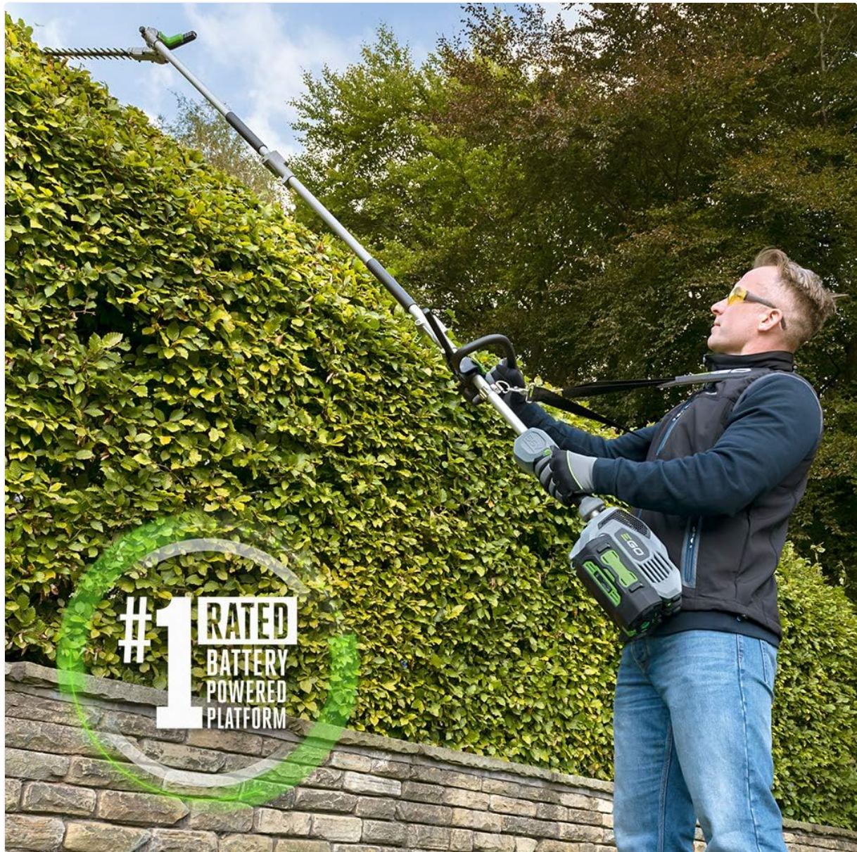
Image 4: An individual utilizing the EGO Power+ extension pole with a hedge trimmer attachment to reach and trim tall hedges effectively.

The rubberized handle on the pole assists in balancing the tool, providing better control and reducing fatigue during extended use.