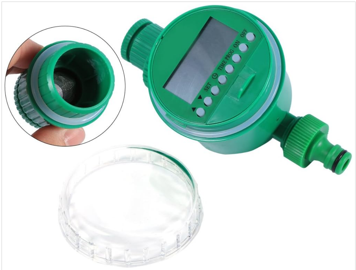
Figure 4: The water timer with its protective cover and internal filter, which should be checked during setup.