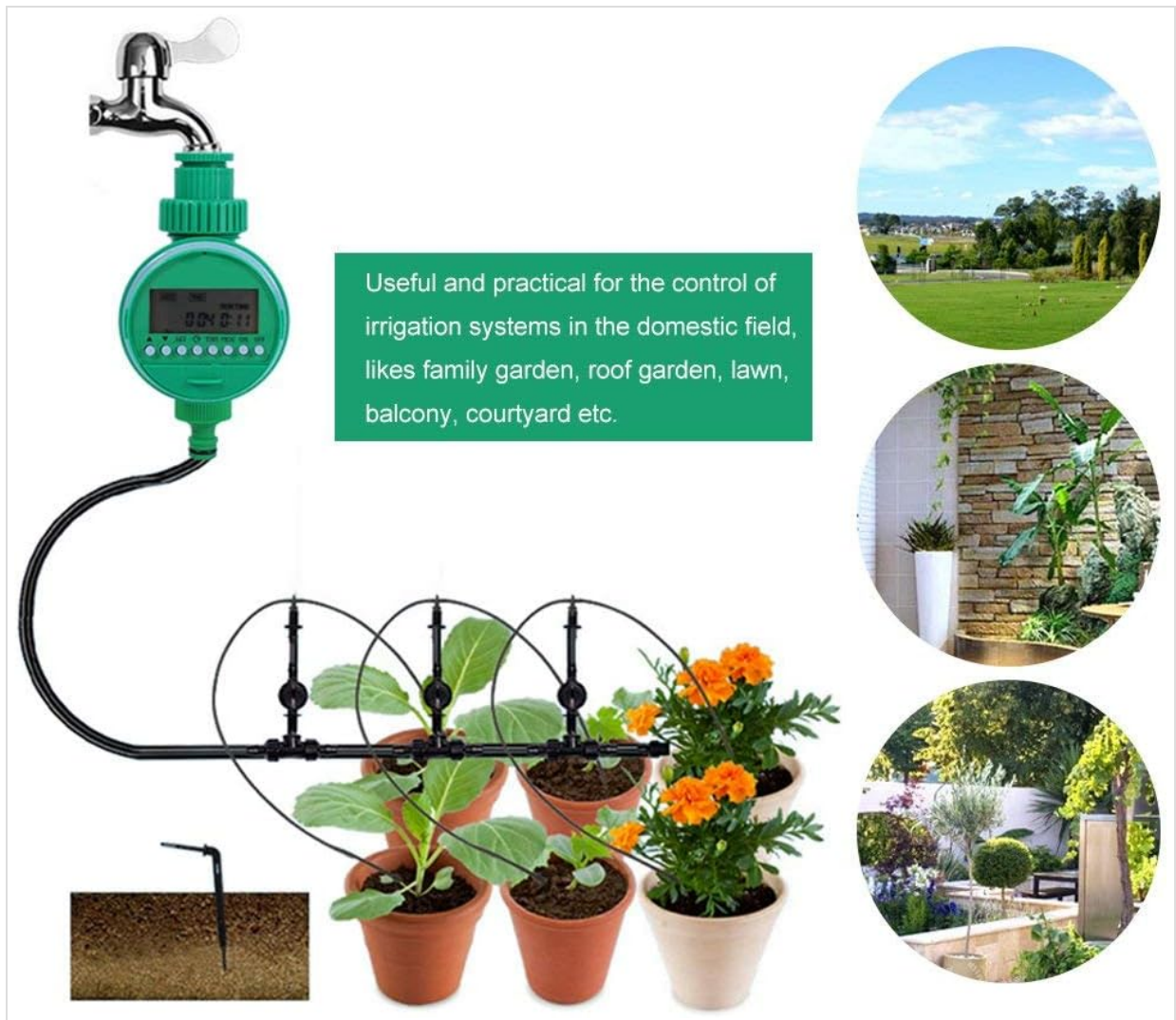
Figure 5: The water timer in an application setting, highlighting its utility for home gardens, roof gardens, lawns, balconies, and courtyards.