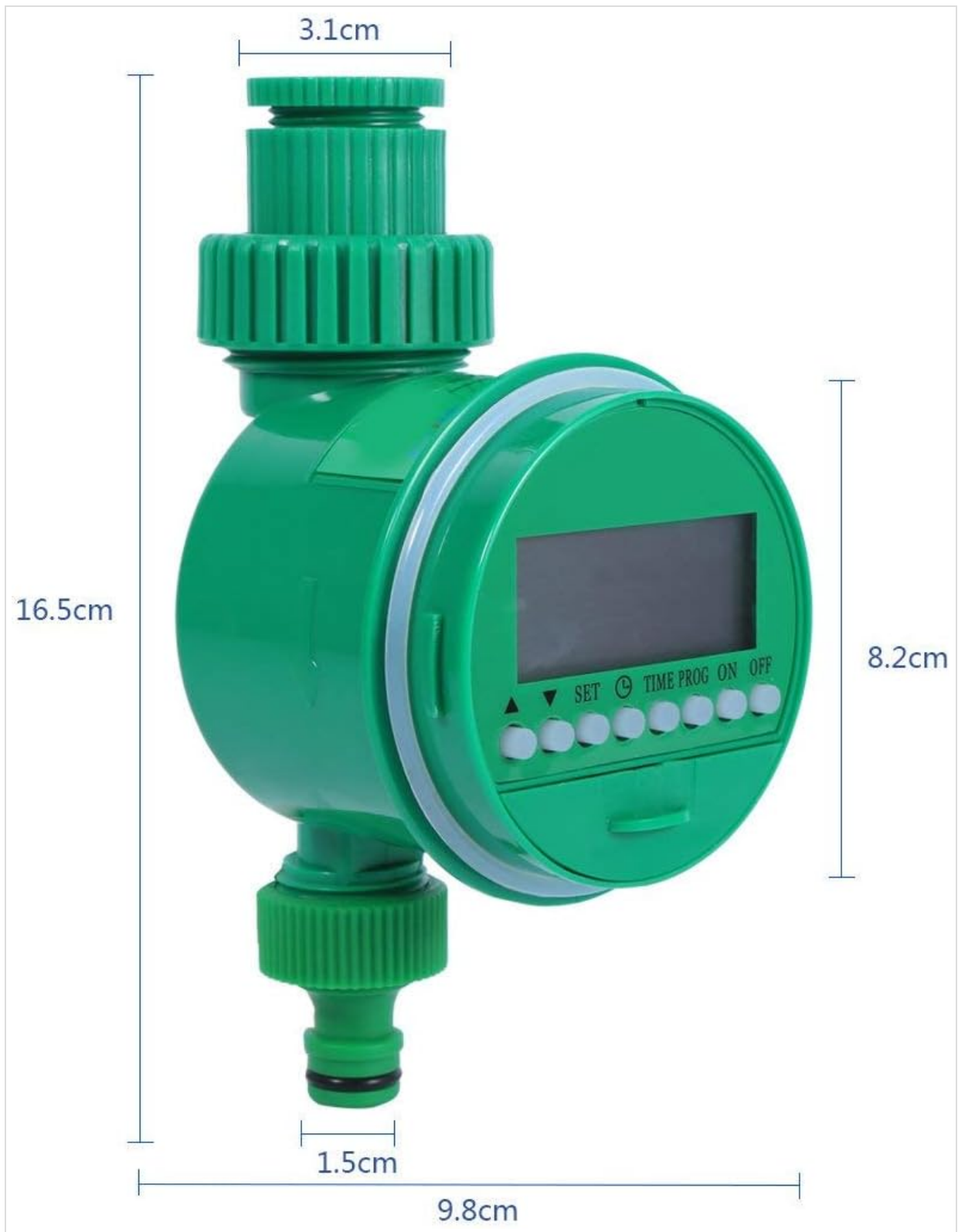
Figure 3: Product dimensions for installation planning.