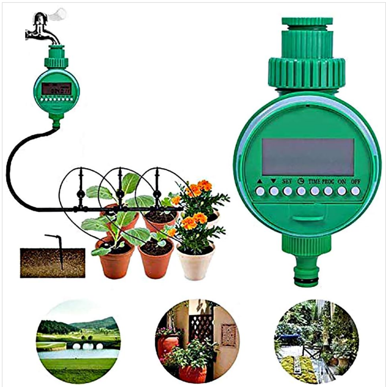
Figure 2: The water timer integrated into a drip irrigation system for potted plants.