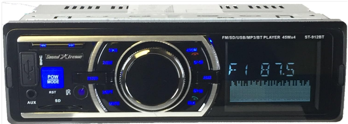
Image: Front view of the SoundXtreme ST-912BT Digital Media Receiver, showing the LCD display, control knob, USB port, SD card slot, AUX input, and various buttons for power, mode, band, and track control.