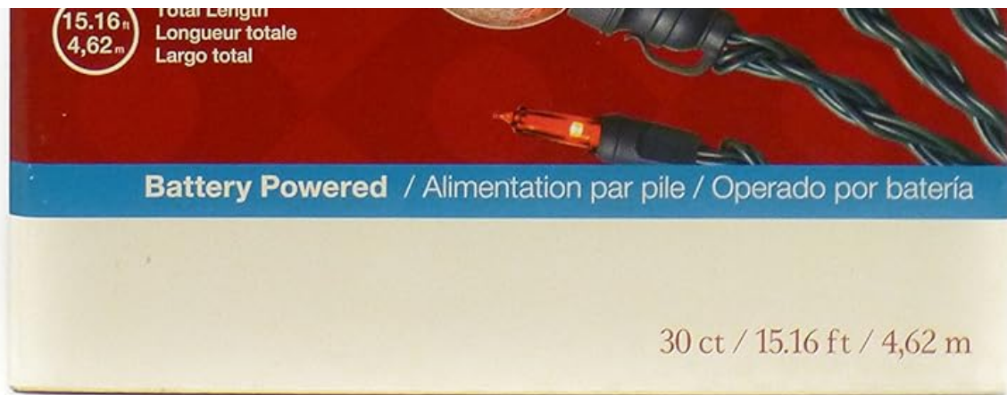
Image: Front view of the product packaging, displaying the Holiday Living brand logo, '30 ct', and 'Red Mini and Warm White Globe Lights' text.