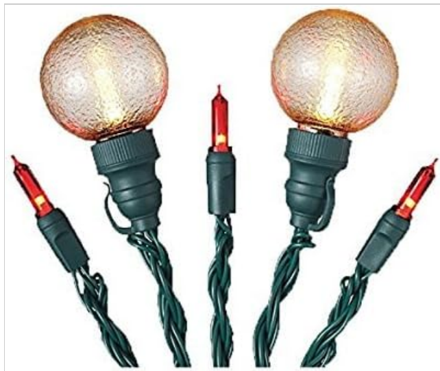
Image: Close-up view of the Holiday Living 30-Count LED Battery Operated Red Mini & White Globe Lights, showing a mix of red mini bulbs and larger white globe bulbs on a green wire.

Thank you for purchasing the Holiday Living 30-Count LED Battery Operated Red Mini & White Globe Lights. This product is designed for both indoor and outdoor decorative lighting, featuring a built-in timer and multiple lighting functions. Please read this manual carefully before installation and use to ensure safe and optimal performance.