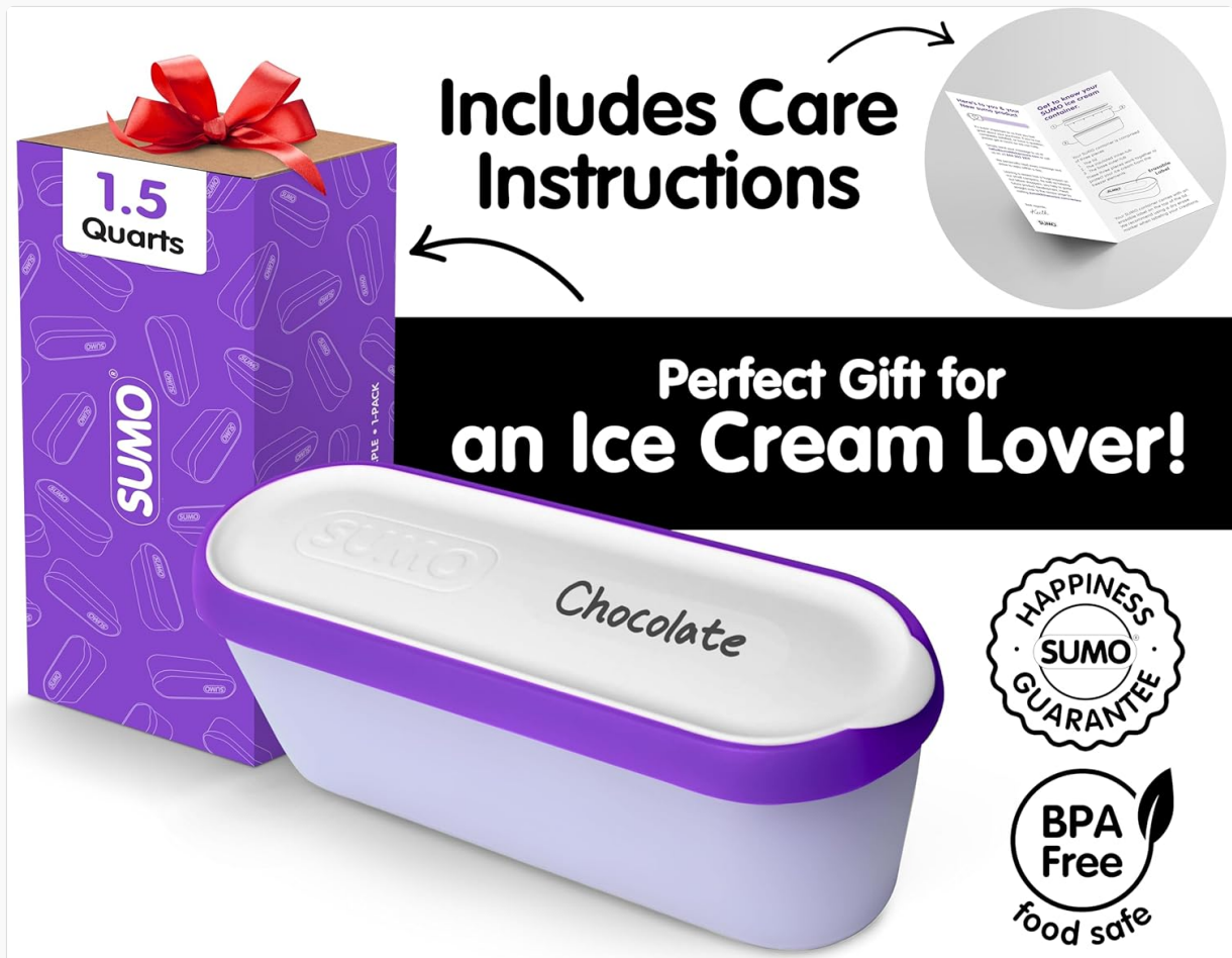
Image: Shows the product packaging, indicating included care instructions and highlighting the SUMO Happiness Guarantee and BPA-free, food-safe materials.

For support or warranty claims, please refer to the contact information provided with your product packaging or visit the official SUMO website.