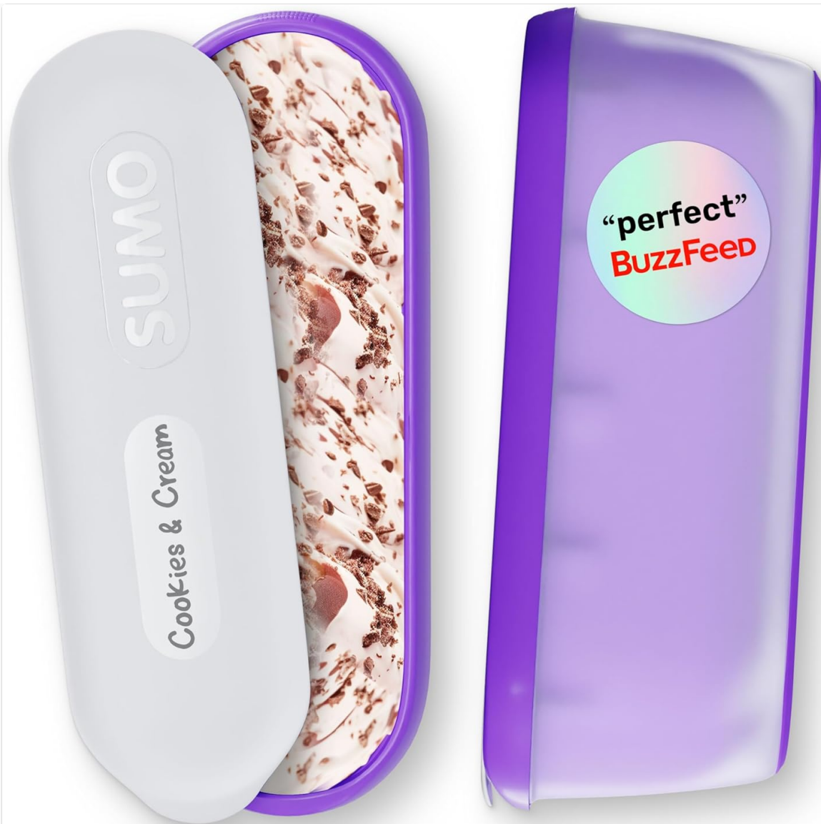
Image: Two SUMO 1.5 Quart Ice Cream Containers, showcasing their design and capacity for homemade ice cream.