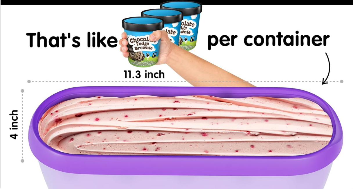
Image: Visual representation of the 1.5-quart capacity of each container.