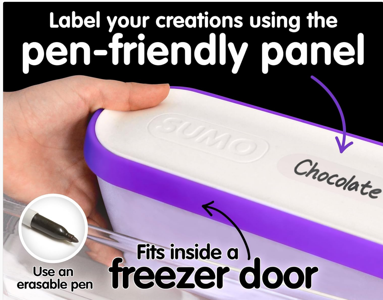
Image: Demonstrates the erasable label feature on the container lid, allowing users to easily identify contents.

Your browser does not support the video tag.