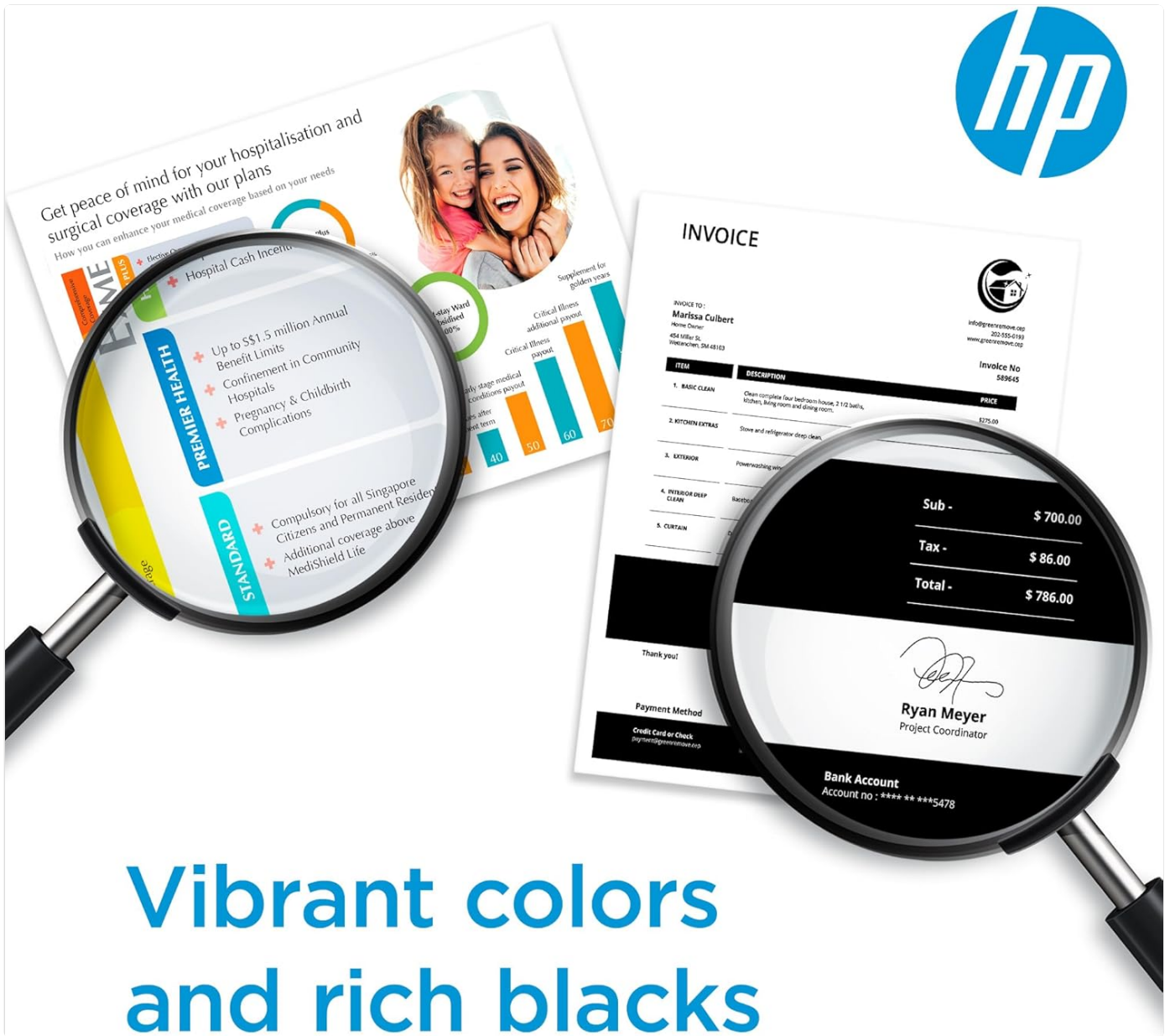
Image: A magnified view of printed documents highlighting the rich black text and vibrant colors produced by HP toner.