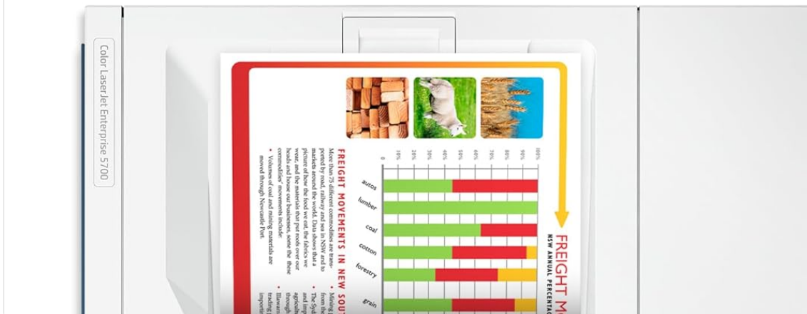
Image: An illustration emphasizing the exceptional and consistent printing performance delivered by HP toner cartridges.