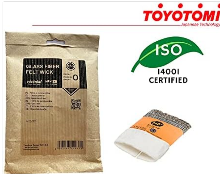
Image 7.2: Packaging highlighting Toyotomi's Japanese Technology and ISO 14001 certification, ensuring quality. The UPC 4963505673079 is visible on the packaging.