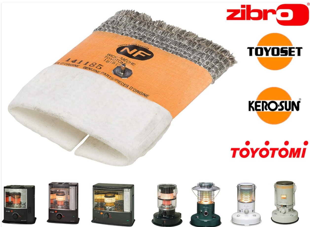
Image 2.1: The Zibro Type F wick displayed alongside various compatible Zibro and Toyotomi stove models, illustrating its broad application.