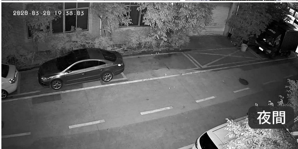
Figure 4.4: Day and night vision comparison, demonstrating the camera's ability to capture clear images in varying light conditions.