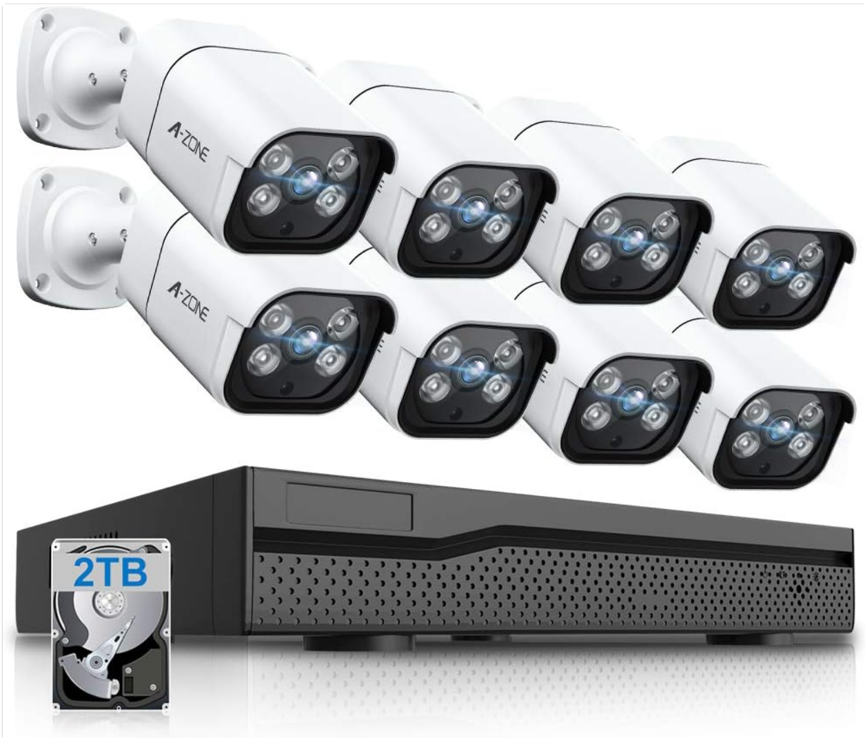
Figure 2.1: A-ZONE POE Security Camera Kit showing 8 cameras, NVR, and 2TB HDD.