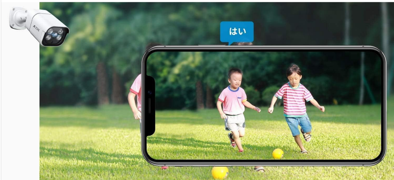
Figure 4.2: Illustration of the two-way audio function, enabling communication through the camera system.

カメラ本体にはマイクやスピーカーを内蔵して、電話をかけなくてもすぐに対話出来ます。音声の転送は流暢だけでなく、はっきり聞こえます。