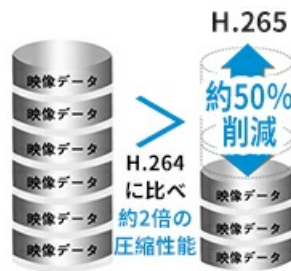
Figure 4.6: Explanation of H.265 video compression, demonstrating its efficiency in saving storage space compared to H.264.