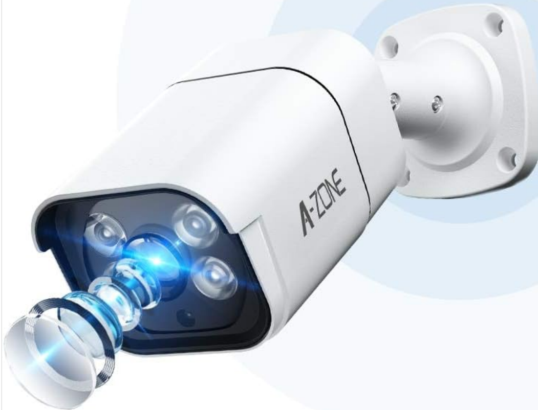
Figure 4.1: Close-up view of an A-ZONE 5MP camera, highlighting its high-resolution capability.