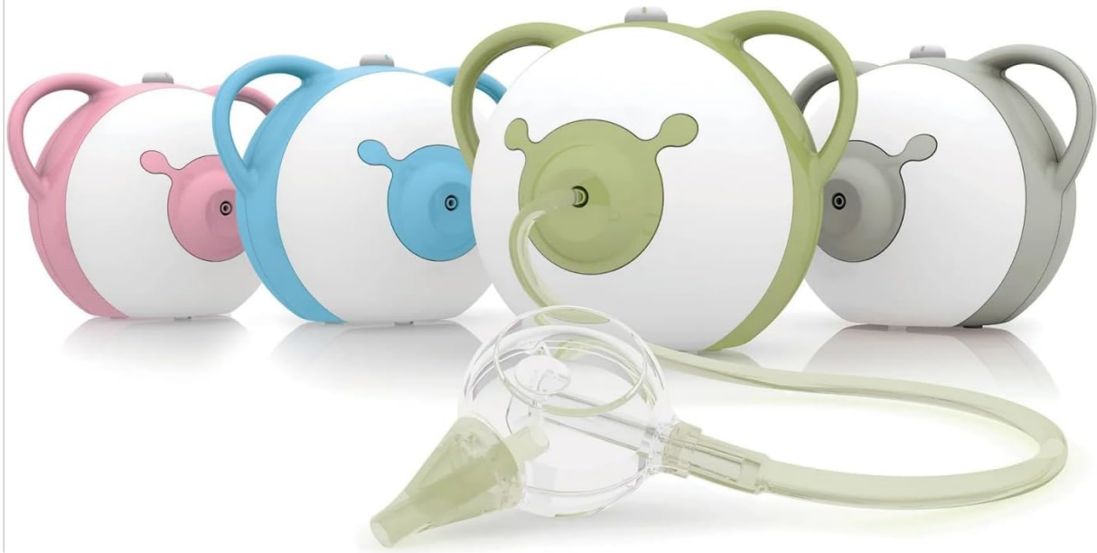
Image: The Nosiboo Pro Electric Nasal Aspirator, featuring its distinctive green and white design with the clear Colibri head and connecting tube.