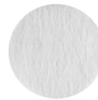
extra air mesh pack

Image: A close-up view of the Nosiboo Pro's main unit, highlighting the adjustable suction power dial, which allows users to select between minimum and maximum settings for tailored use.