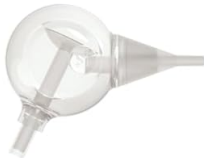
Colibri head with newborn's nose tip