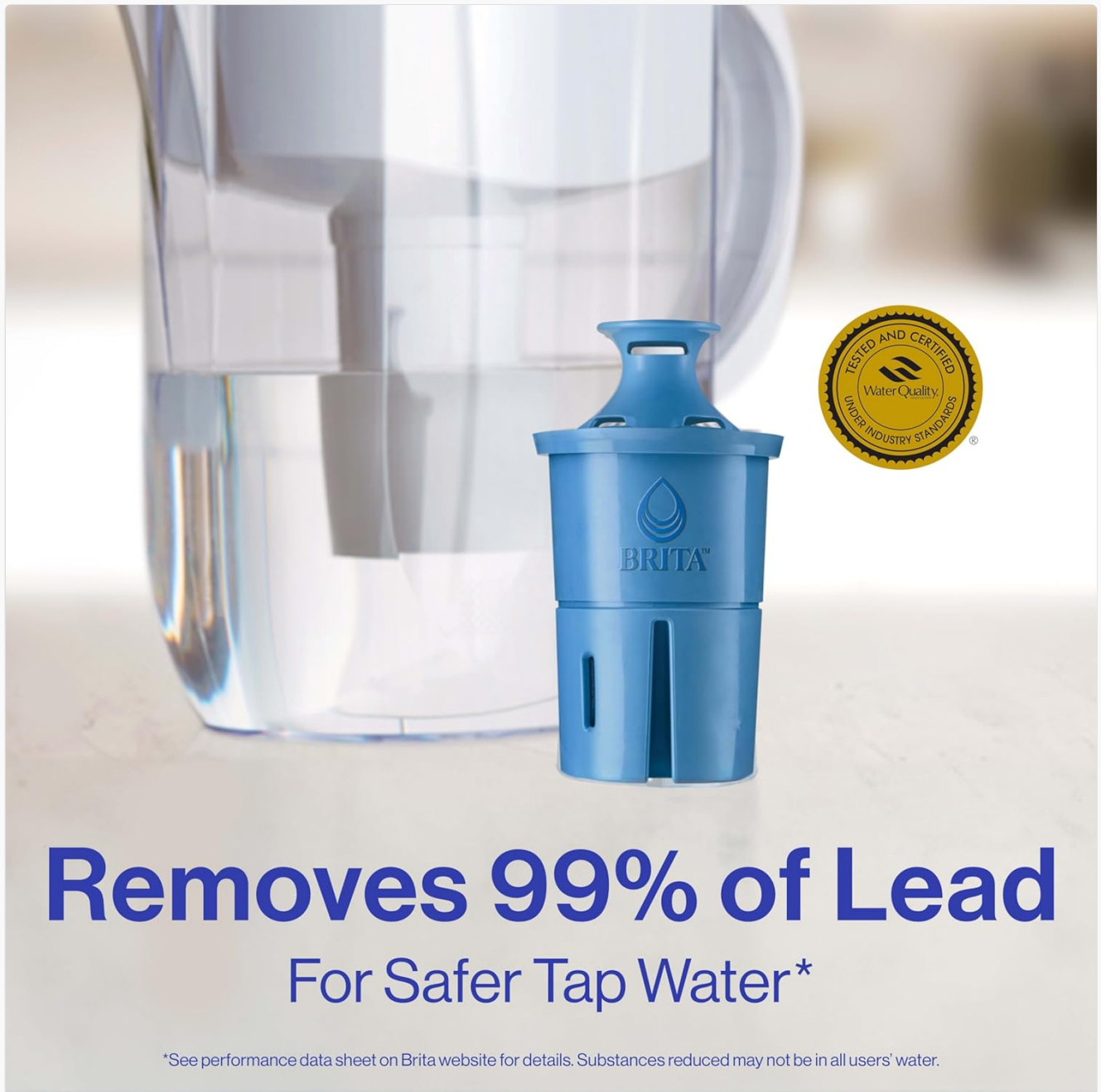
Figure 3: Lead Reduction Capability