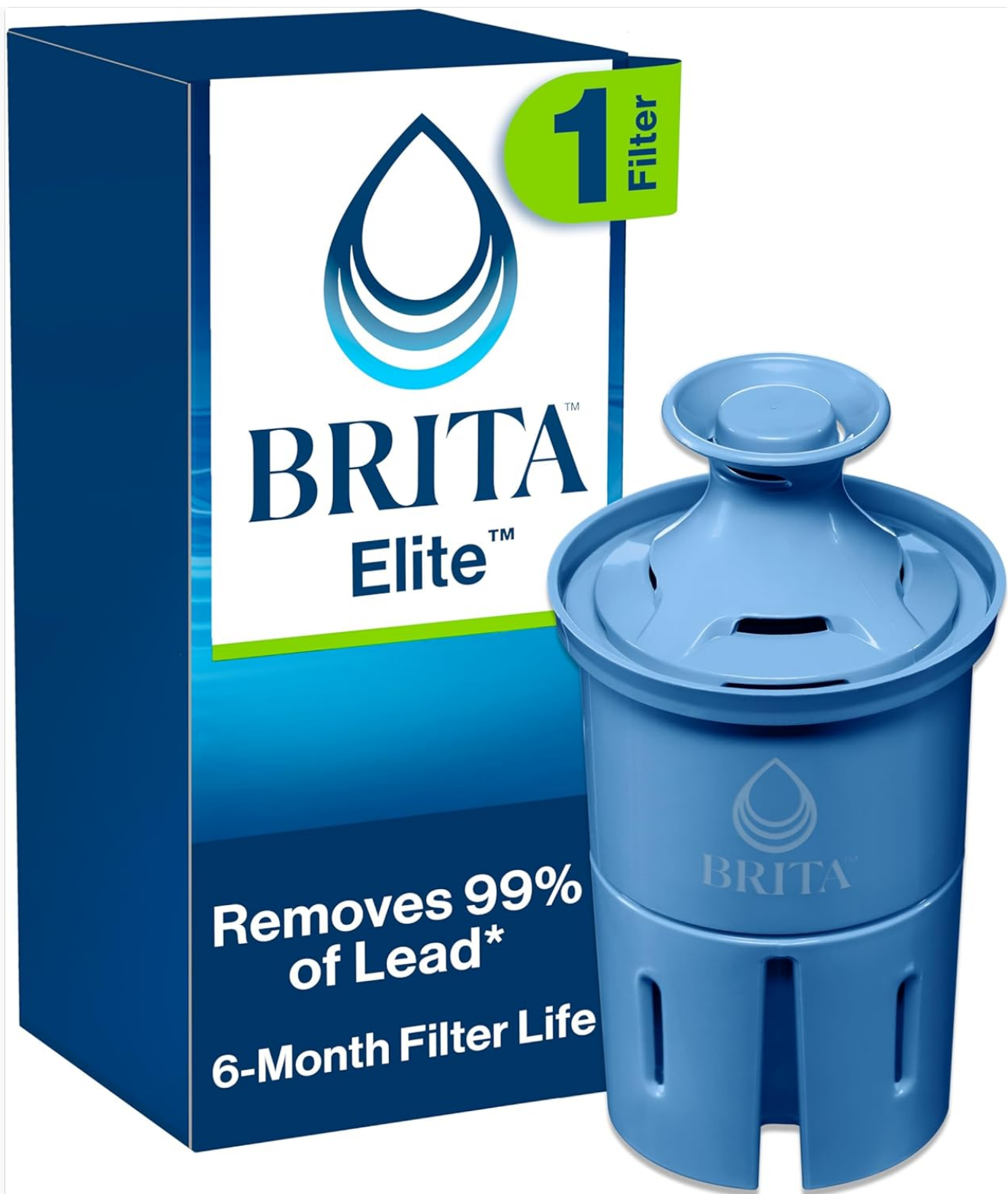
Figure 1: Brita Elite Water Filter Replacement and Packaging