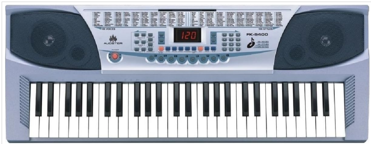
Image 4.1: A top-down view of the Audster FK-5400 electronic keyboard, showing the 54 keys, central control panel with LED display, and integrated speakers on either side.

The Audster FK-5400 is a 54-key electronic keyboard designed for musical exploration. It features an LED display, integrated speakers, and a variety of functions to enhance your playing experience.