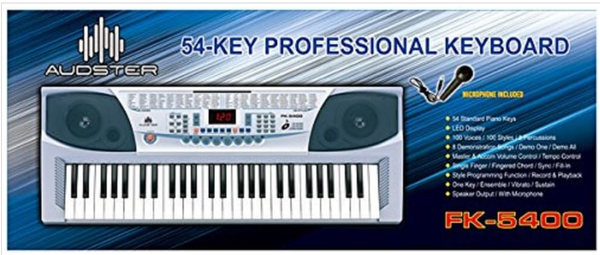
Image 3.1: The Audster FK-5400 keyboard packaging, highlighting key features such as 54 standard piano keys, LED display, 100 voices, 100 styles, 8 percussions, 8 demonstration songs, and included microphone.