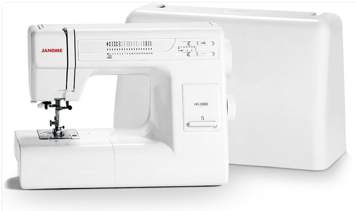
The Janome HD3000 Heavy-Duty Sewing Machine, shown with its protective hard case.

This manual provides essential instructions for the safe and efficient operation, setup, and maintenance of your Janome HD3000 Heavy-Duty Sewing Machine. Please read all instructions carefully before using the machine to ensure optimal performance and longevity.