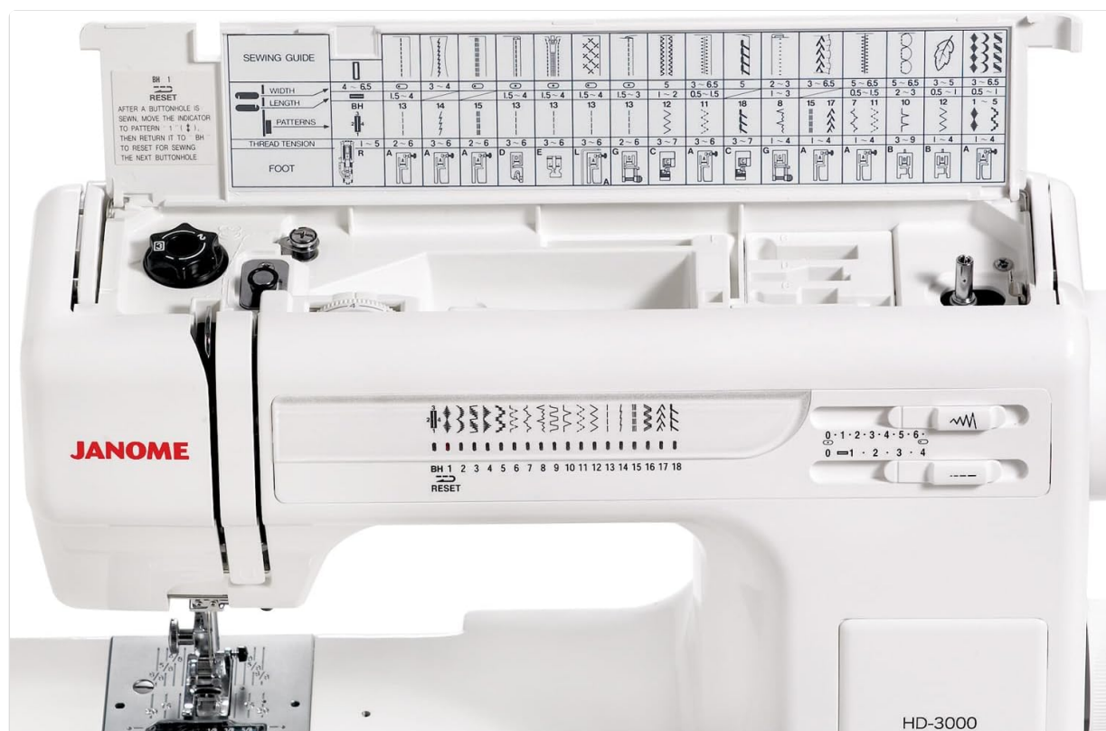
A view of the machine's top panel, highlighting the stitch selection guide and various adjustment dials.

Always ensure the take-up lever is in its highest position before threading. Rotate the handwheel towards yourself to raise it if necessary.