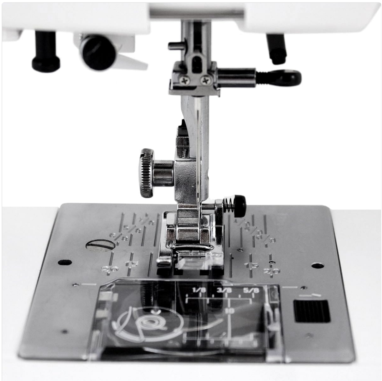
A detailed view of the needle and presser foot, showing the threading path.

Video demonstrating the correct procedure for threading the Janome HD3000 sewing machine's upper thread.