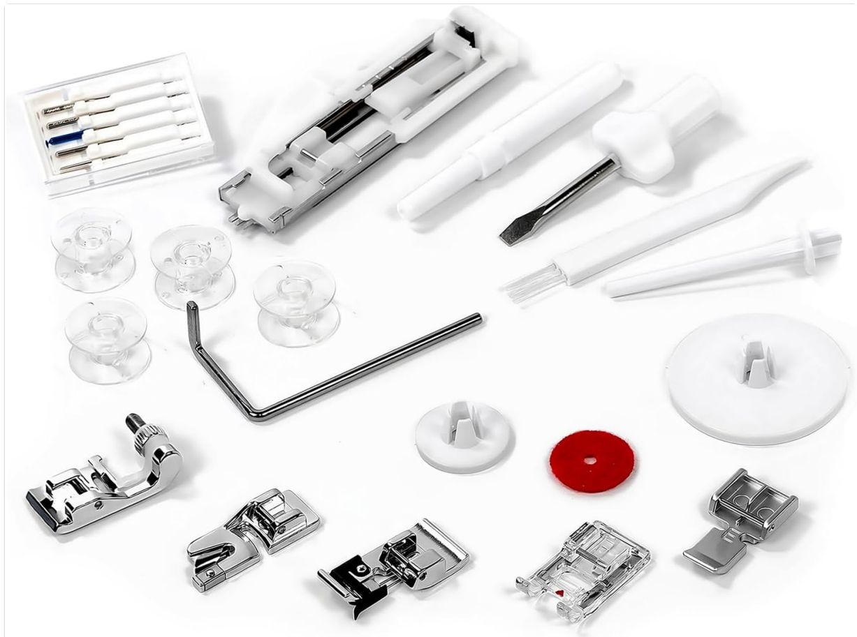
Various snap-on presser feet and accessories included with the Janome HD3000, designed for different sewing applications.