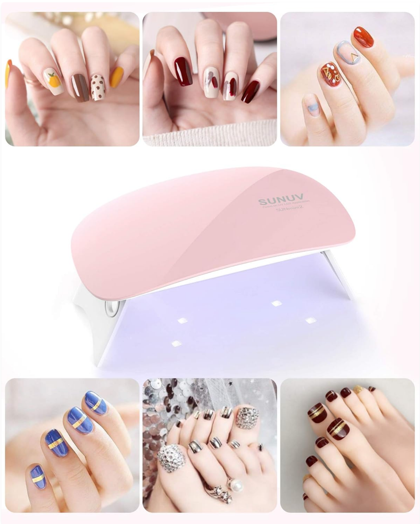
Image: A collage demonstrating the versatility of the SUNUV Mini2 nail lamp, showcasing various manicures and pedicures successfully cured using the device.