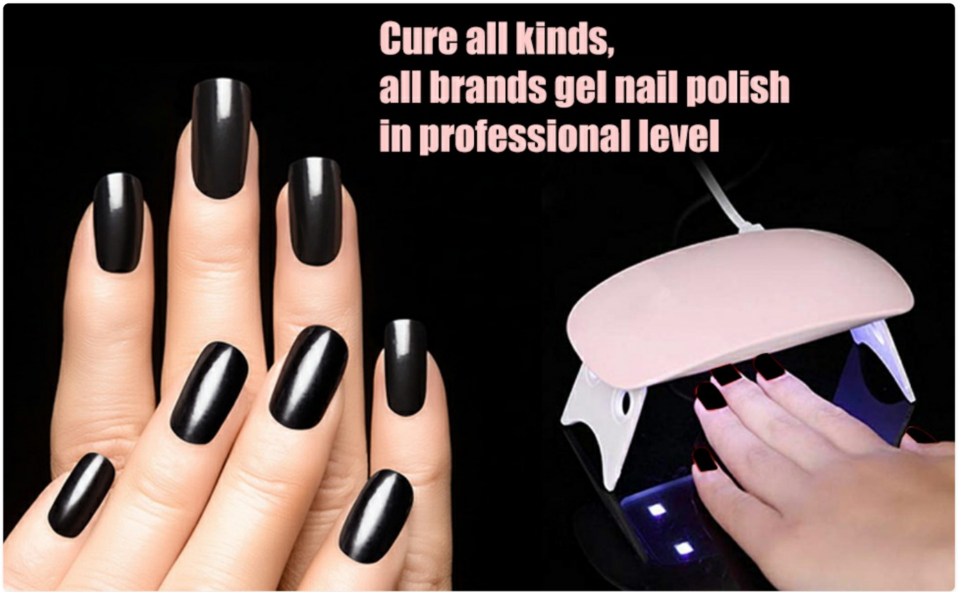
Image: A hand with freshly applied black gel nail polish positioned next to the SUNUV Mini2 lamp, demonstrating its effectiveness in curing various types and brands of gel nail polish to a professional standard.