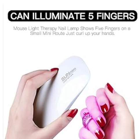
Image: A hand with red nail polish placed under the SUNUV Mini2 lamp, illustrating its design to effectively illuminate and cure all five fingers at once.