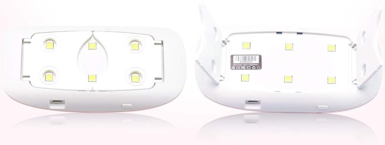
Image: A diagram illustrating the compact dimensions (13.1cm length, 6.7cm width, 1.9cm height when folded) of the SUNUV Mini2 nail lamp, emphasizing its portability and foldable design.