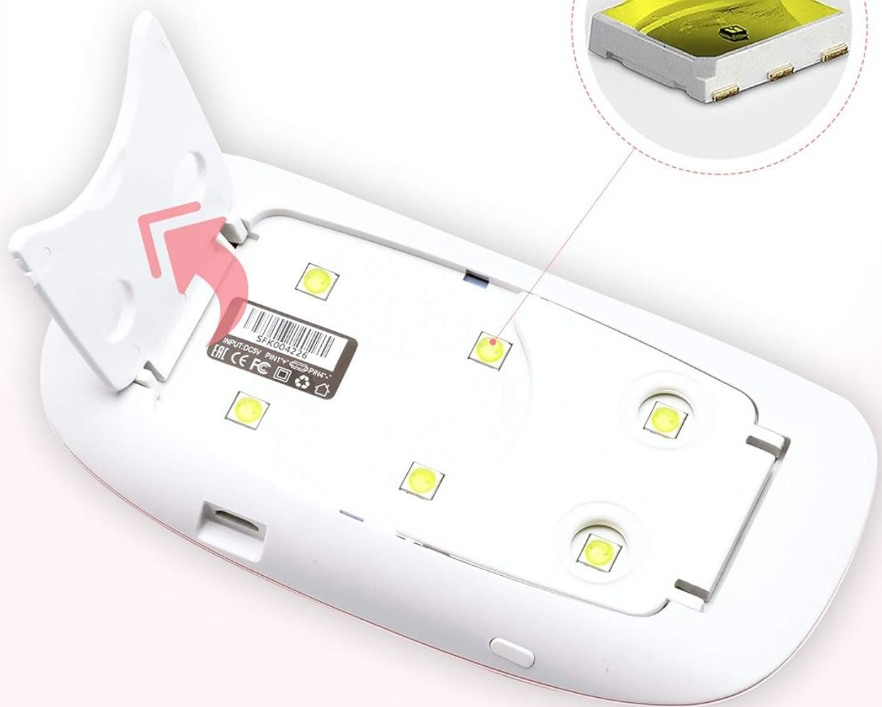
Image: An internal view of the SUNUV Mini2 nail lamp, highlighting its 6 double light source lamp beads and indicating a 50,000-hour lifespan for the lamp beads.