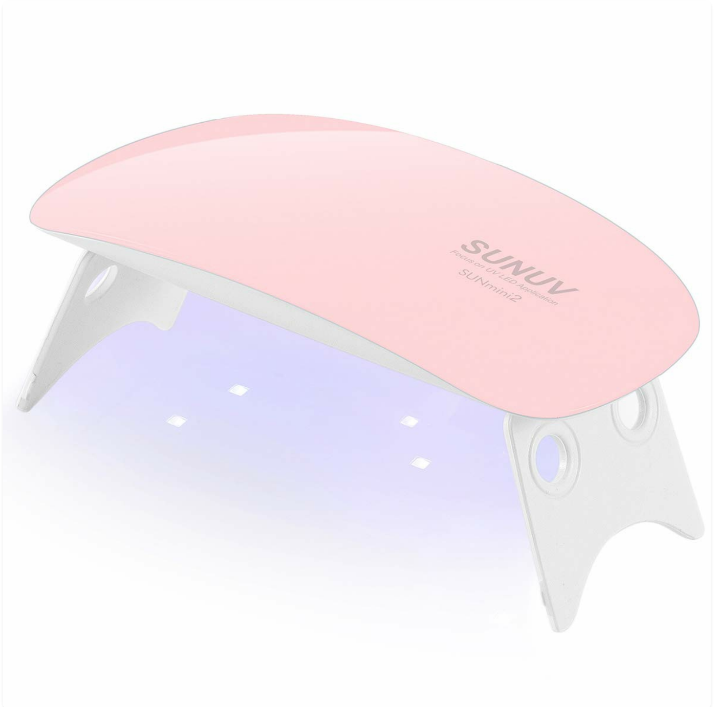
Image: The SUNUV Mini2 UV LED Nail Lamp, showcasing its sleek pink top and white foldable legs, with the internal LED lights emitting a purple glow, indicating readiness for use.