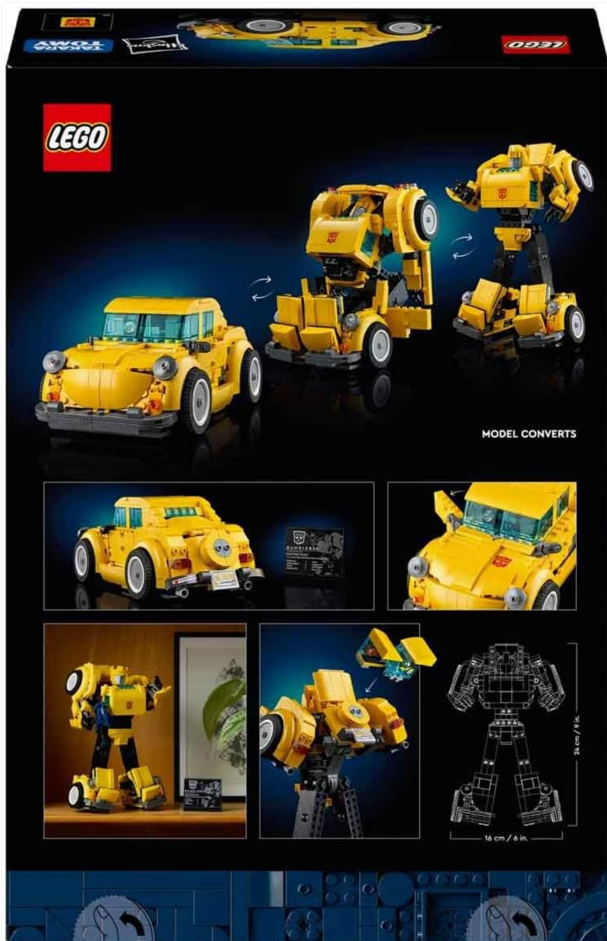
Image: The back packaging of the LEGO Icons Bumblebee set, illustrating the transformation process and various features.