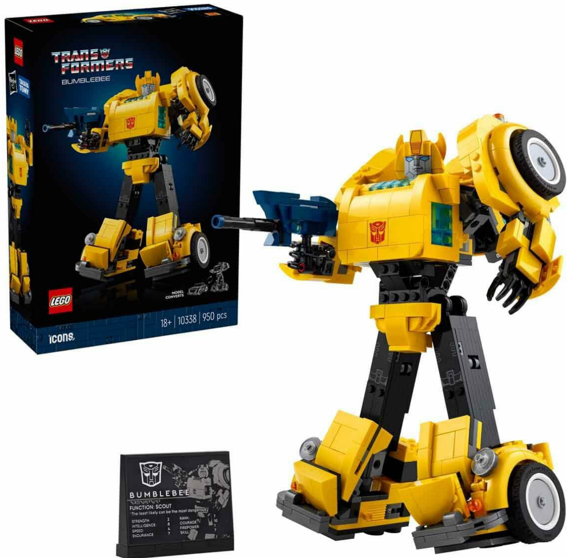
Image: The fully assembled LEGO Icons Bumblebee model in its robot form, equipped with an ion blaster.