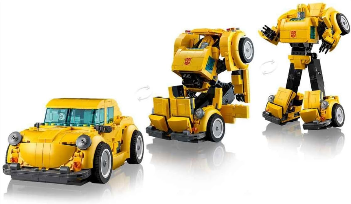
Image: A visual representation of the LEGO Bumblebee transforming from vehicle mode, through an intermediate stage, to its robot mode.