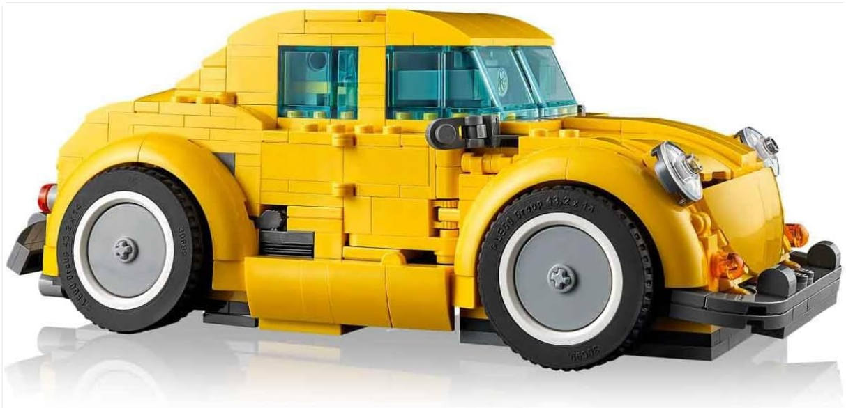
Image: The LEGO Bumblebee model fully transformed into its vehicle mode, viewed from the side.

Your browser does not support the video tag.