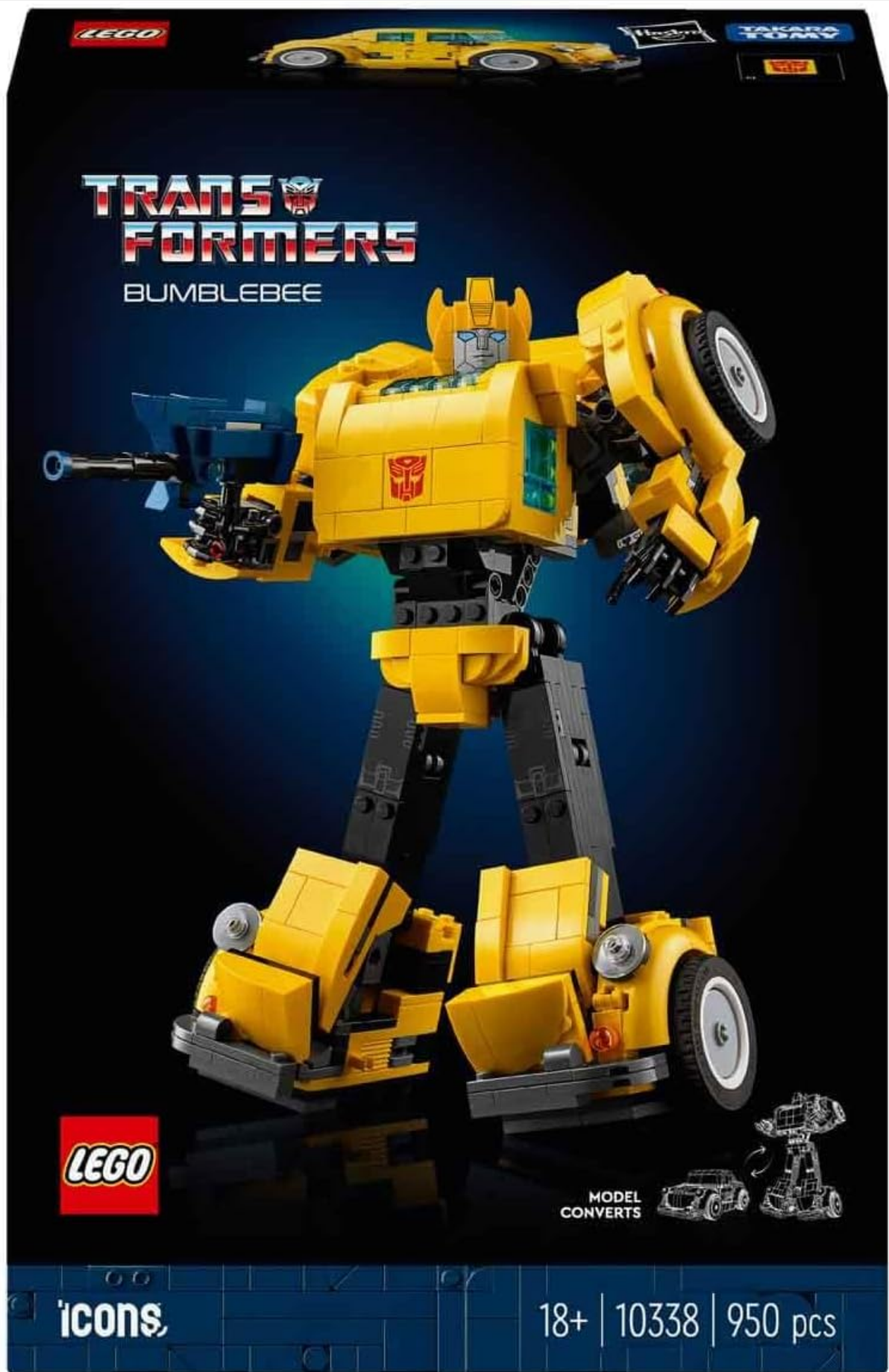
Image: The front packaging of the LEGO Icons Bumblebee set, showing the robot mode.