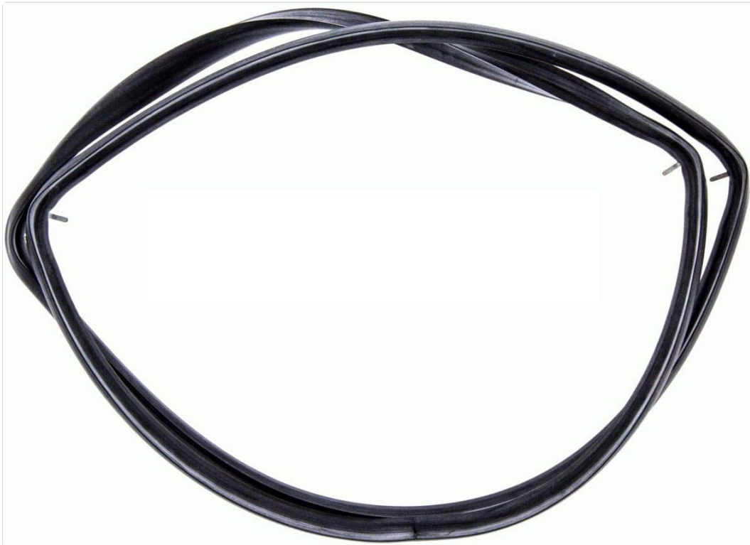
Image 1: Illustration of an oven door gasket, similar to the one being replaced. Note the attachment points.

may be slightly adhered or tucked into a channel. Take note of how the old gasket was installed, especially the corners and attachment points, as this will guide the installation of the new one.