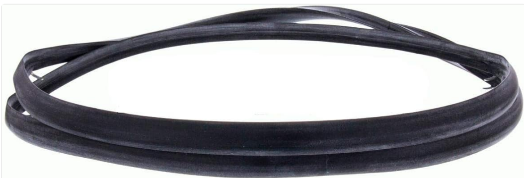
Image 2: The new Recamania oven door gasket, showing its flexible material and overall shape.