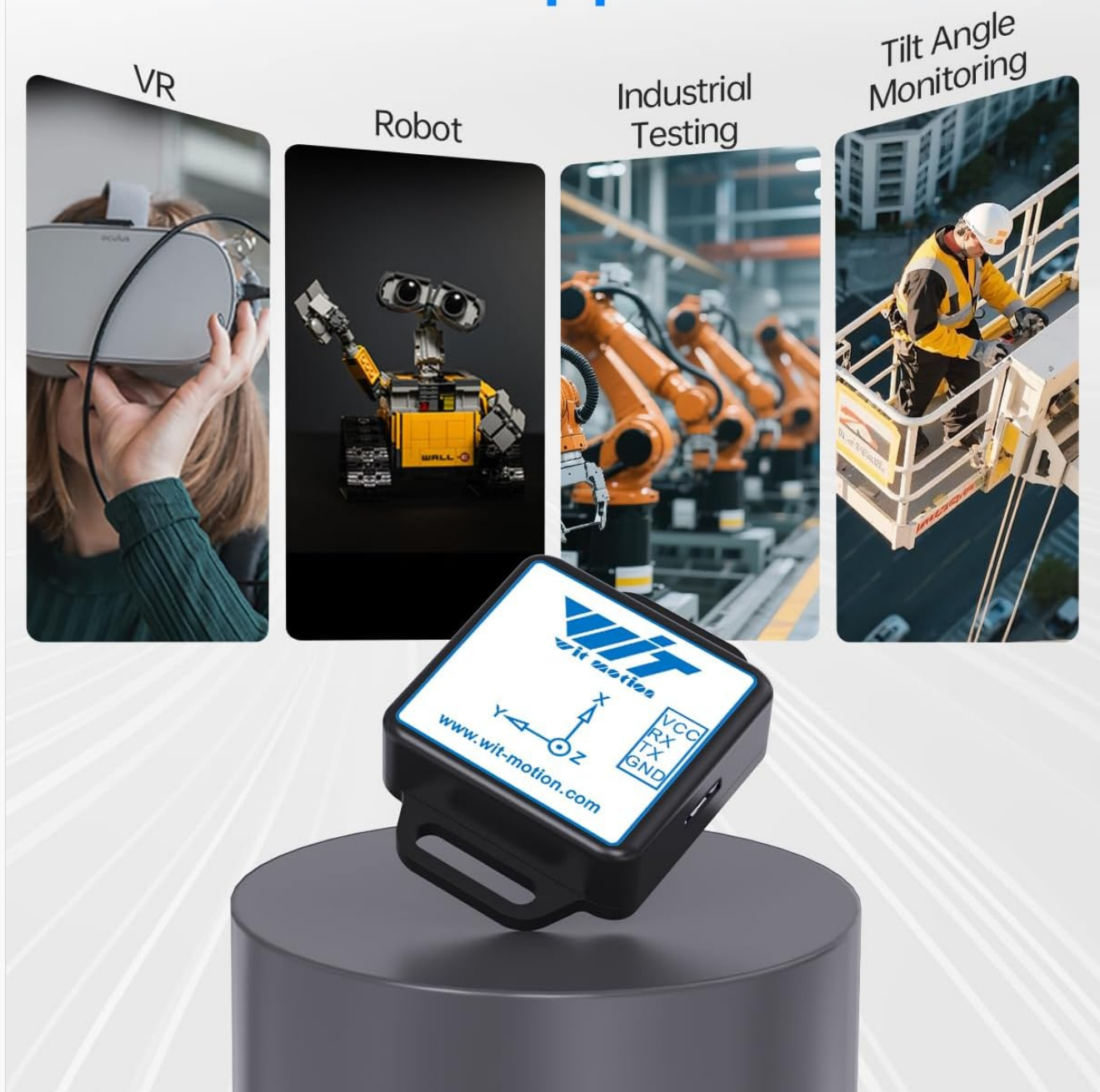
Figure 7.1: Visual representation of various applications for the WT901C-TTL inclinometer, such as Virtual Reality (VR), robotics, industrial testing, and tilt angle monitoring in construction or machinery.