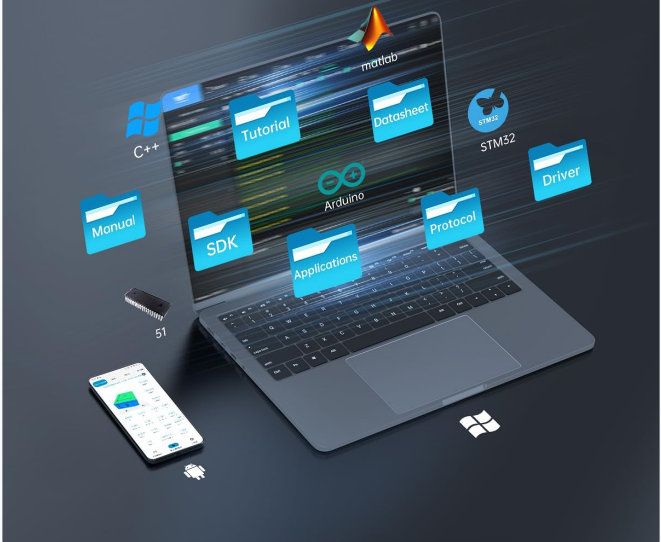
Figure 9.1: Overview of development and testing resources provided by WitMotion, including PC software, smartphone apps, SDKs, and various documentation formats like manuals and datasheets.

WITMOTION provides PC software & smartphone APP Equipped with complete development materials and SDK to facilitate secondary development.