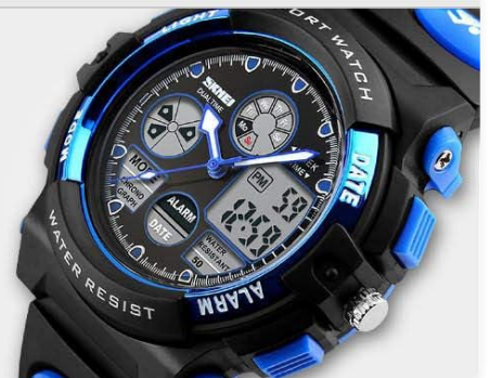
Image: Detailed breakdown of watch components, highlighting the EL luminous slice for night visibility, high-quality silicone belt, superior glass lens, and eco-friendly PC cover for durability.

Eco-friendly PC material cover, makes it more durable and easy to clean.