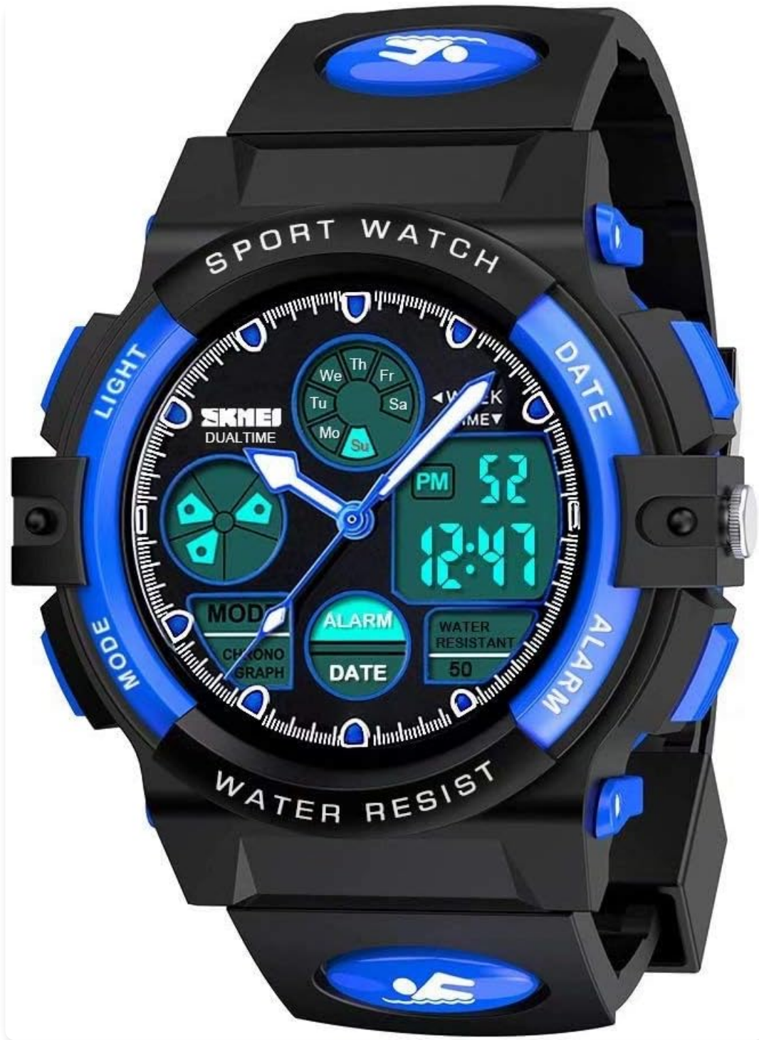
Image: The cofuo Kids Digital Sport Watch, featuring a blue and black design with a clear digital display.