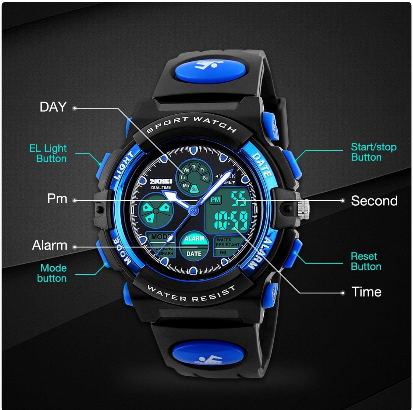
Image: An annotated diagram of the watch face, indicating the 'Light' button, 'Mode' button, 'Alarm' button, 'Start/Stop' button, and 'Reset' button, along with display indicators for PM, Second, and Time.