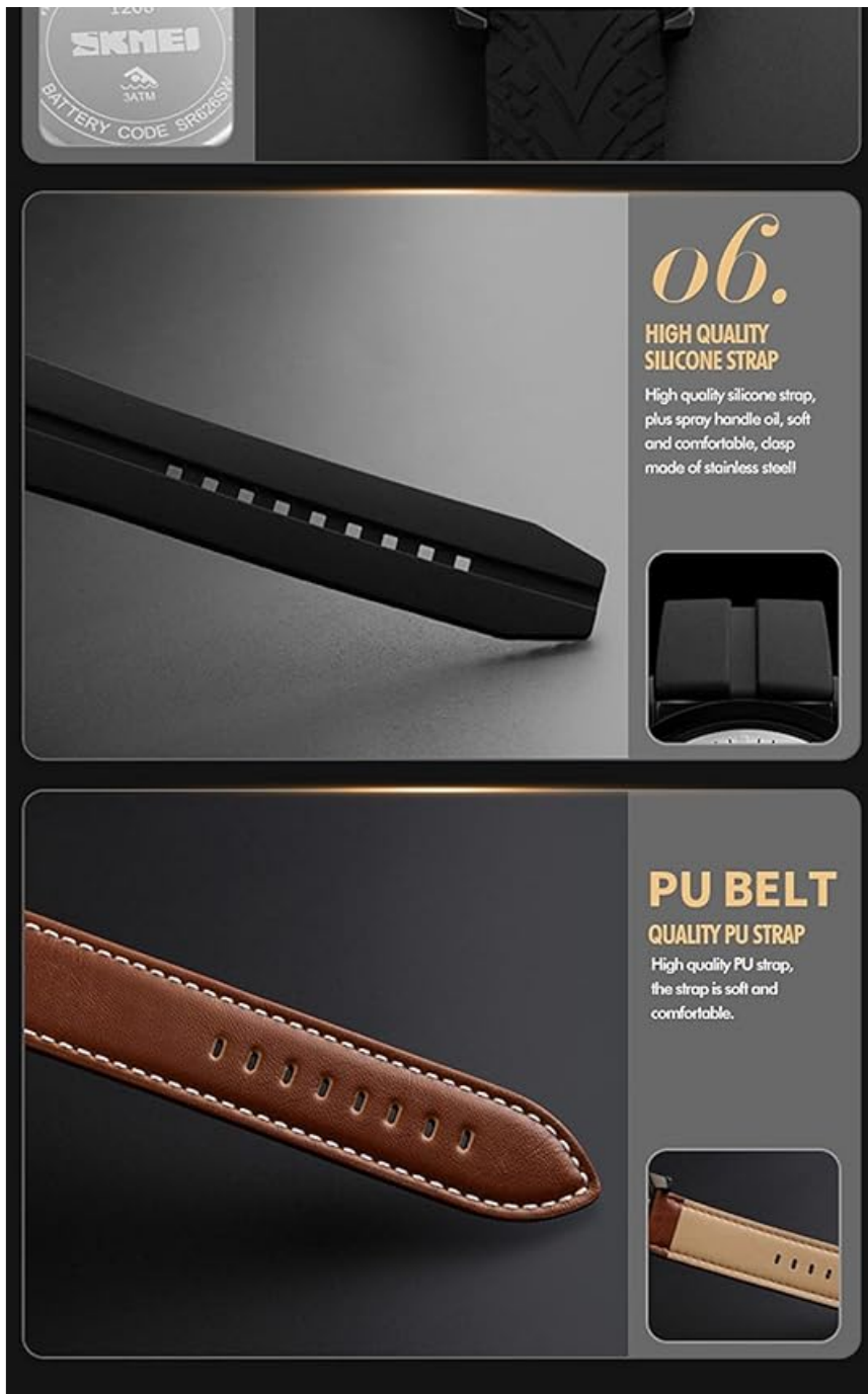
Image: Close-up views of the stainless steel clasp, 30M water resistance marking on the case back, and the quality silicone/PU strap.