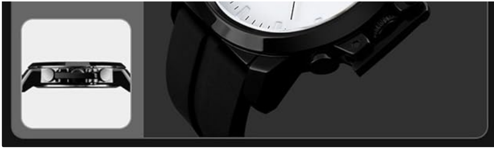
Image: Detailed view showcasing the watch's quartz movement, high hardness glass, and zinc alloy IP black plating.