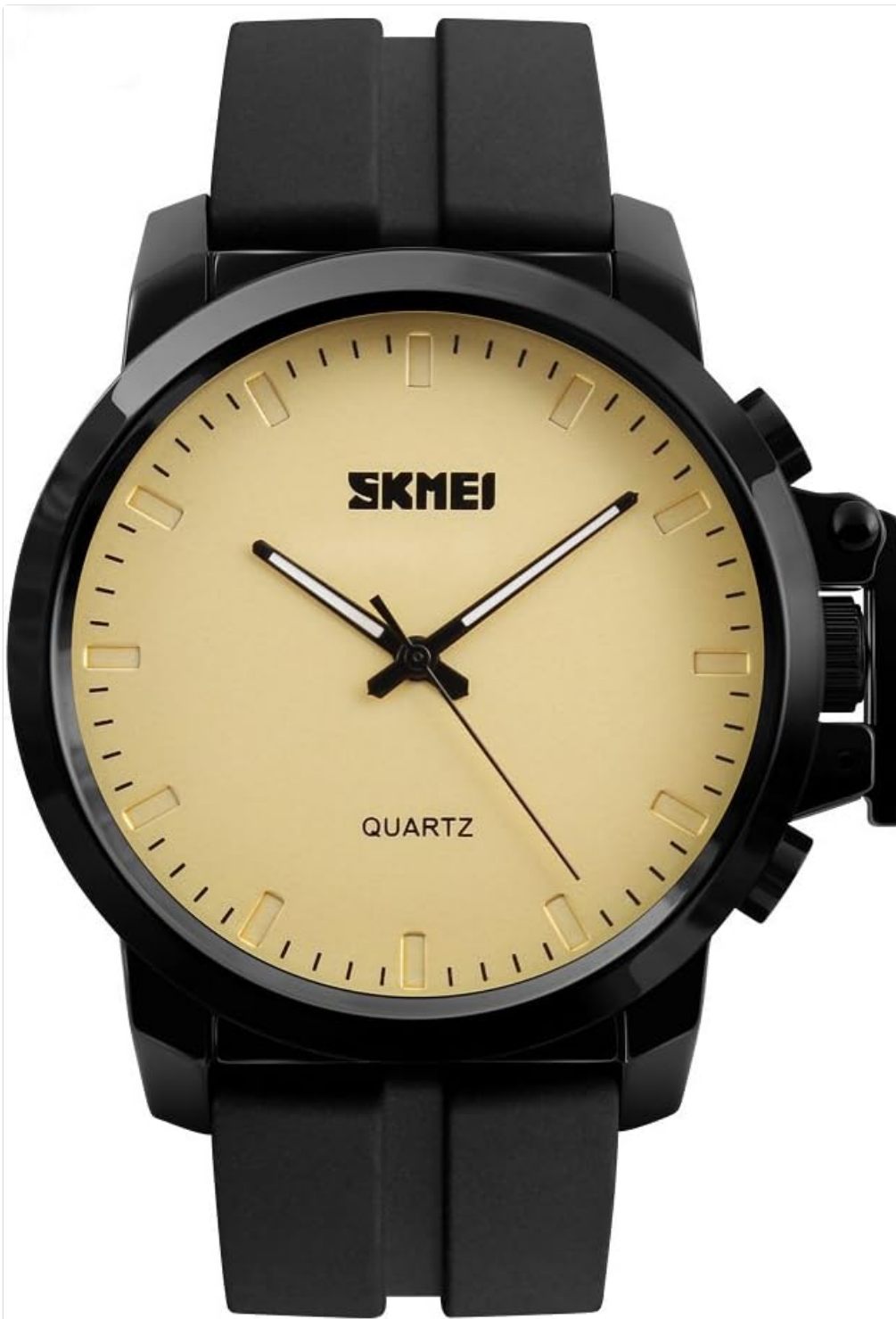
Image: Front view of the SKMEI 1208 watch with a black case and gold dial.