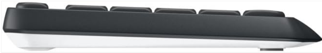
Image: Side profile view of the Logitech K375s keyboard, showcasing its slim design and key height.