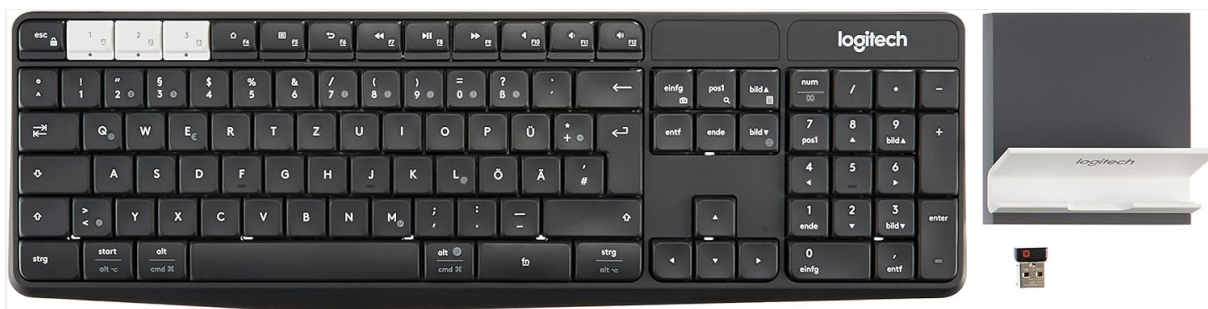
Image: The Logitech K375s keyboard, showing its full layout, the included universal stand, and the USB Unifying receiver.

Thank you for choosing the Logitech K375s Multi-Device Wireless Keyboard. This keyboard is designed for comfortable and quiet typing, offering seamless switching between multiple devices such as computers, smartphones, and tablets. This manual provides detailed instructions to help you set up, operate, and maintain your new keyboard.