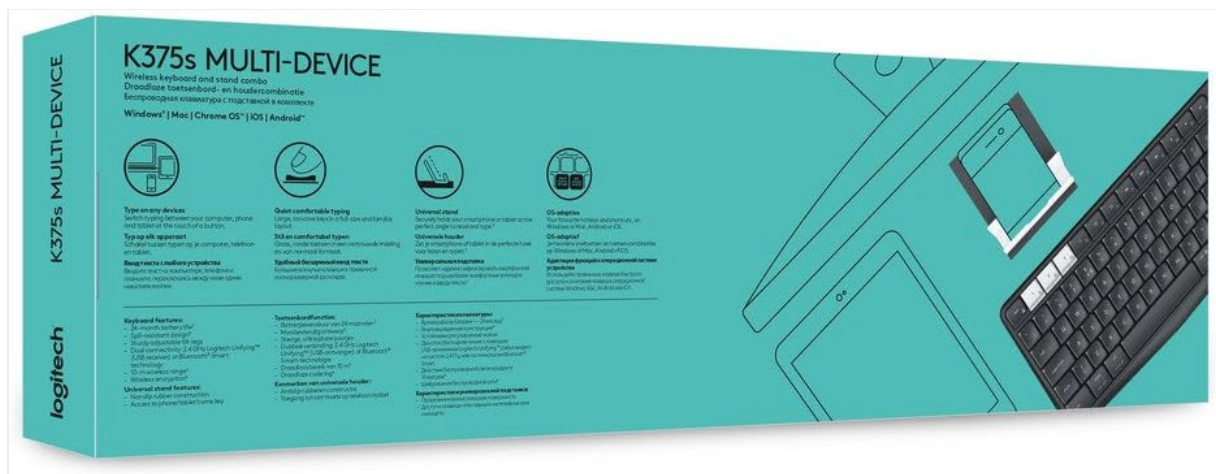
Image: Retail packaging for the Logitech K375s Multi-Device Keyboard, indicating its multi-device capabilities.