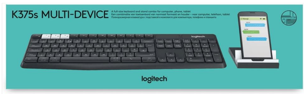
Image: The Logitech K375s keyboard positioned next to a smartphone securely placed in the included universal stand, demonstrating multi-device usage.