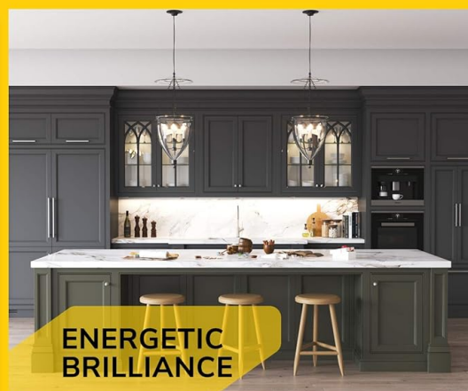
Image: Four different kitchen scenes illustrating the various lighting effects achievable with the Getinlight fixture, including focused intensity, romantic glow, natural radiance, and energetic brilliance.