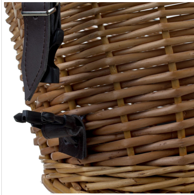
Image: Detail of the lid securing strap and buckle.