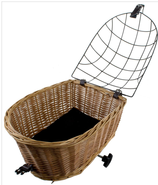
Image: Basket with lid open, showing interior.