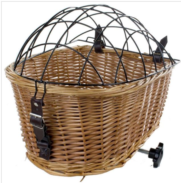
Image: M-Wave Wicker Dog Basket, fully assembled.