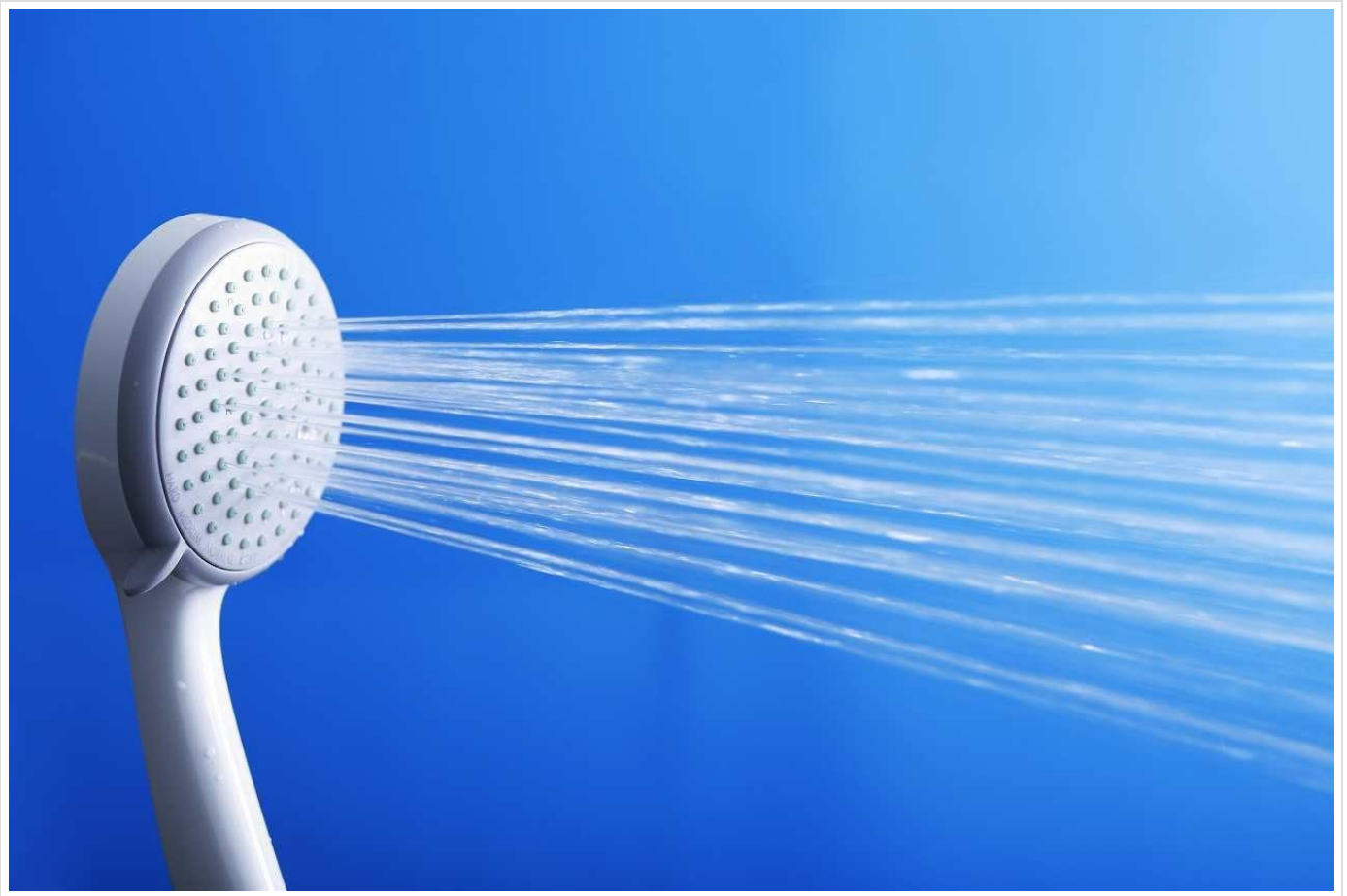
Figure 5: The shower head demonstrating a more focused spray pattern, possibly the 'Medium' or 'Hard' mode.