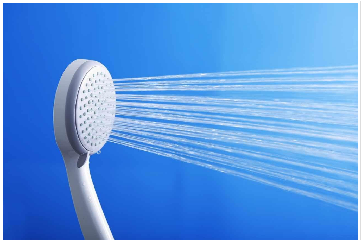
Figure 4: The shower head demonstrating a wide spray pattern, likely the 'Normal' or 'Soft' mode.