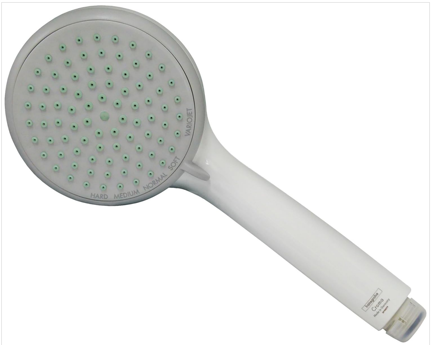
Figure 1: Front view of the Hansgrohe Croma100 VarioEco Hand Shower Head, showing the spray plate and mode labels.