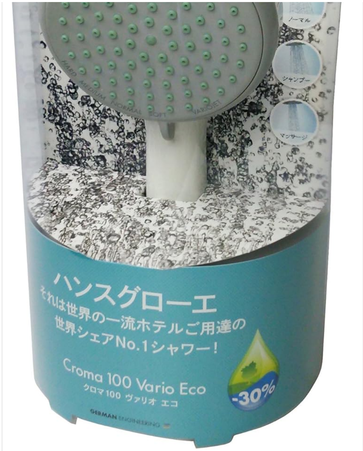
Figure 2: The Hansgrohe Cromo100 VarioEco Hand Shower Head displayed in its transparent retail packaging.