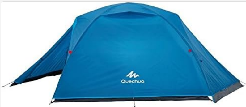
Image: The ARPENAZ 3+ tent fully set up with the rainfly in place, viewed from the rear, highlighting its compact and protective design.

Drape the rainfly over the assembled tent body, ensuring it is oriented correctly (usually indicated by the brand logo or door alignment). Secure the rainfly to the tent body using the buckles, clips, or Velcro straps provided. This model features a double roof for enhanced weather protection.