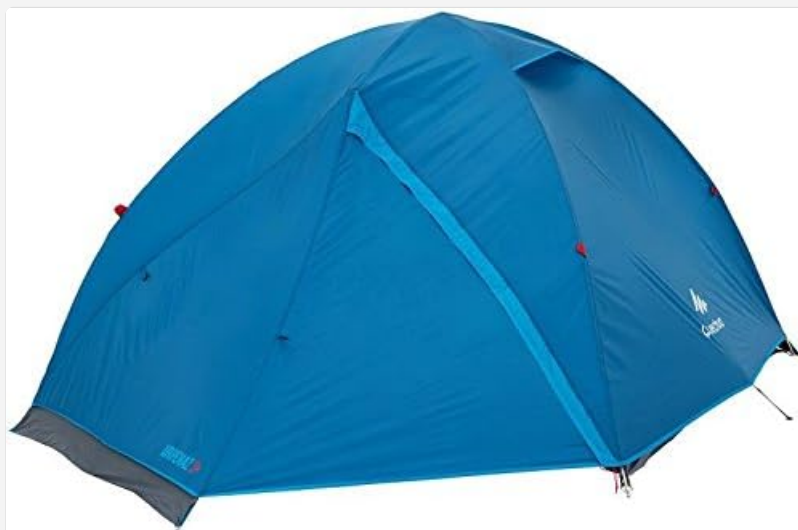
Image: The ARPENAZ 3+ tent with its main poles assembled, forming the basic dome shape. The front entrance is visible.

Connect the aluminum pole sections. The ARPENAZ 3+ typically uses a dome design with intersecting poles. Insert the poles into the sleeves or clips on the tent body. For this model, the poles are designed to create a stable dome structure.