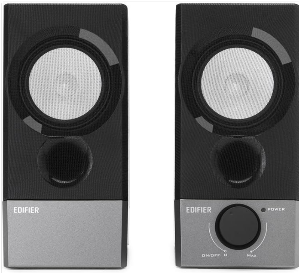
Image: Front view of the two Edifier R19U speakers. The right speaker features a prominent volume knob and a power indicator light.