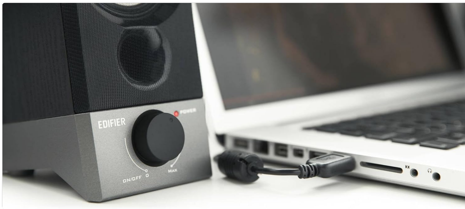
Image: The right Edifier R19U speaker connected to a laptop via a USB cable, illustrating the primary connectivity method for both power and audio.