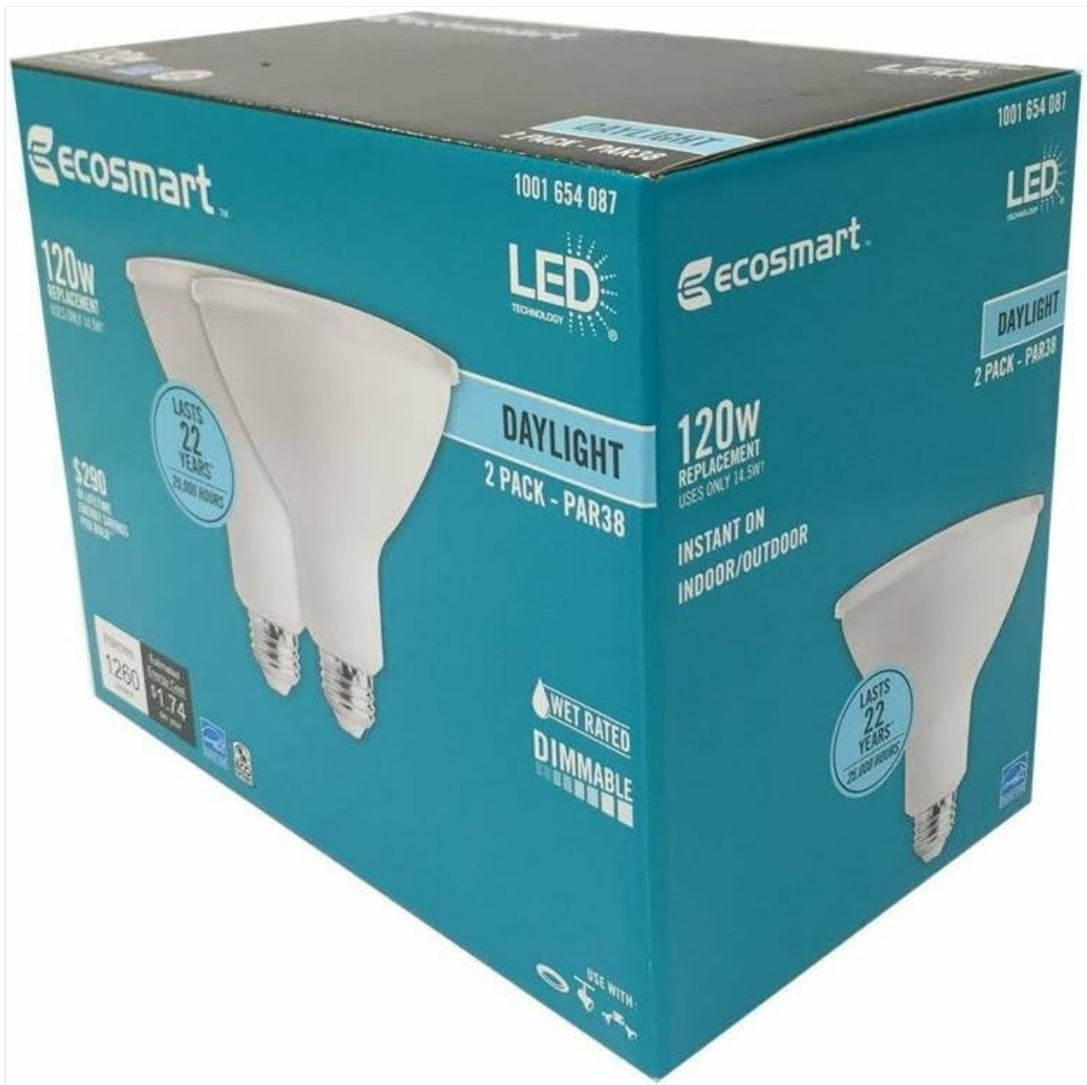
Image: Packaging for the EcoSmart PAR38 LED Flood Light Bulbs, highlighting features such as 120W equivalent, dimmable, and suitable for indoor/outdoor use.