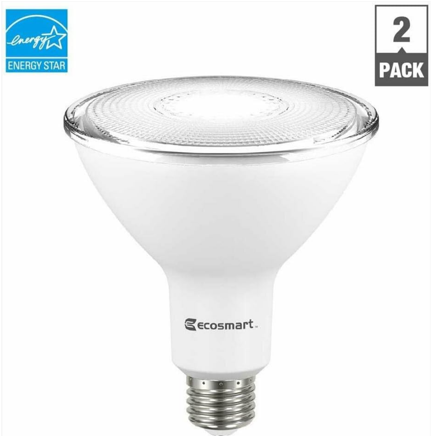
Image: A close-up view of the EcoSmart PAR38 LED bulb, showing its standard E26 screw base.

These bulbs are designed for standard E26 base fixtures. Ensure your fixture is compatible with PAR38 bulb size and E26 base.