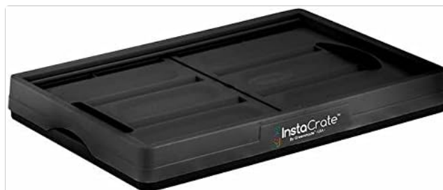
Image 2: The Instacrate in its collapsed, flat configuration, demonstrating its space-saving design.