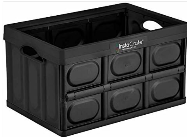
Image 1: The Instacrate in its fully expanded and assembled configuration, ready for storage.