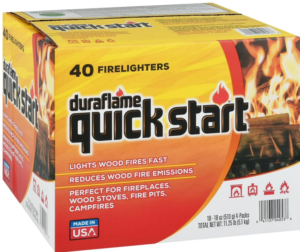
Image: A 40-count case of Duraflame Quick Start Firelighters, showcasing the product packaging.