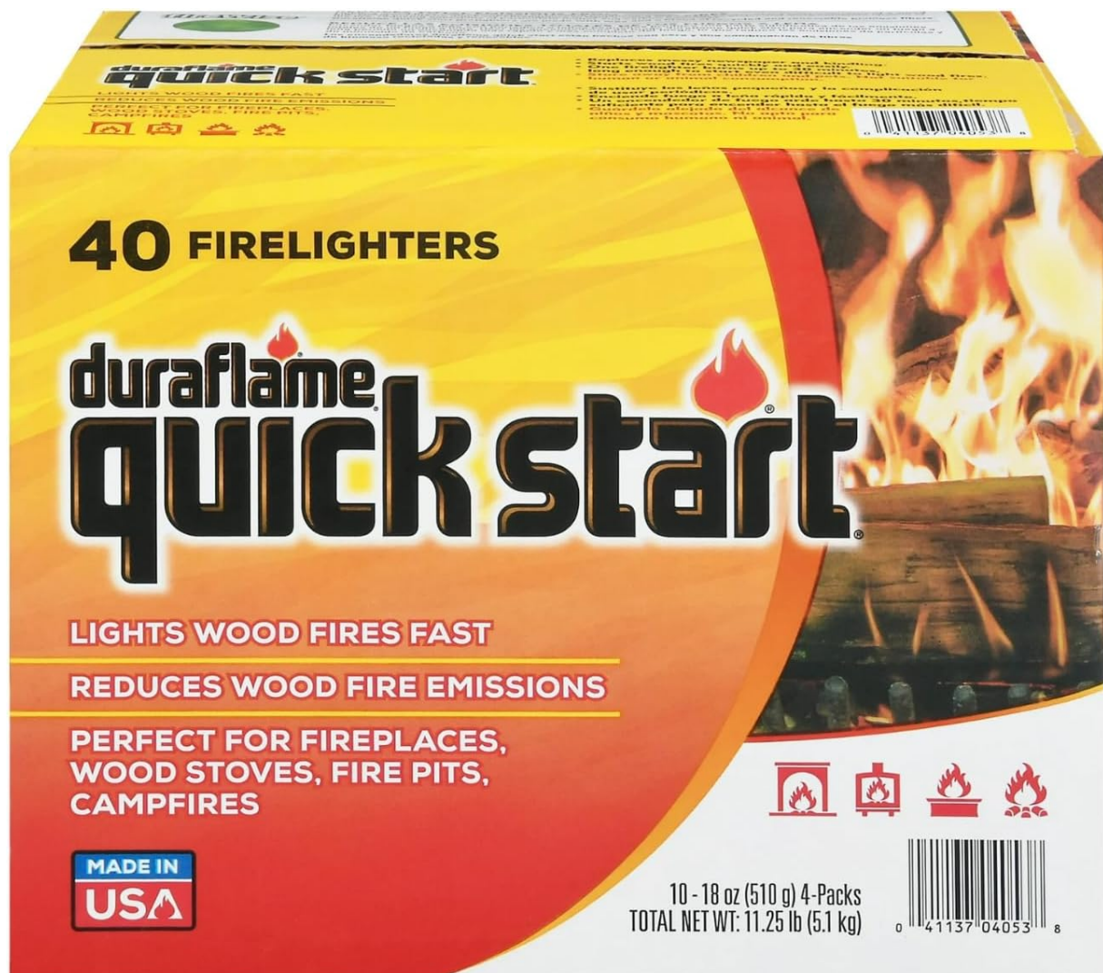
Image: A 4-pack of Duraflame Quick Start Firelighters, illustrating how they are packaged and can be separated.