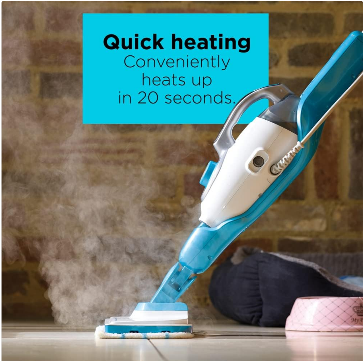
Figure 3: Quick Heating. The steam mop is shown actively producing steam on a tiled floor, demonstrating its rapid heat-up capability within 20 seconds.