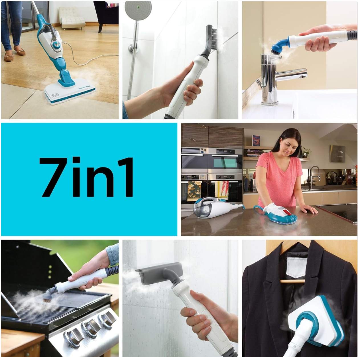
Figure 7: Versatile Cleaning Applications. This collage demonstrates the 7-in-1 functionality, showing the steam mop cleaning floors, the handheld steamer cleaning a toilet, a grill, a window, a kitchen counter, and steaming garments.