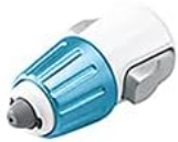
Adjustable Steam Nozzle