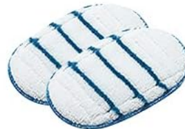
(2) Microfiber SteamGlove Pads