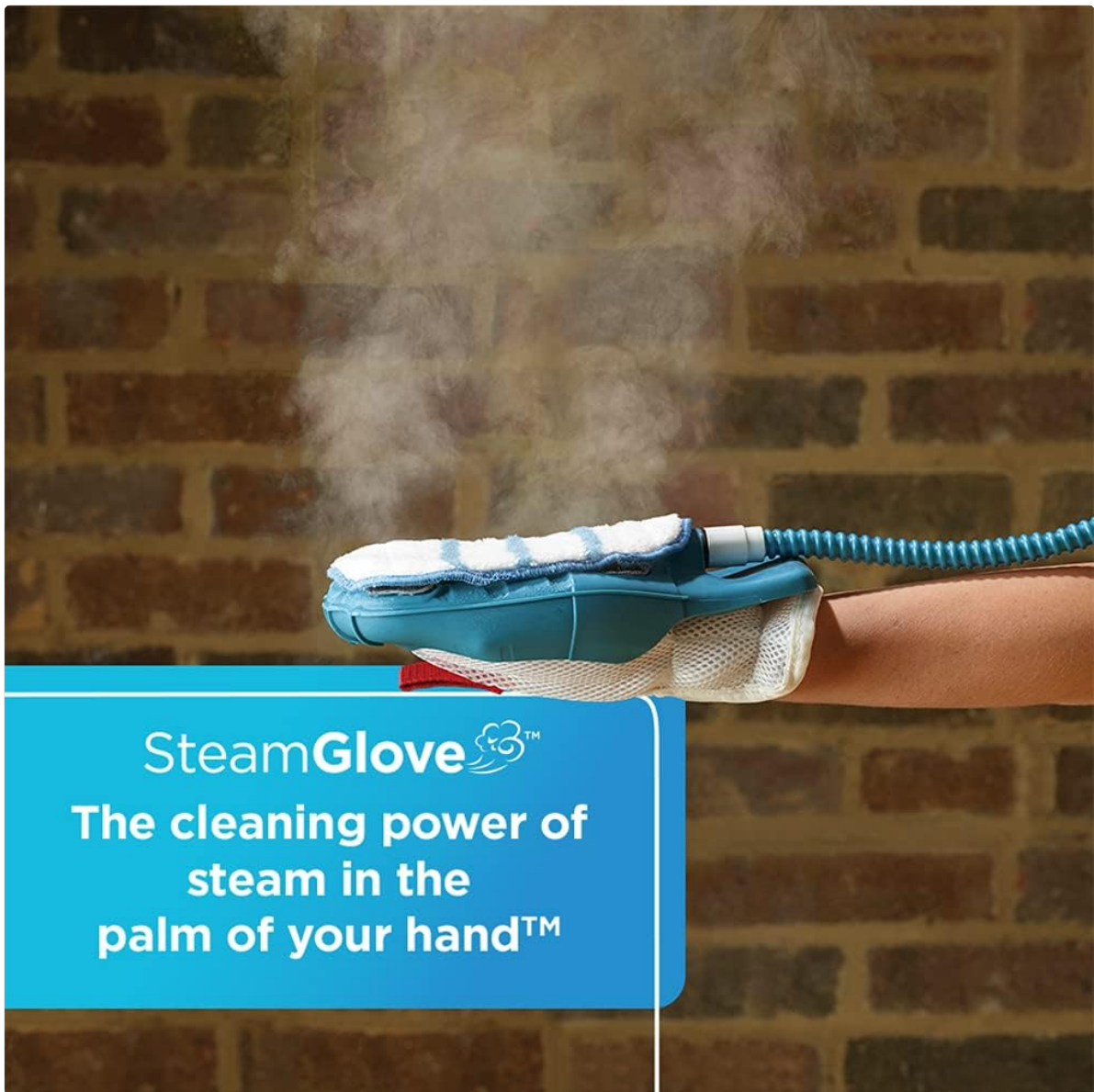
Figure 6: SteamGlove in Use. A person is using the SteamGlove to clean a surface, demonstrating the direct application of steam for effective cleaning.