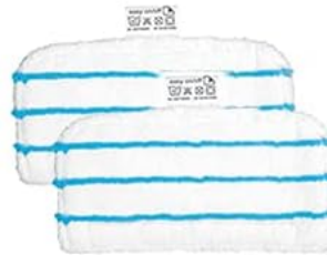
(2) Microfiber Mop Pads (SMP20)