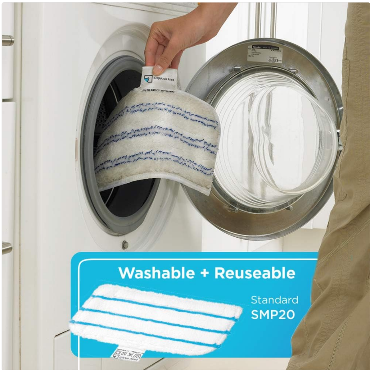
Figure 8: Washable and Reusable Pads. A microfiber mop pad is being inserted into a washing machine, illustrating that the pads are designed for easy cleaning and reuse.