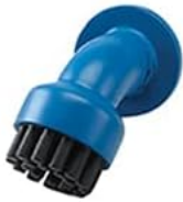
Small Detail/ Nylon Brush