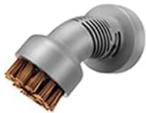
Copper Grate Cleaner