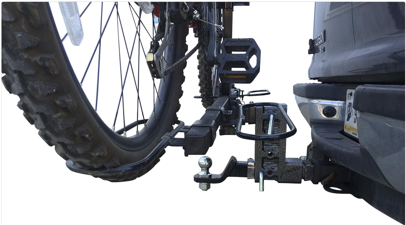
Figure 4.1: The GEN-Y GH-303 hitch installed on a vehicle, demonstrating its versatility with a bike rack and a ball mount.