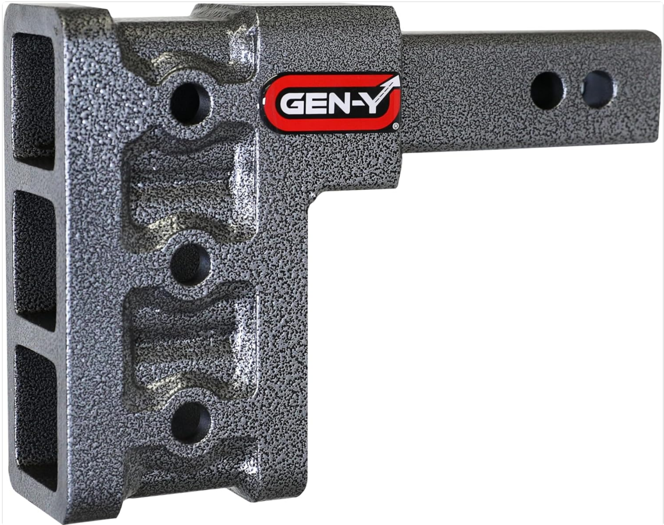
Figure 3.1: The GEN-Y GH-303 MEGA-Duty Adjustable Drop Hitch, showcasing its robust construction and multiple receiver points.