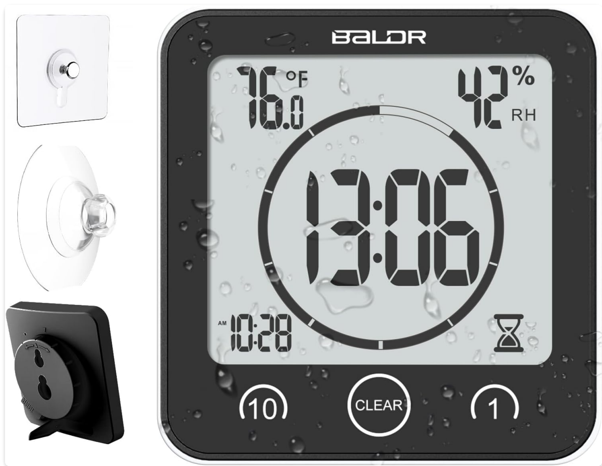
Image 1: The Baldr Shower Clock displaying current time, temperature, and humidity.