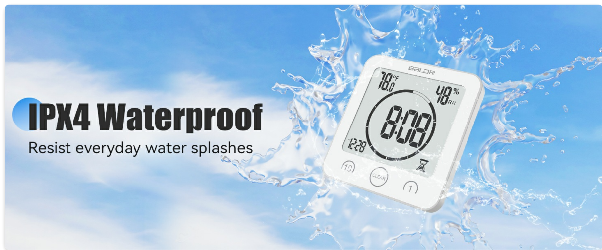
Image 2: Visual representation of the clock's 4-in-1 functions: Air Temperature, Relative Humidity, Clock, and Countdown Timer.