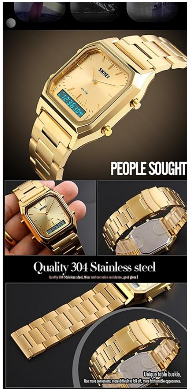
Image: Visual representation of key quality features of the SKMEI 1220 watch, including its quality movement, high hardness glass, and zinc alloy plating.