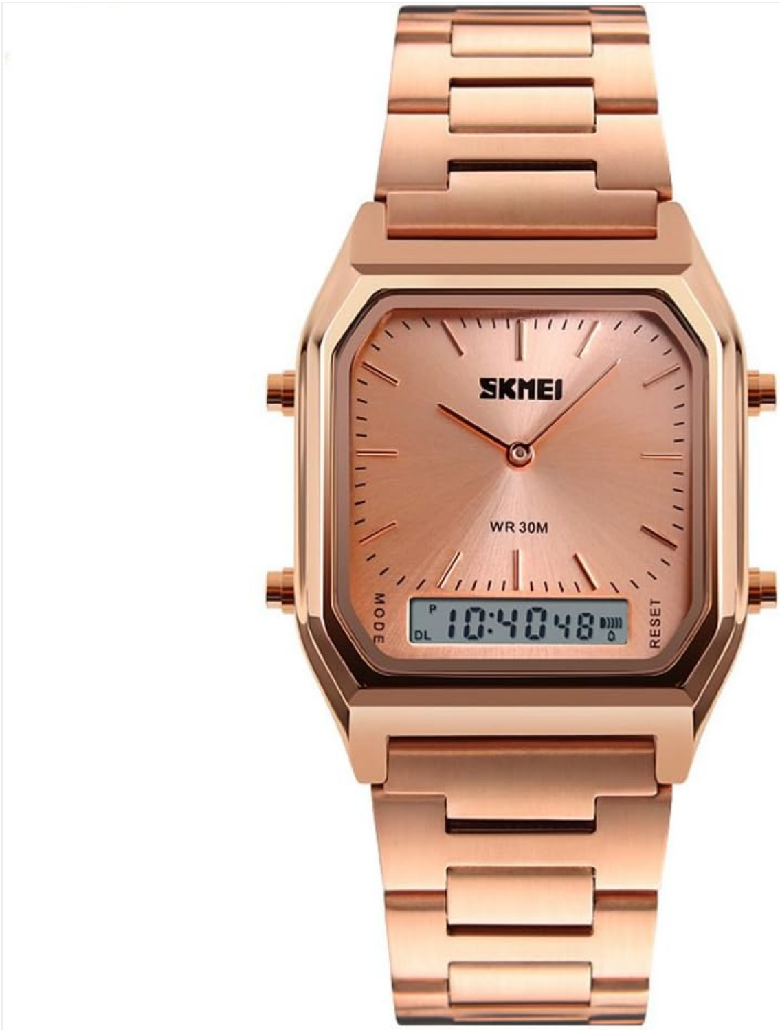
Image: Front view of the SKMEI 1220 watch, showcasing its square dial with both analog hands and a digital display, along with the brand logo and water resistance rating.