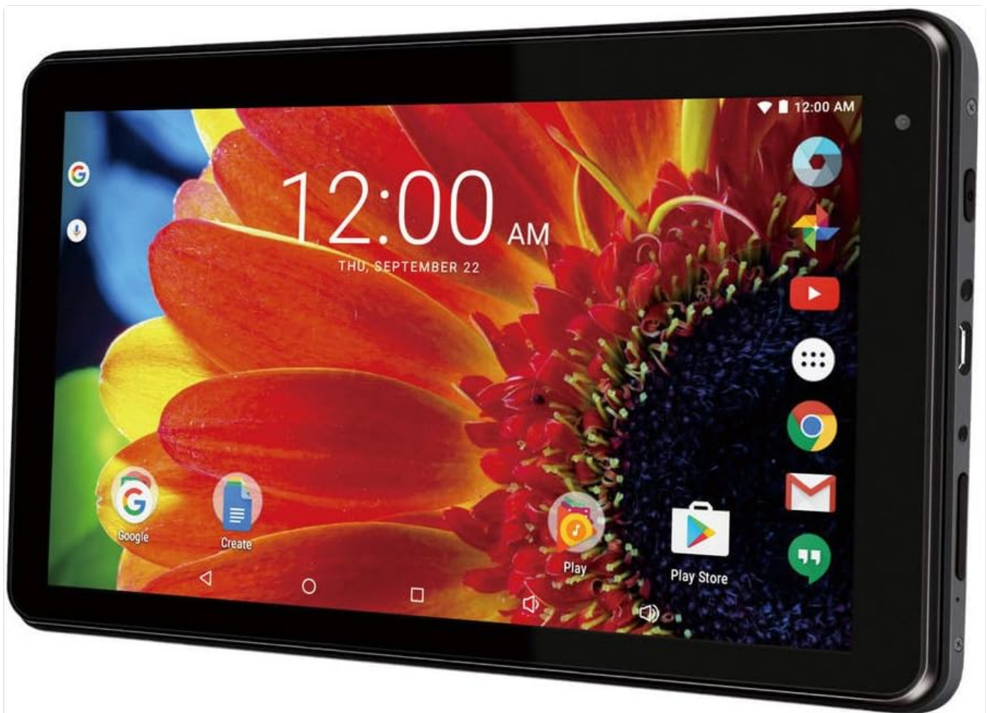
Figure 2: Side view of the RCA Voyager 7-inch tablet. This image highlights the tablet's right side, revealing the power button, volume rocker, headphone jack, and charging port. The tablet's slim profile is also visible.