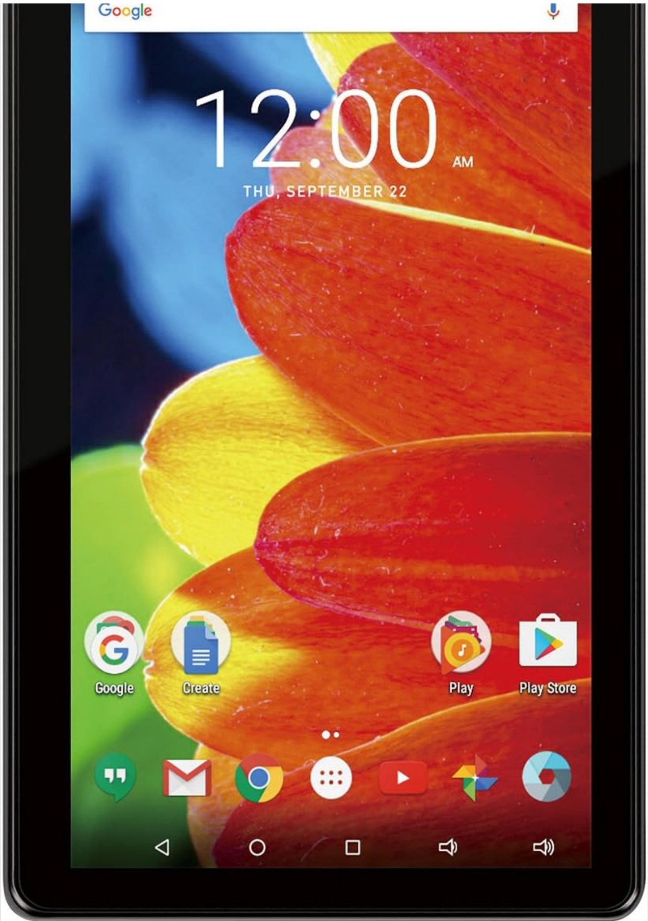
Figure 1: Front view of the RCA Voyager 7-inch tablet. This image shows the tablet's display, which features the current time, date, Google search bar, and various application icons including Google, Create, Play, and Play Store. The tablet has a black bezel around the screen.