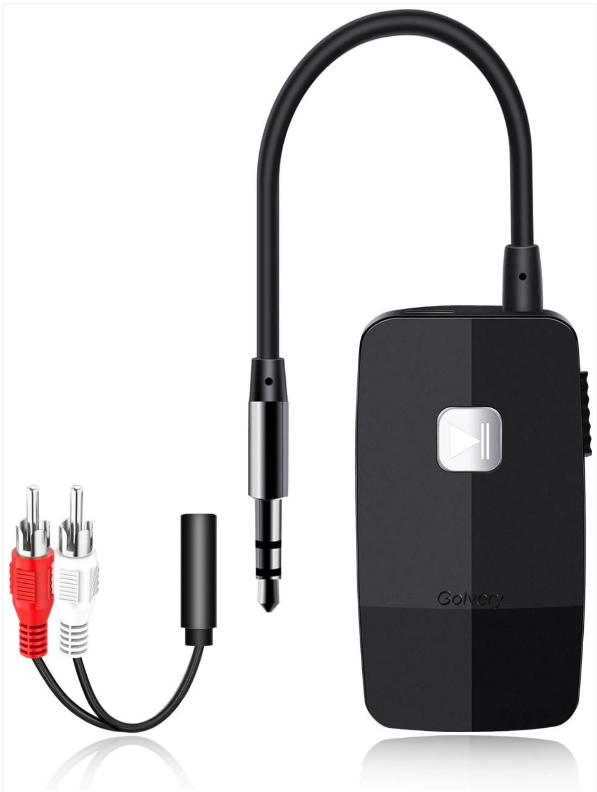
Image: Front view of the Golvery J205 Bluetooth receiver, showing the integrated 3.5mm audio jack, play/pause button, and included RCA adapter cable.