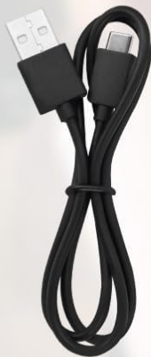
1x USB-C Charging Cable