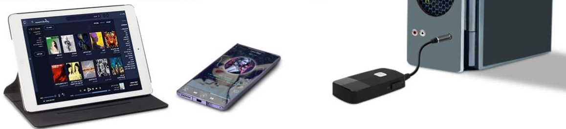
Image: The Golvery J205 Bluetooth receiver shown connected to both a tablet and a smartphone, illustrating its dual connection capability.