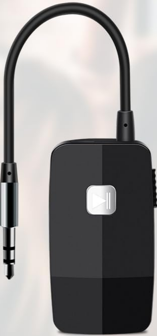
1x J205 Bluetooth Receiver with 3.5mm cable