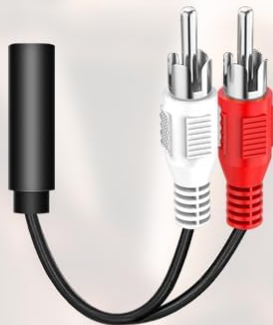
1x RCA Audio Cable