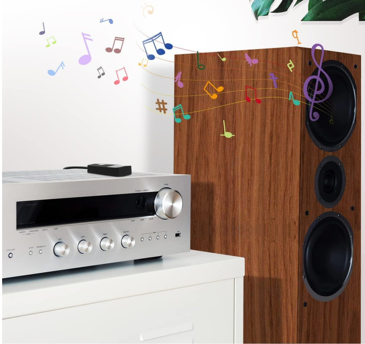
Image: The Golbery J205 Bluetooth receiver placed on top of a home stereo receiver, connected via its audio cable, enabling wireless audio streaming.