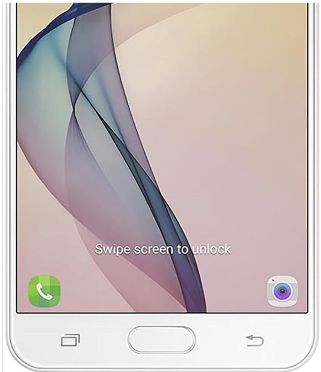
Figure 2.1: Front View. This image displays the front of the Samsung Galaxy J7 Prime. Key features visible include the 5.5-inch display, the front-facing camera at the top, the earpiece, and the physical home button at the bottom, which also houses the fingerprint sensor.