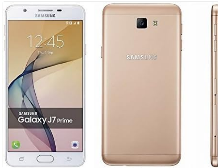
Figure 2.3: Multi-Angle View. This composite image provides a comprehensive look at the Samsung Galaxy J7 Prime from various angles, including the front, back, and side profiles. It highlights the phone's overall design and the placement of buttons and ports along the edges.