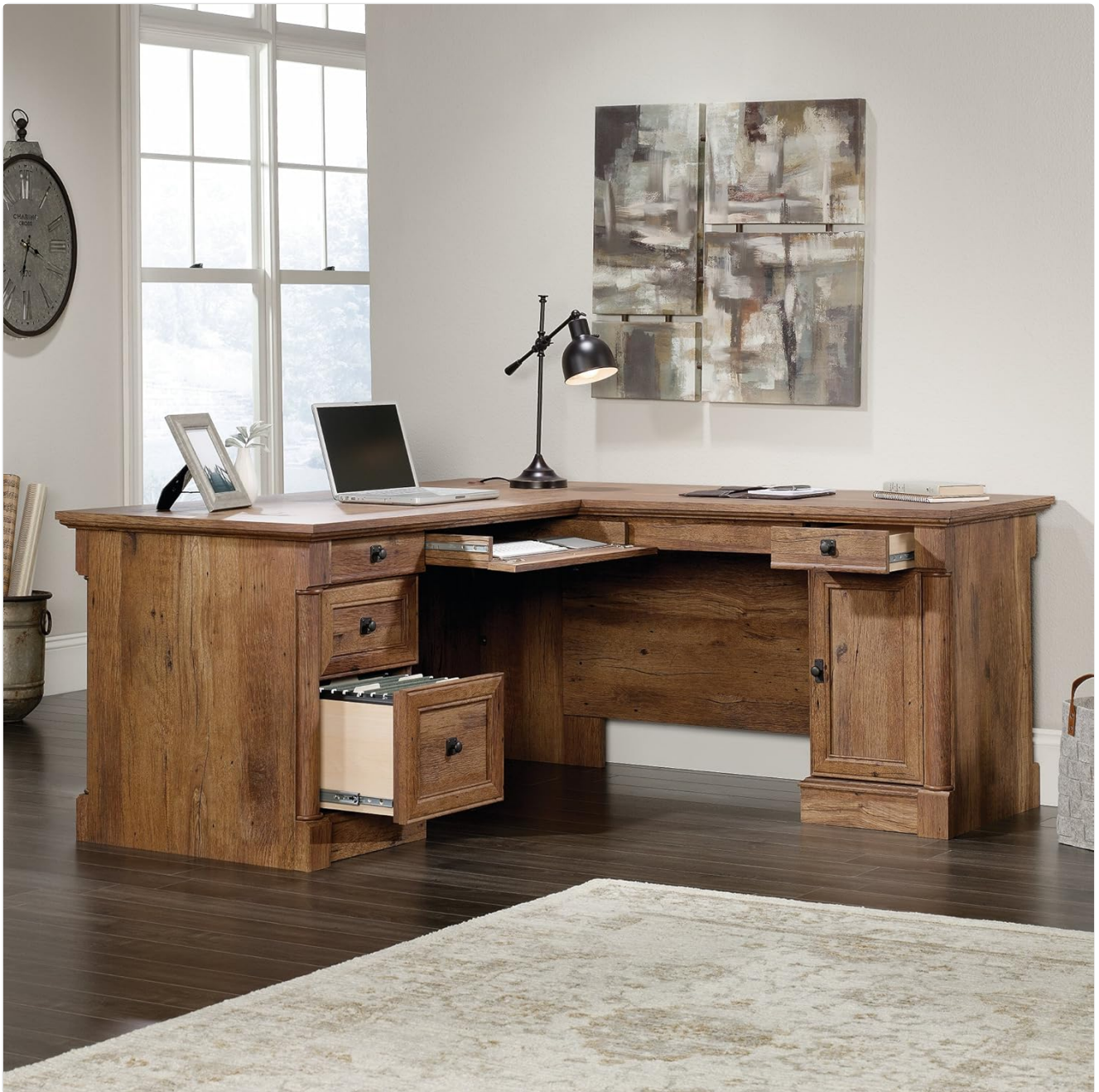
Image: The desk with its keyboard tray extended and the file drawer open, demonstrating functional access.

The center drawer features a flip-down panel, allowing it to function as a keyboard tray or a shelf for a laptop. This panel can be positioned on either the left or right side during assembly to suit your preference.