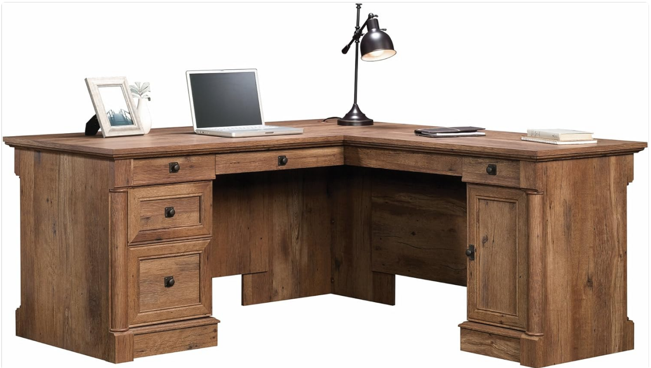
Image: The Sauder Palladia L-Shaped Desk, showcasing its Vintage Oak finish and spacious design.

The Sauder Palladia L-Shaped Desk is designed to provide a functional and stylish workspace. It features a versatile L-shaped configuration, multiple storage options including a file drawer, additional utility drawers, and a concealed storage area for a CPU tower. The desk also incorporates cable management grommets and a flip-down panel for a keyboard or laptop.