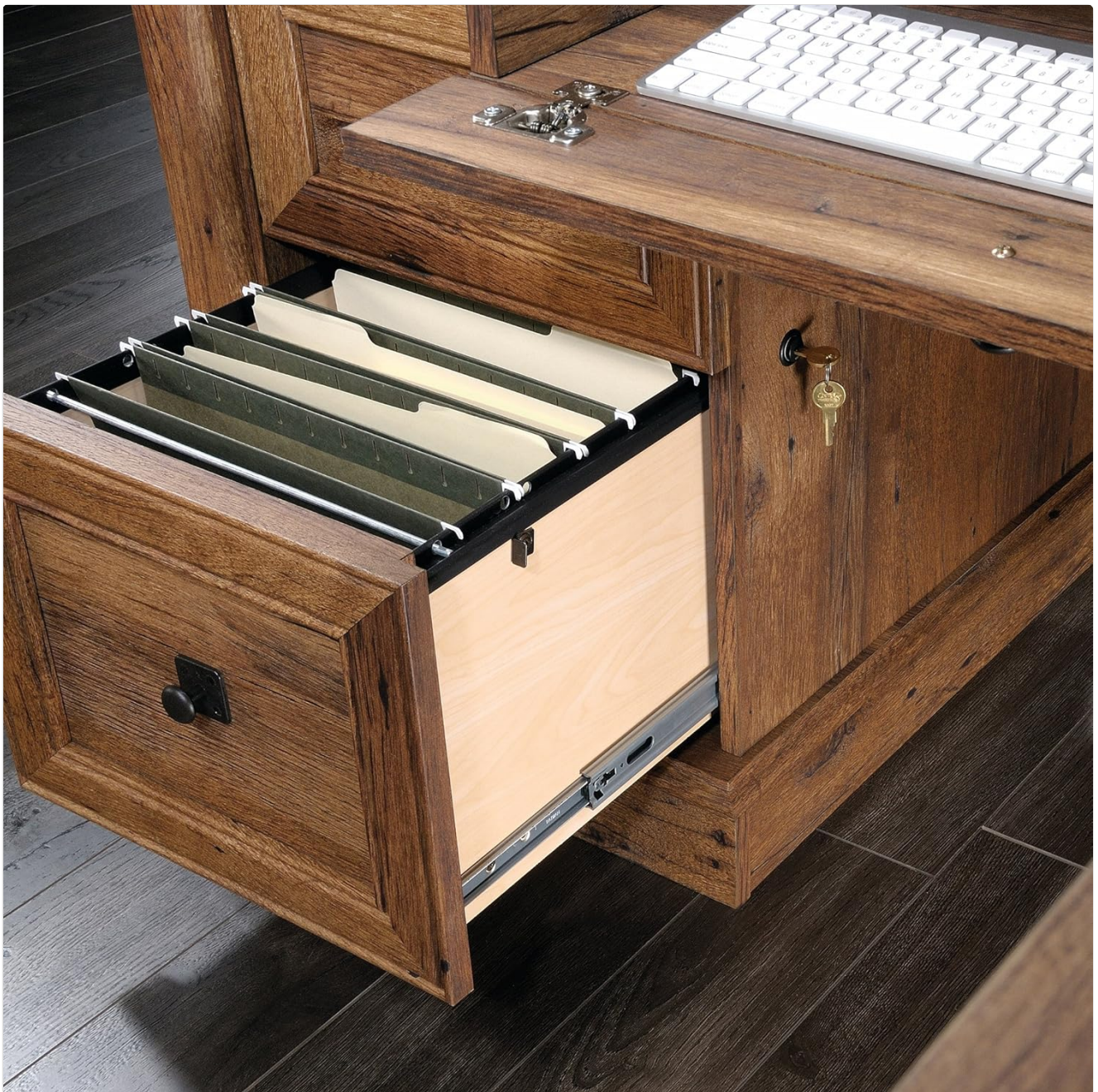
Image: A close-up view of the file drawer, showing its full extension and capacity for hanging files.