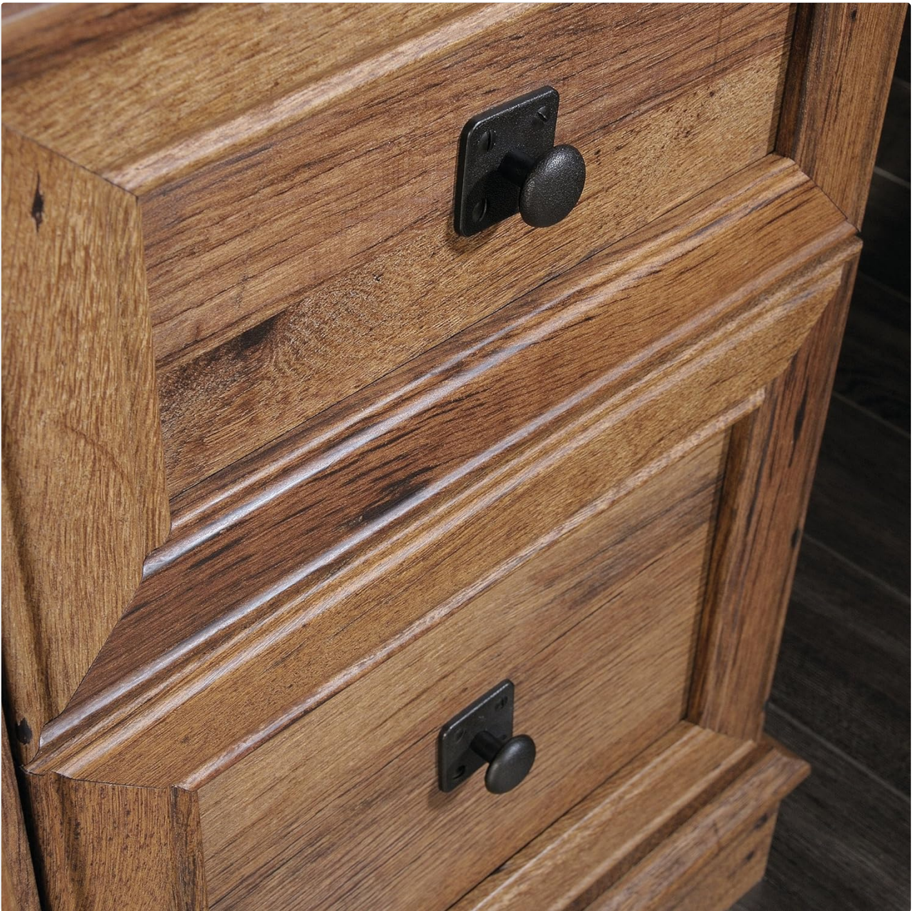
Image: A detailed view of the desk's drawer pulls, highlighting the design and finish.