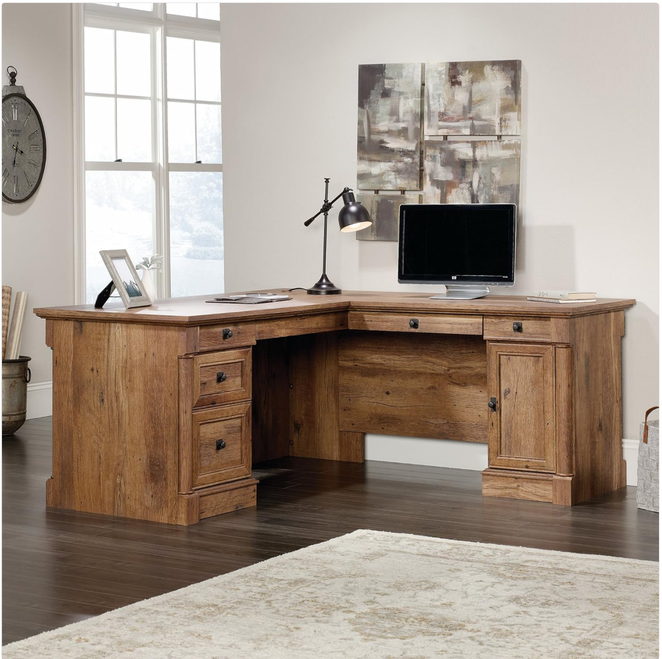
Image: The L-shaped desk positioned in a home office environment, demonstrating its integration into a living space.