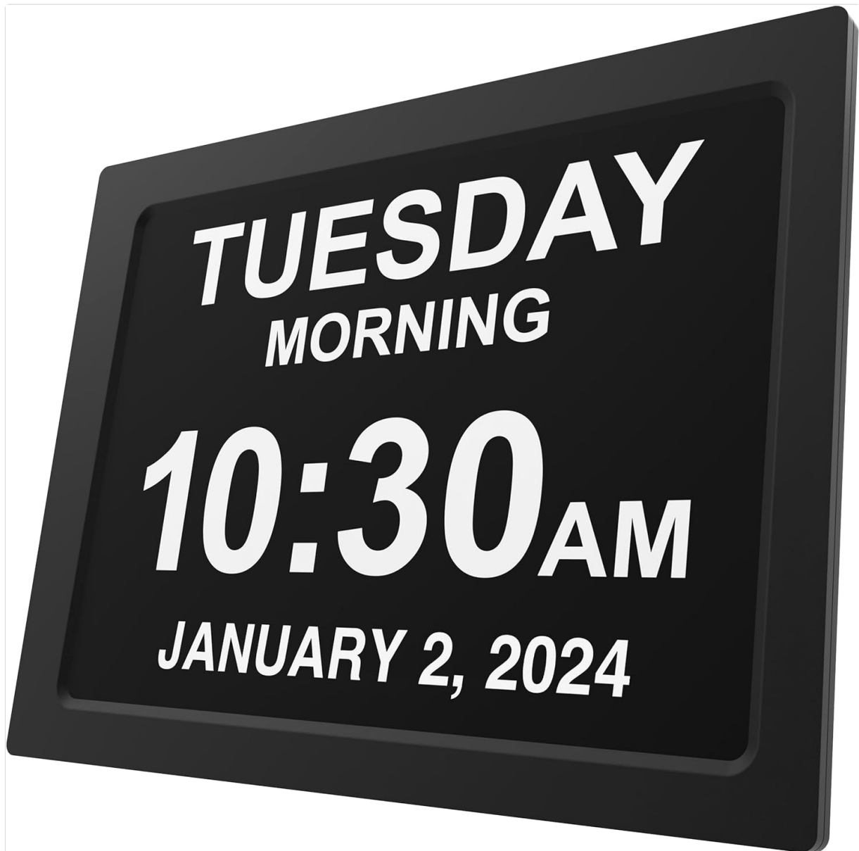
Image: The American Lifetime Dementia Clock 2025 displaying the time, day, and date clearly.

the keyhole slot on the back. Ensure it is in a visible location for the user.