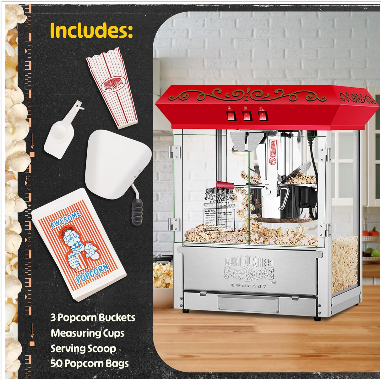
Image: Included accessories such as popcorn buckets, measuring cups, serving scoop, and popcorn bags.