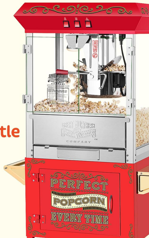
Image: Visual guide for the popcorn popping process, including preheating the kettle, adding ingredients, and dumping the kettle.