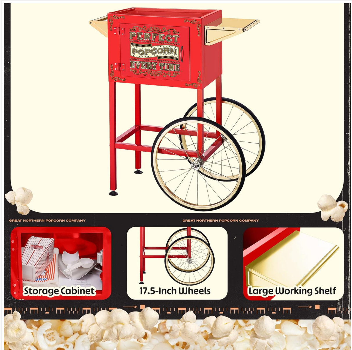
Image: The detachable cart features a storage cabinet, 17.5-inch wheels, and a large working shelf.