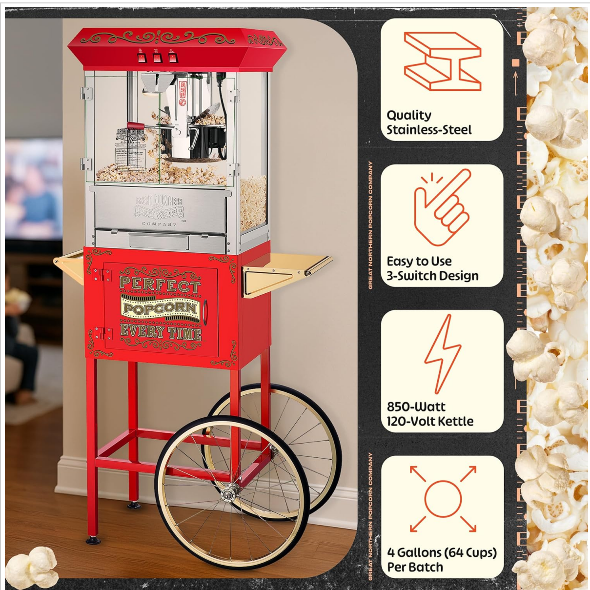
Image: Overview of product features including stainless steel construction, 3-switch operation, 850-watt kettle, and a capacity of up to 4 gallons (64 cups) per batch.