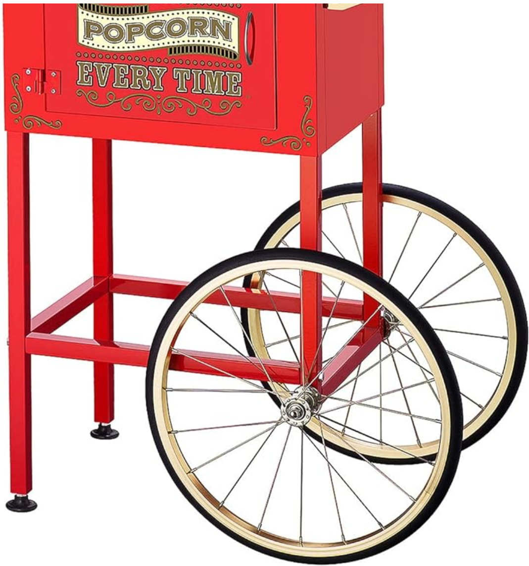
Image: The Great Northern Popcorn Company 5995 10 oz. Perfect Popper Popcorn Machine with Cart, featuring a red finish and vintage design.