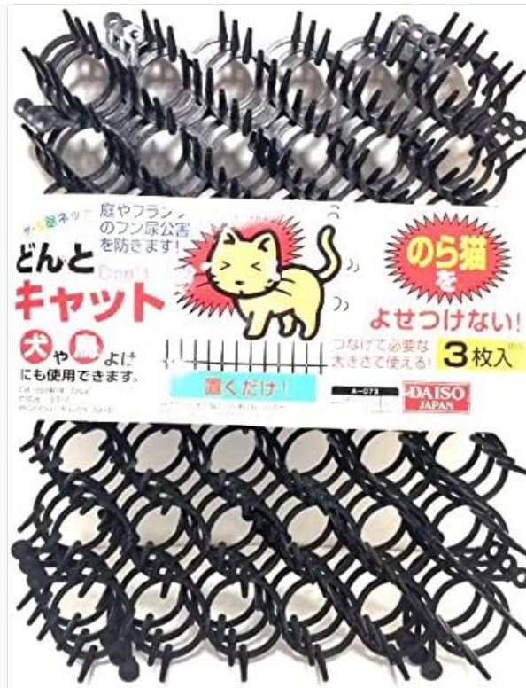
Image 3.1: Stacked Daiso Japan Cat Repellent Mats, illustrating their compact form and packaging.