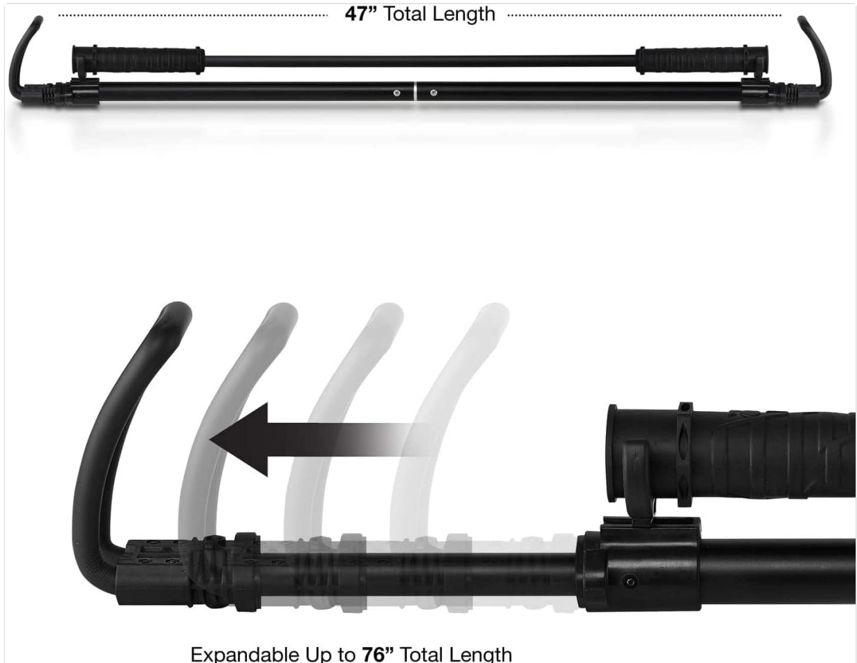
Image: The NEIKO 40447A work light demonstrating its extendable feature, adjusting from 47 inches to 76 inches to fit various hood sizes.