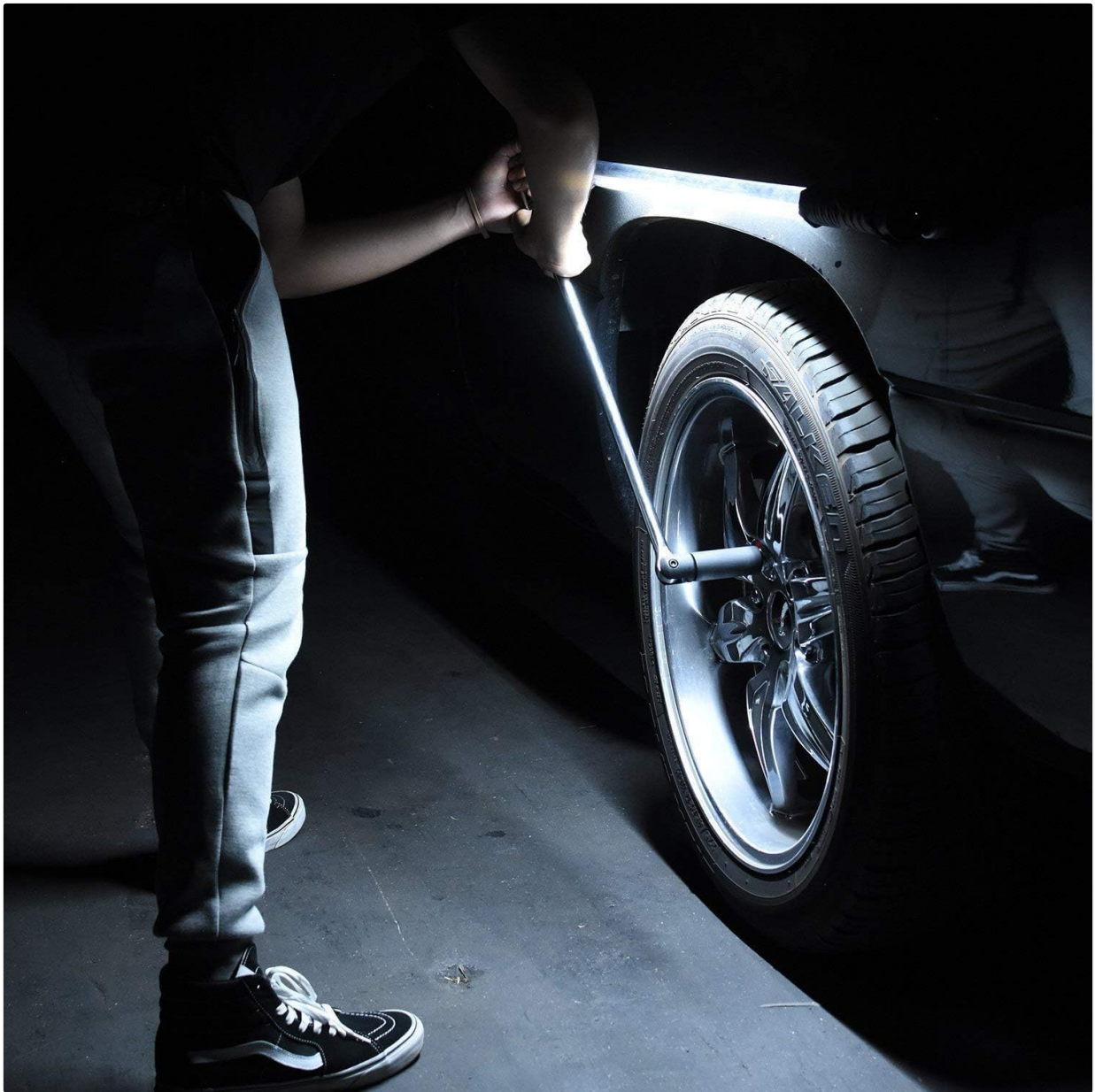
Image: The NEIKO 40447A work light magnetically attached to the side of a car, illuminating the wheel well area for tire changes or brake inspections.