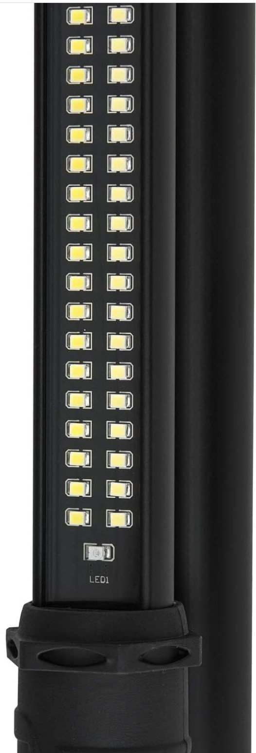
Image: A close-up of the NEIKO 40447A work light, detailing its 202 SMD LED bulbs, 8000mAh Li-ion battery, and illustrating the high (1200 lumens) and low (600 lumens) brightness modes with their respective run times.