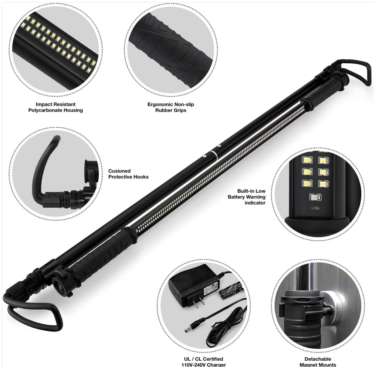
Image: An exploded view of the NEIKO 40447A work light, highlighting its impact-resistant housing, ergonomic grips, cushioned protective end hooks, low battery indicator, UL/CL certified charger, and detachable magnetic mounts.