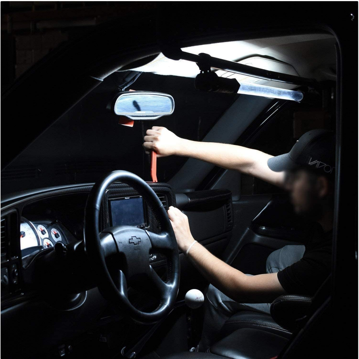
Image: The NEIKO 40447A work light positioned inside a car, providing ample light for interior detailing or repairs.