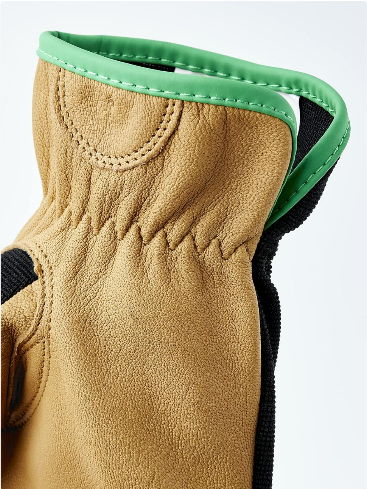
Image: Close-up of the elastic cuff, providing a snug and secure fit.