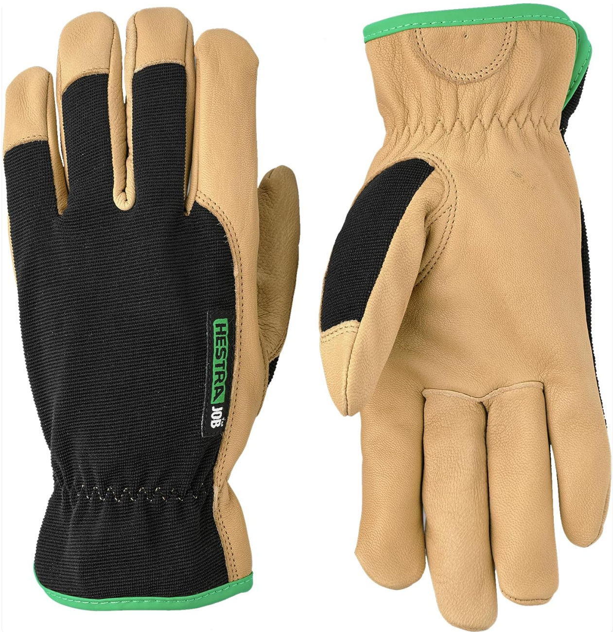
Image: A pair of HESTRA Job Kobolt Leather Gloves, showcasing the tan leather palm, black fabric backhand, and green trim.