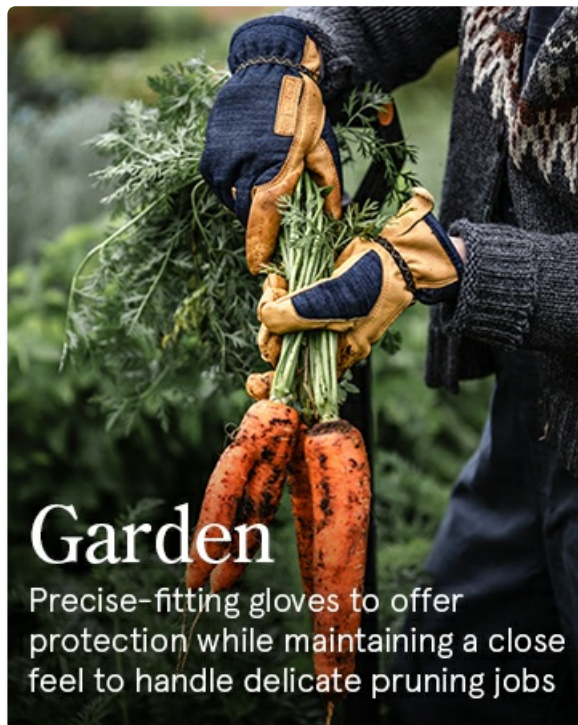
Image: HESTRA Job Kobolt gloves providing protection during gardening tasks.