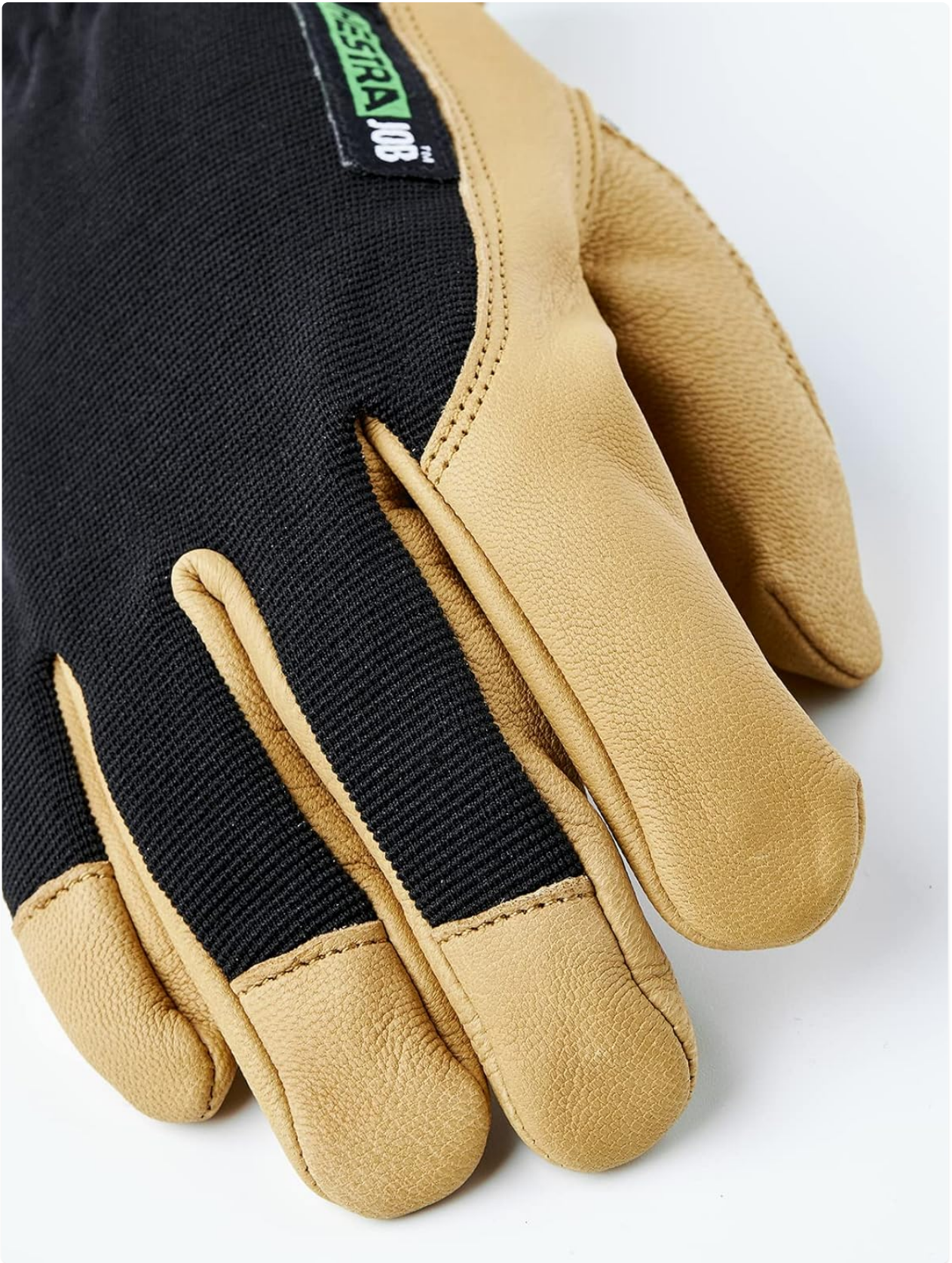
Image: Close-up of the reinforced fingertips, designed for enhanced durability and grip.