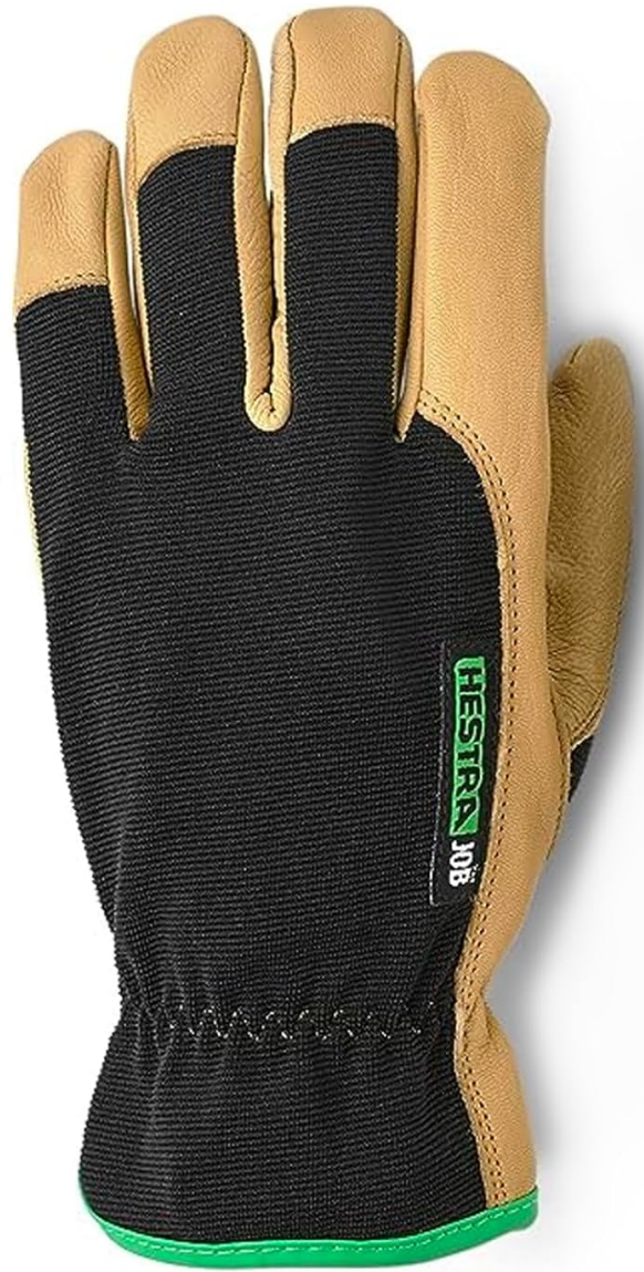
Image: Detailed view of the HESTRA Job Kobolt Glove highlighting the supple goatskin leather, breathable mesh backhand, and reinforced fingertips.

Reinforced fingertips for high durability