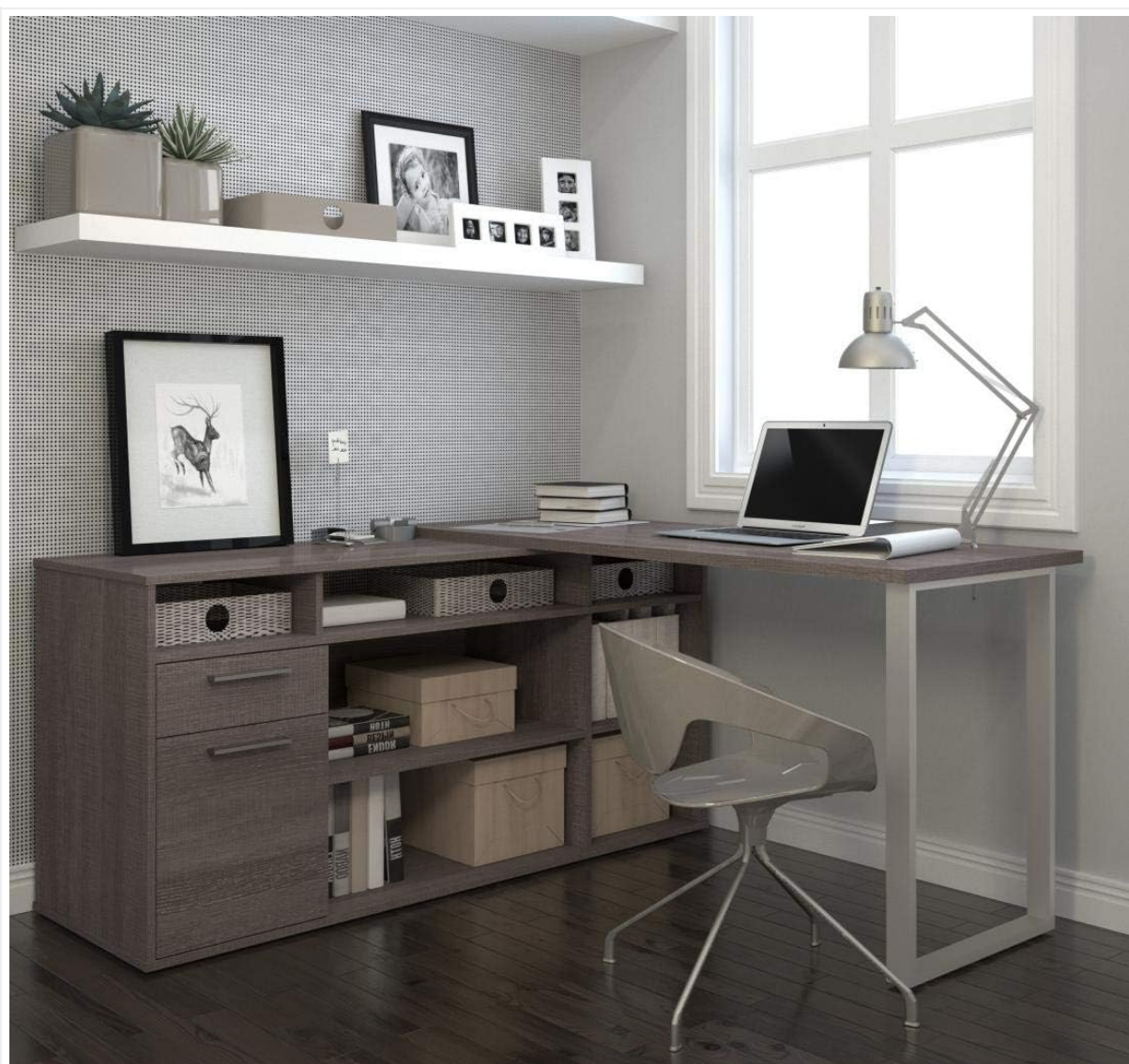
Image: The Bestar Solay L-Shaped Desk integrated into a home office environment, showcasing its functional design and storage capabilities.