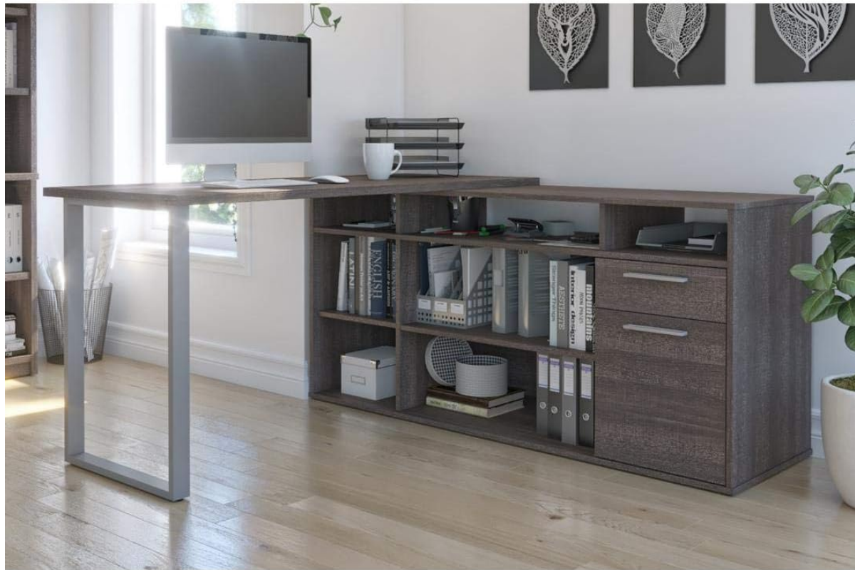
Image: A closer view of the Bestar Solay L-Shaped Desk, highlighting the integrated open shelves, utility drawer, and file drawer for organized storage.