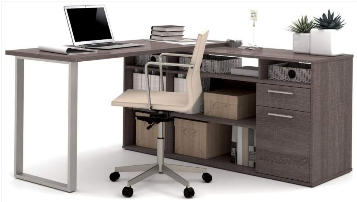
Image: The Bestar Solay L-Shaped Desk in Bark Grey, featuring a laptop, office chair, and various office accessories, demonstrating its practical use.

Position your computer, monitor, and other equipment on the desk surface. Utilize the integrated storage to keep your workspace tidy and functional.