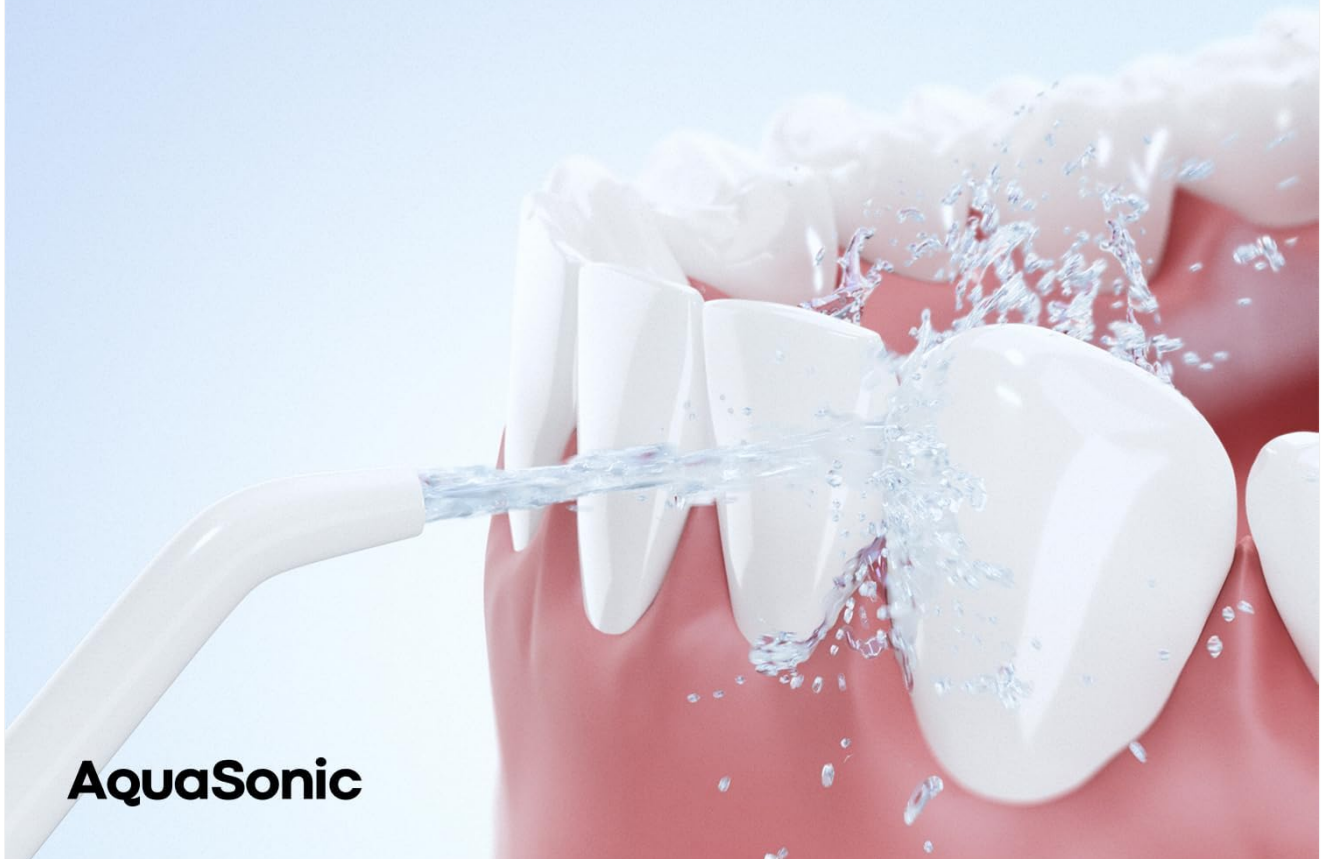
Image: An illustration demonstrating how the water jet from the AquaSonic Water Flosser cleans effectively between teeth and along the gumline.