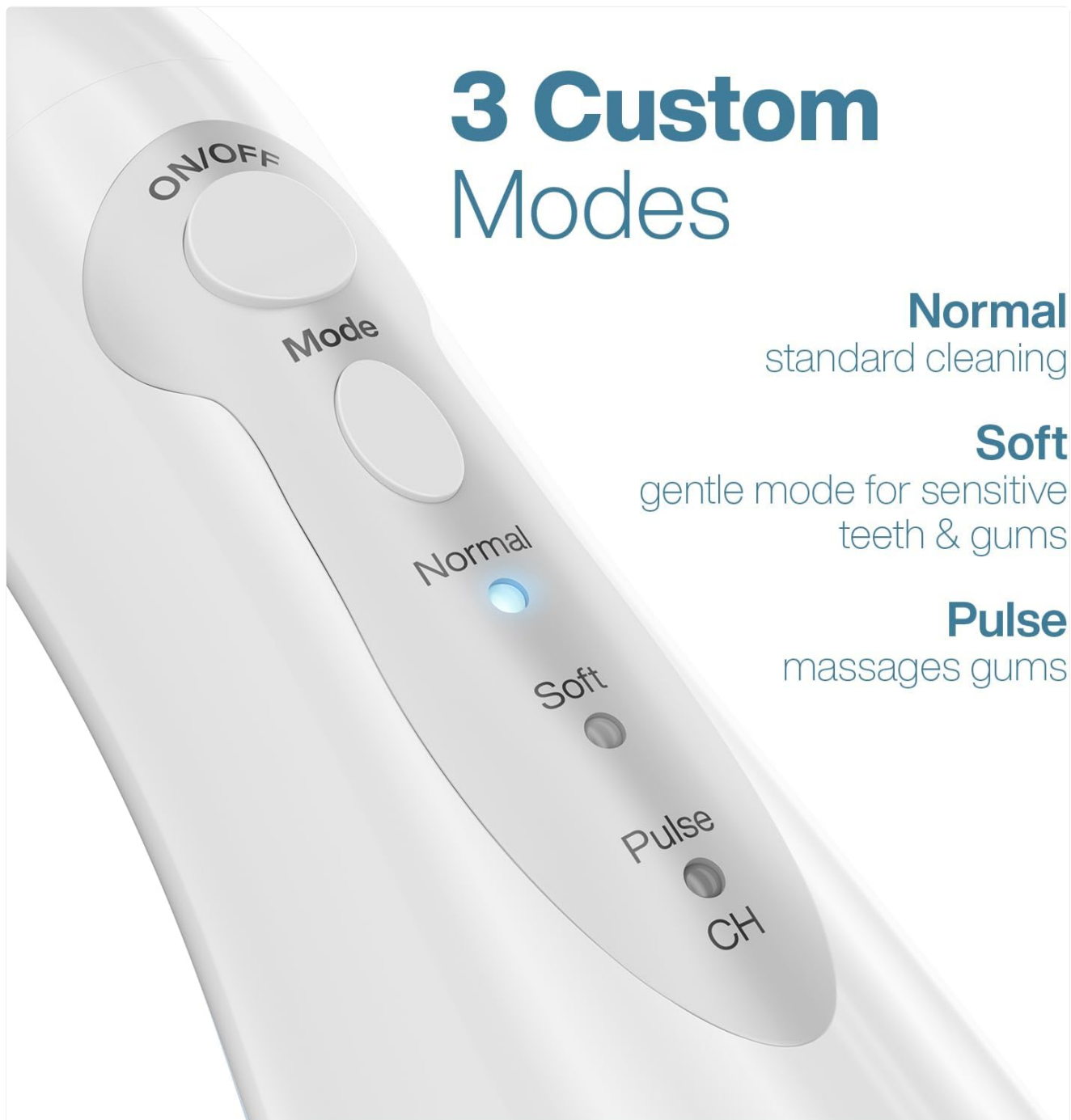
Image: A detailed view of the AquaSonic Water Flosser's control panel, showing the On/Off button and the Mode button with indicators for Normal, Soft, and Pulse settings.

To select a mode, press the 'Mode' button repeatedly until the indicator light for your desired mode illuminates.