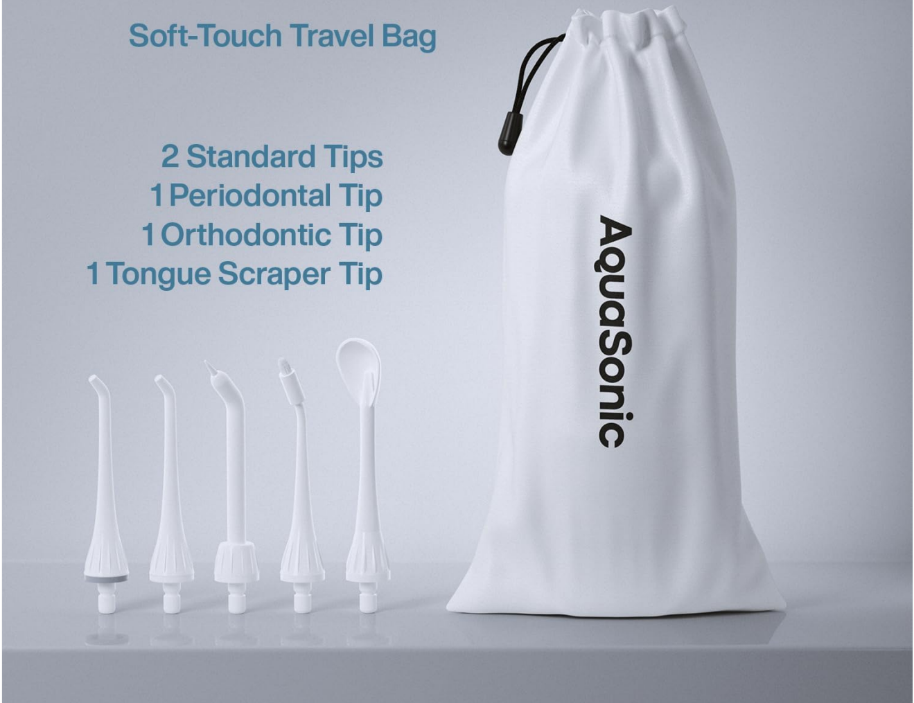
Image: The AquaSonic Water Flosser's included accessories: a soft-touch travel bag and five different jet tips.