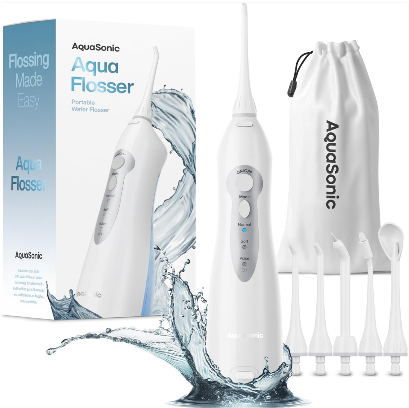
Image: The AquaSonic Water Flosser unit, its packaging, and the included jet tips and travel bag.