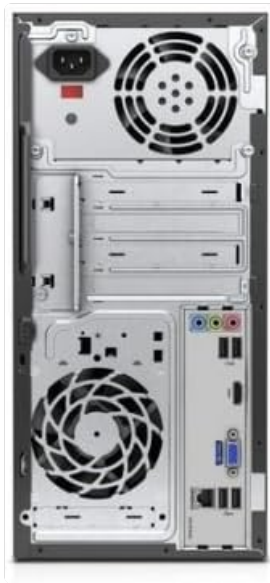
Image: Rear view of the HP Pavilion Desktop PC. This image displays the power input, multiple USB ports, Ethernet port, HDMI, and VGA ports for connecting external devices.