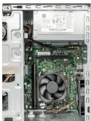
Image: Internal view of the HP Pavilion Desktop PC. This shows the internal components, including the motherboard and cooling fan. For internal cleaning or component upgrades, professional assistance is recommended.