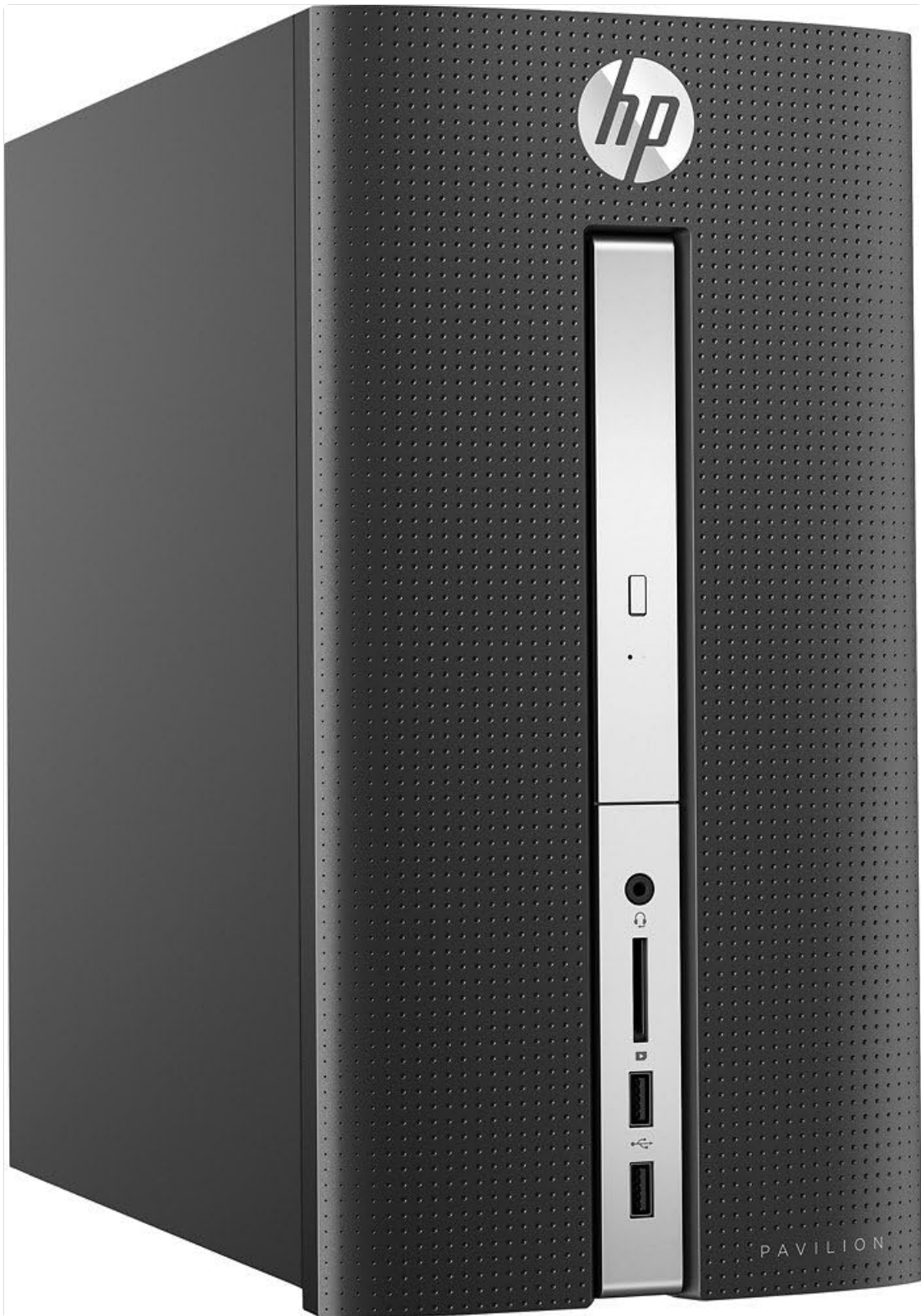
Image: Front view of the HP Pavilion Desktop PC. This view highlights the accessible front ports including USB, headphone/microphone jack, and the optical drive.