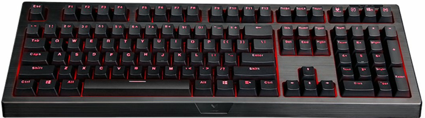
Image: The Rapoo V510 keyboard with an icon indicating its conflict-free design, allowing multiple simultaneous key presses.