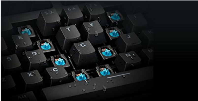
Image: A close-up view of the Rapoo V510 key switches with water droplets, illustrating the keyboard's spill-resistant capabilities.