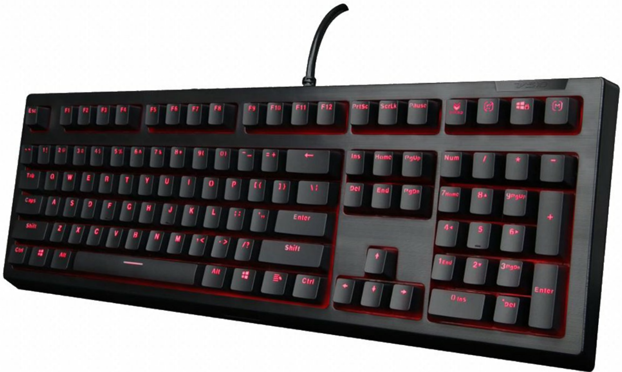
Image: A close-up view highlighting the mechanical key switches of the Rapoo V510 keyboard.